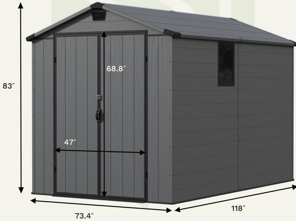
Image 8.1: Dimensional overview of the Patiowell 6x10 FT storage shed.