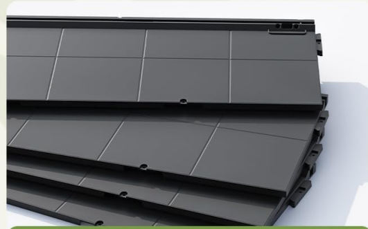
Enhanced Floor Possess superior load-bearing capabilities