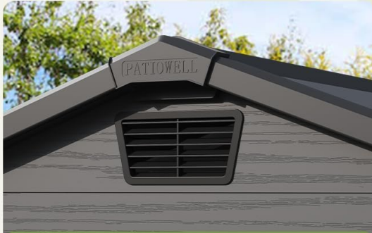
Vent Design Keep Items Dry And Fresh

Natural light illuminates the interior for easy access, while the vent design and waterproof roof design securely and dry stores your essentials with the elegance of wood-textured panels—minus the upkeep.