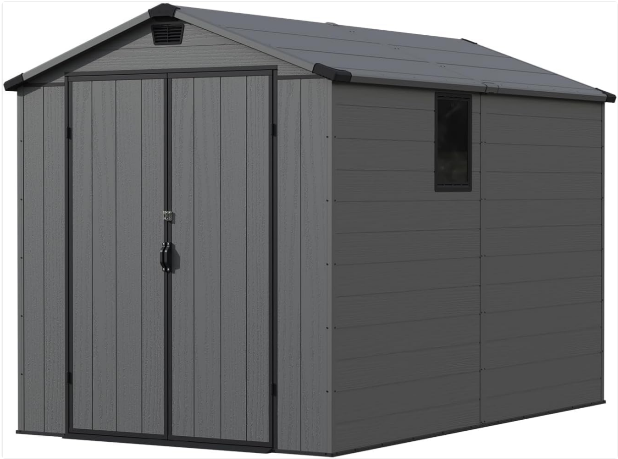
Image 1.1: Patiowell 6 x 10 FT Outdoor Plastic Storage Shed, front view.