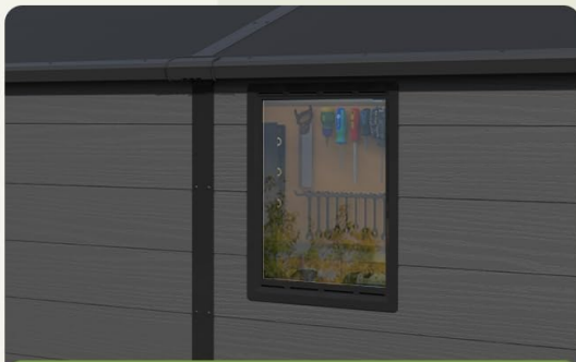
Windows Design Natural Light for Easy Access