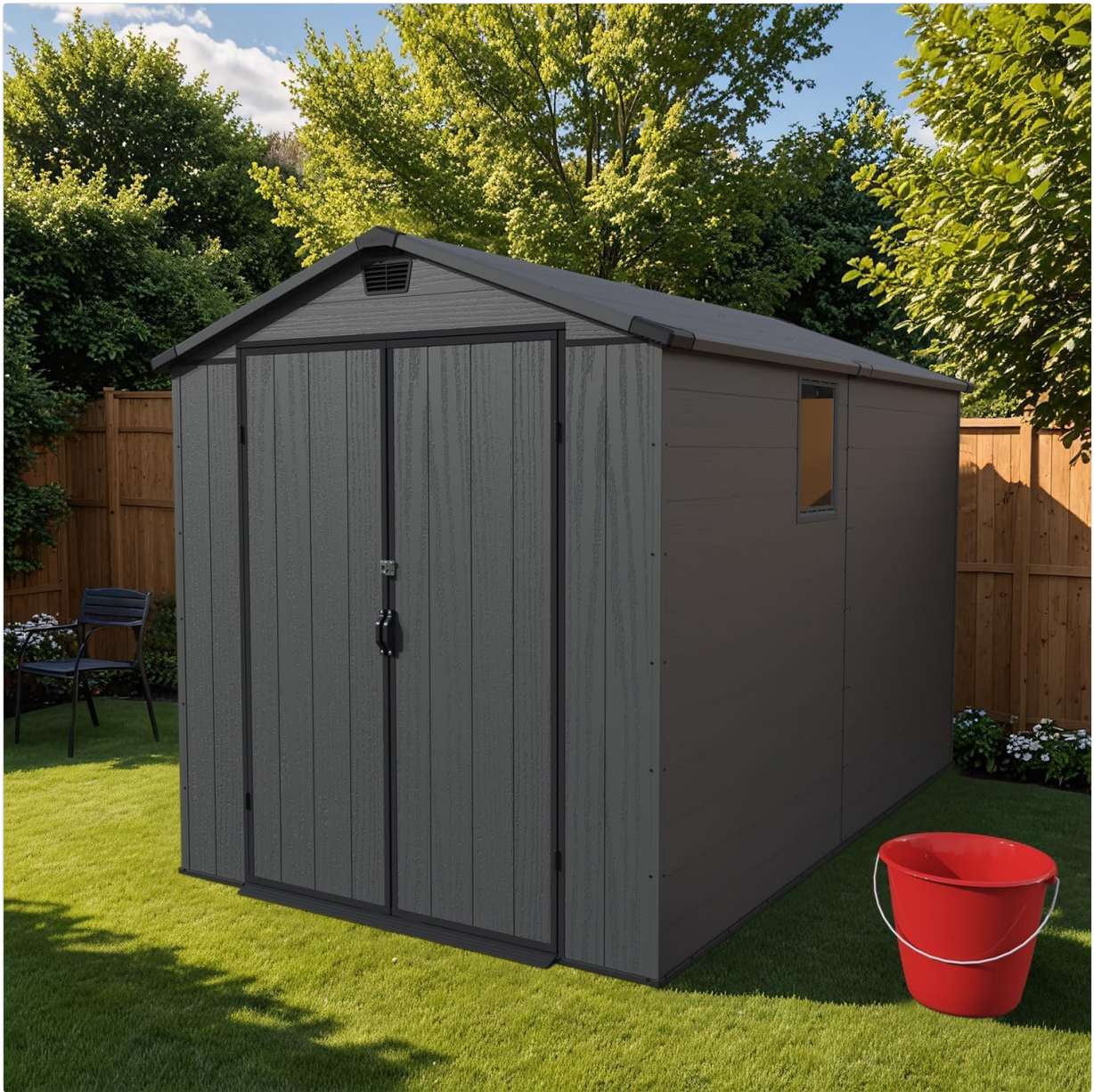
Image 4.1: Assembled Patiowell storage shed in an outdoor setting.