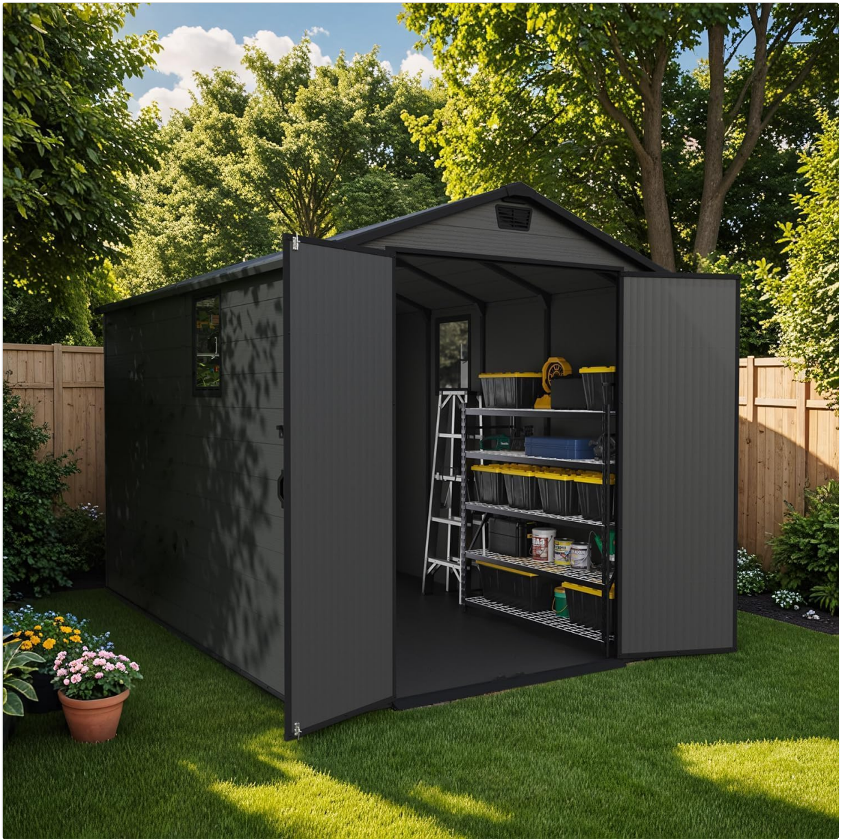
Image 8.2: Interior capacity of the shed, demonstrating storage for tools and equipment.