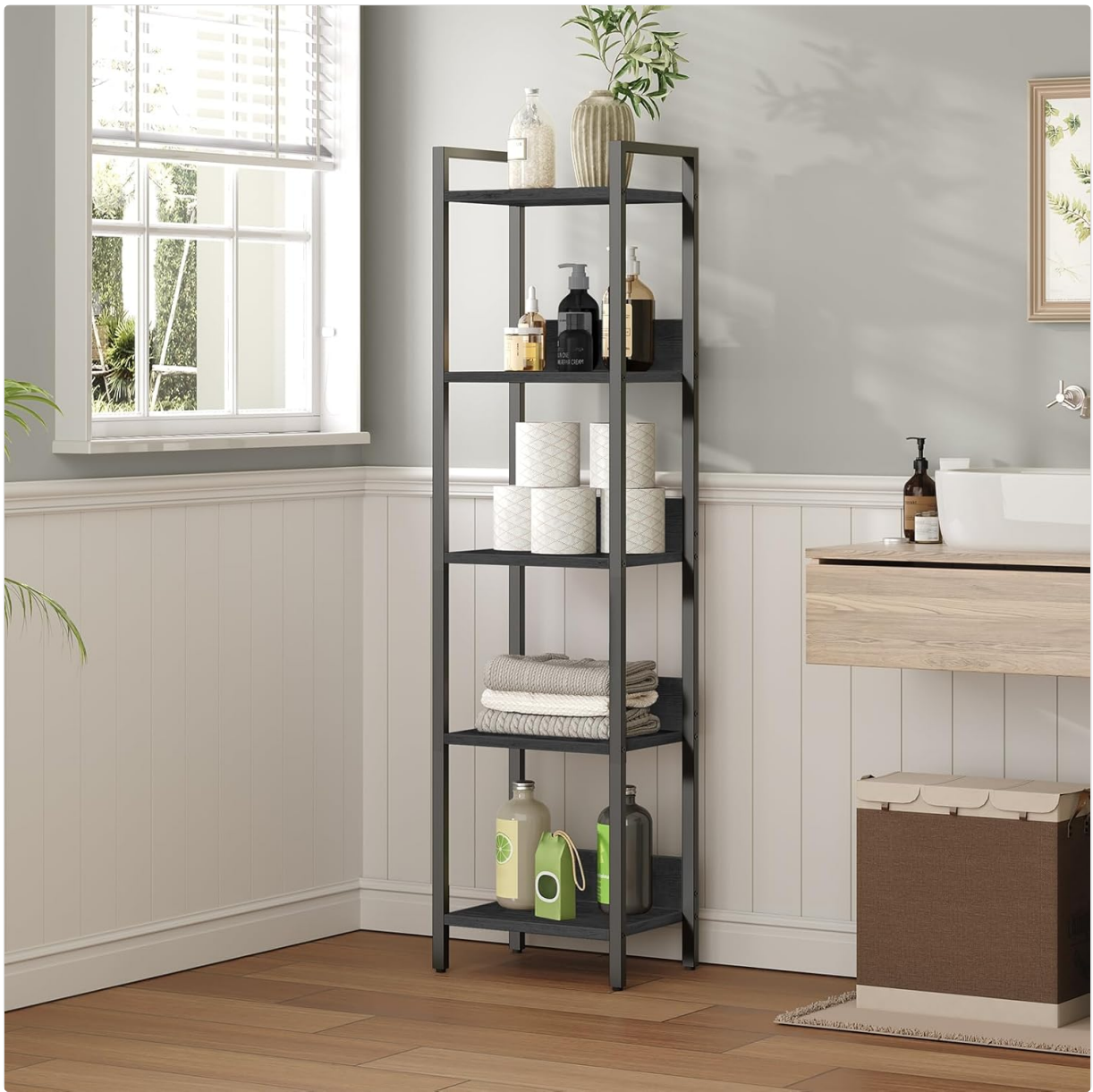
Image 4: The shelf utilized in a bathroom, demonstrating its suitability for storing towels, lotions, and other bathroom items.

Your browser does not support the video tag.