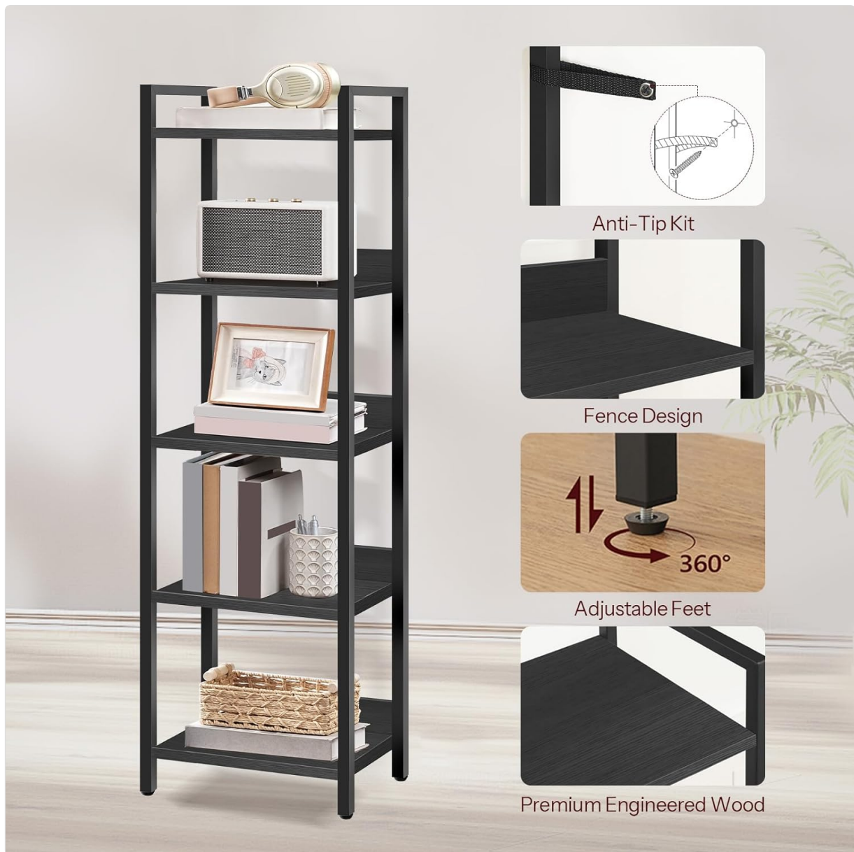
Image 3: Key features of the shelf, highlighting the anti-tip kit for safety, fence design to prevent items from falling, adjustable feet for stability on uneven surfaces, and the premium engineered wood material.