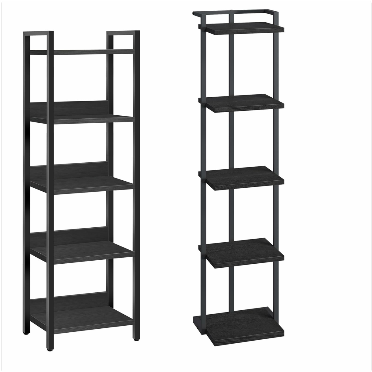
Image 1: The MAHANCRIIS Storage Shelf Organizer in a home office setting, showcasing its compact design and storage capabilities.