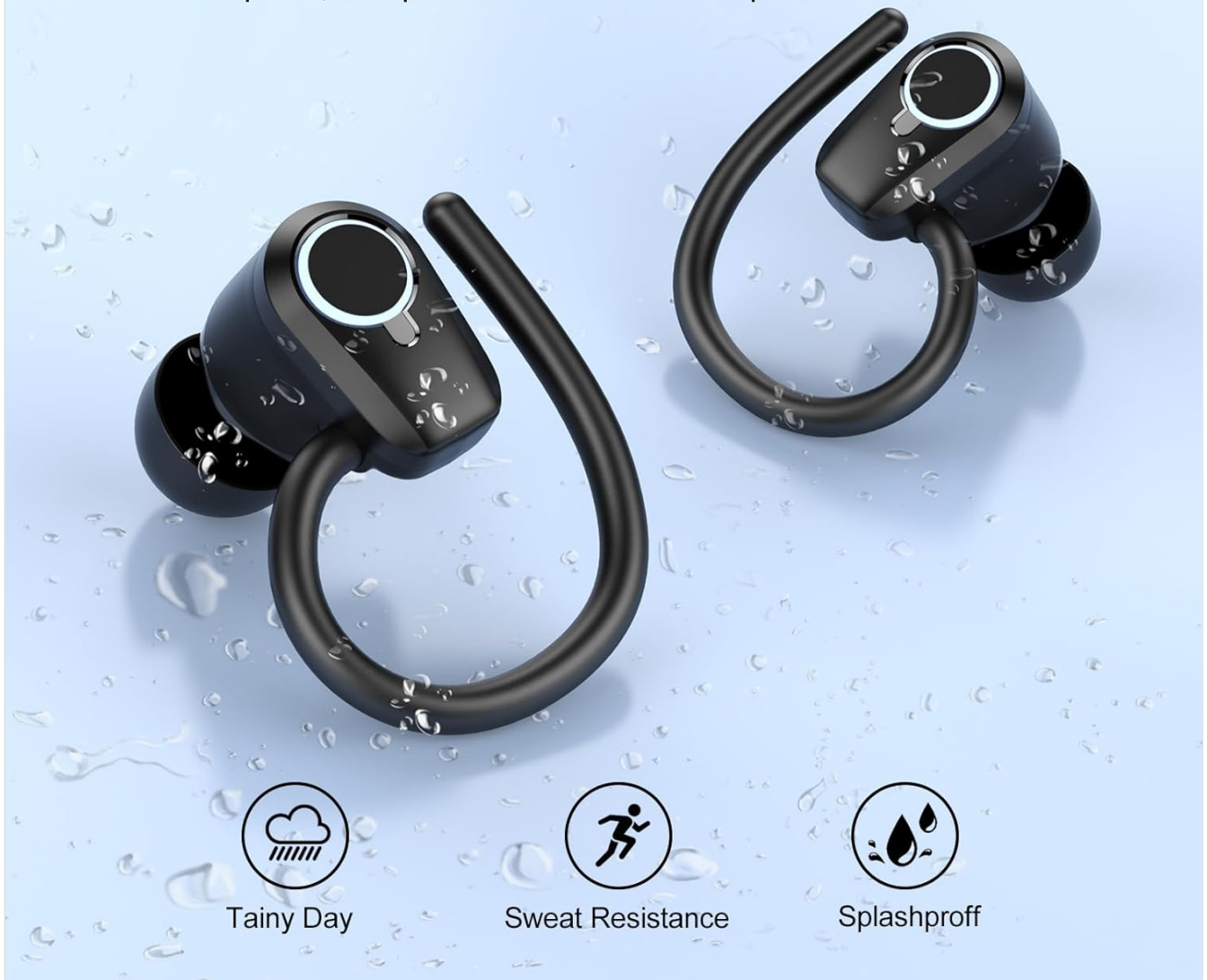
Image: The xinwld H9 earbuds shown with water droplets, illustrating their IP7 waterproof capability against rain and sweat.

With the nano coating, the sports running headphones supports IPX7 Waterproof, can prevent from sweat or splash