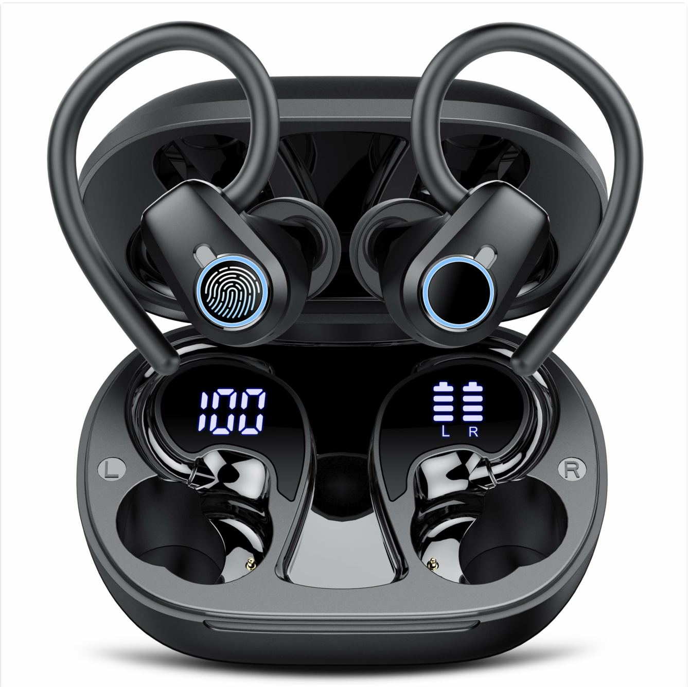
Image: xinwid H9 Wireless Earbuds and their charging case, showcasing the sleek black design.