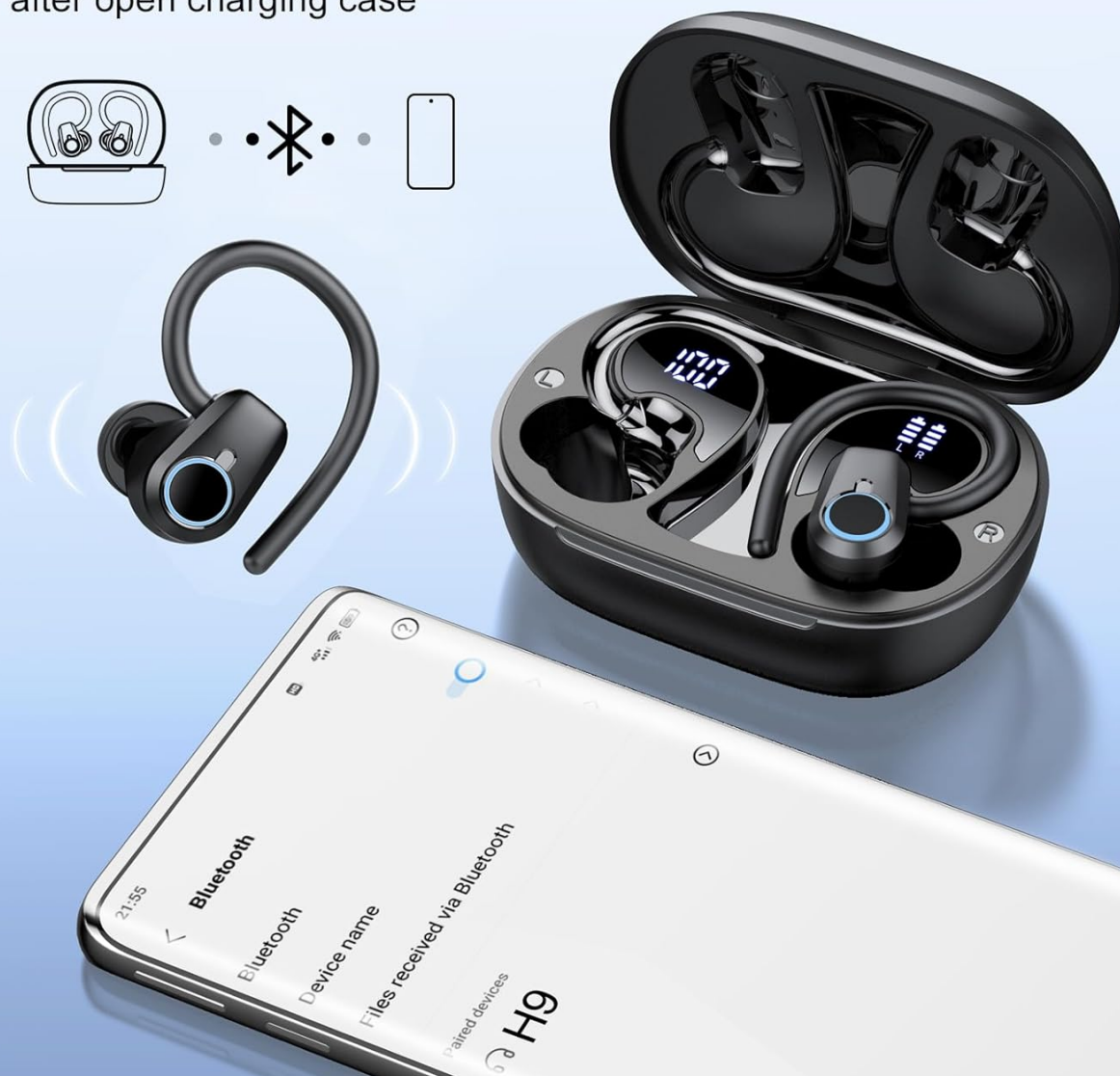
Image: A visual representation of the one-step pairing process, showing the open charging case with earbuds and a smartphone displaying Bluetooth connection options.