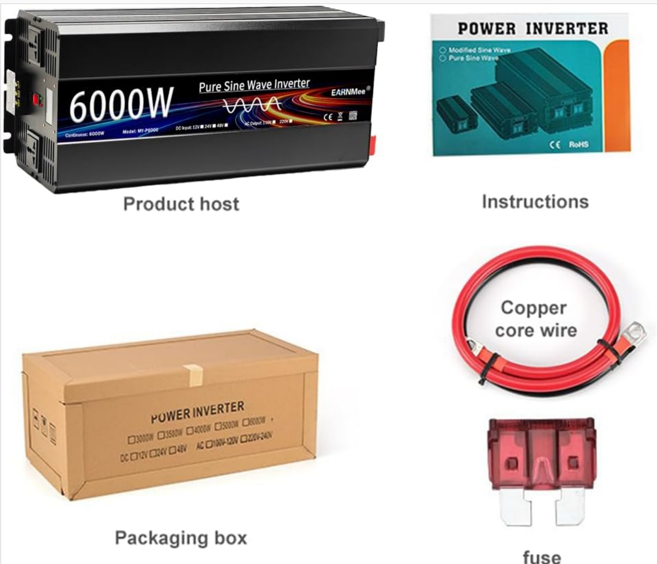
Figure 3.1: Contents of the EARNMee 6000W Pure Sine Wave Power Inverter package.