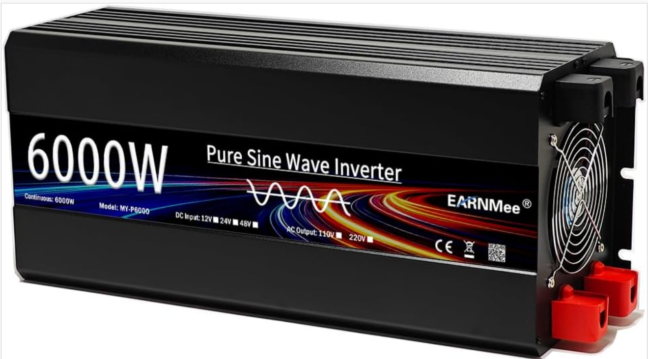
Figure 4.1: Front view of the EARNMee 6000W Pure Sine Wave Power Inverter.