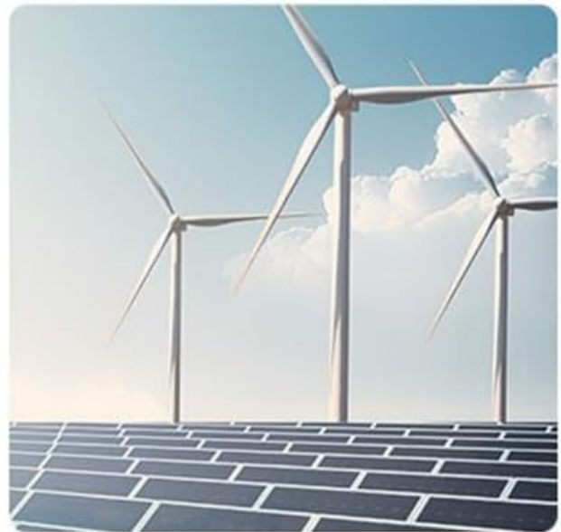
Figure 1.1: The EARNMee 6000W Pure Sine Wave Power Inverter can be used in various settings such as RVs, during power outages, for outdoor activities, and with solar power systems.