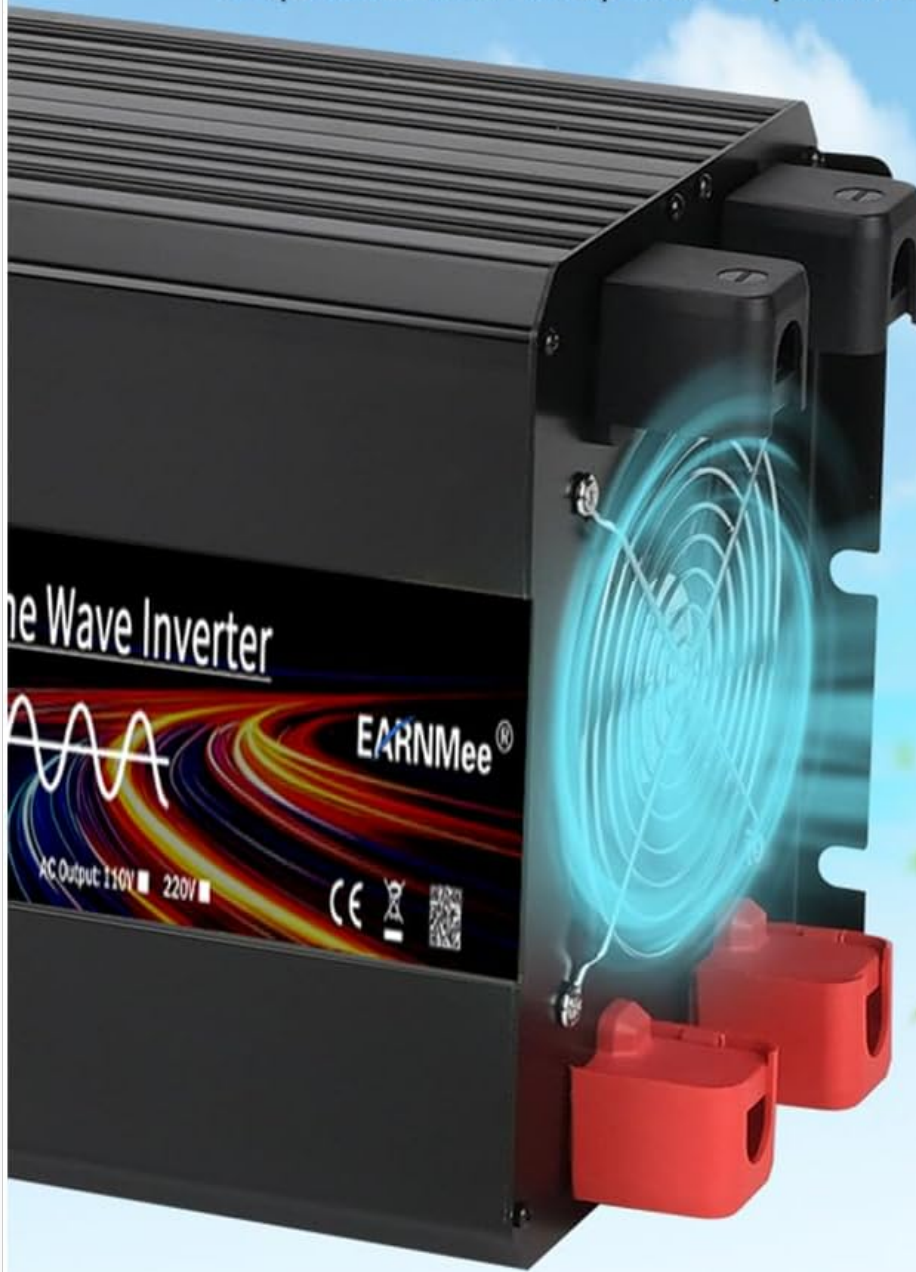
Figure 4.3: The inverter features a smart cooling system with an auto-adjusting fan and magnesium aluminum alloy shell for efficient heat dissipation.

Cooperate with magnesium aluminum alloy shell material. Sequential heat dissipation to protect the body.