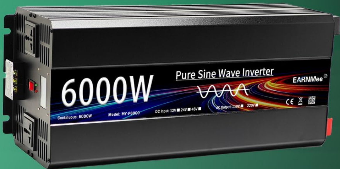
Figure 4.2: The inverter offers low loss and high conversion efficiency.

Reduce conversion losses and sustain output.