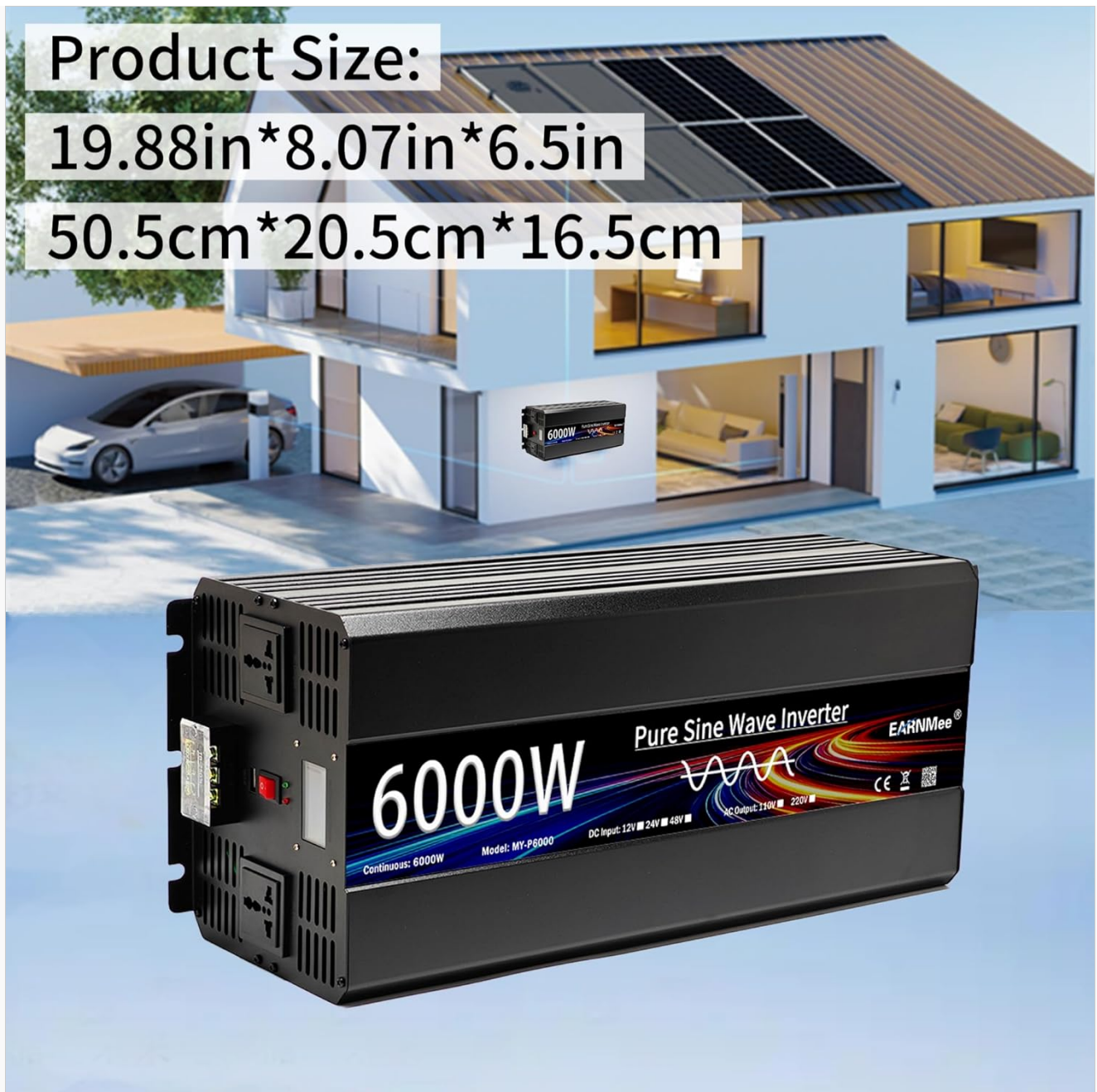
Figure 9.1: Product dimensions of the EARNMee 6000W Pure Sine Wave Power Inverter.