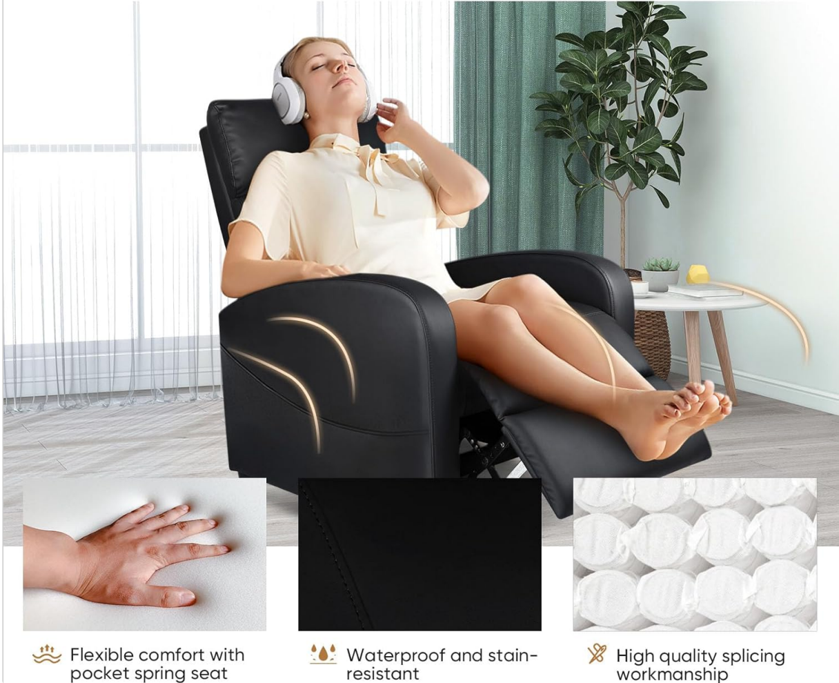
Image: Details on the chair's construction, including high-quality PU leather, flexible pocket spring cushion for comfort, and its waterproof and stain-resistant characteristics.