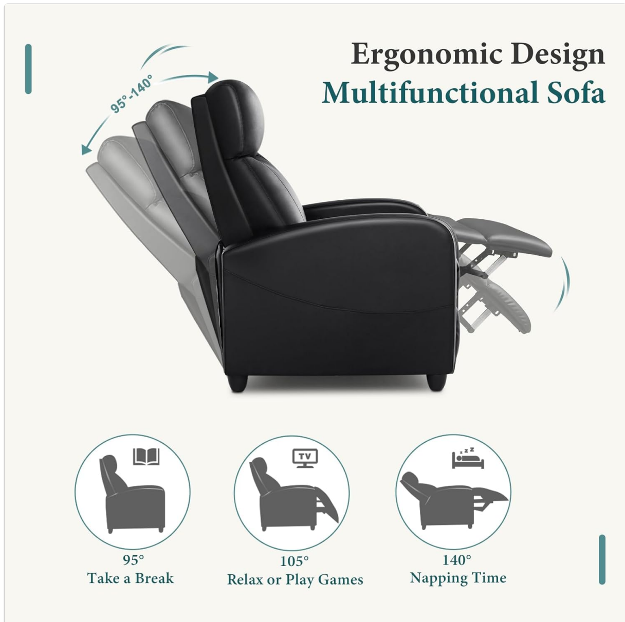
Image: Illustration of the chair's ergonomic design, demonstrating various recline angles suitable for different activities such as reading, relaxing, and napping.

To recline the chair, simply lean back and apply pressure to the backrest. The chair will smoothly adjust to your desired angle between 90° (upright) and 160° (fully reclined). To return to an upright position, lean forward and push the footrest down with your legs until it locks into place.