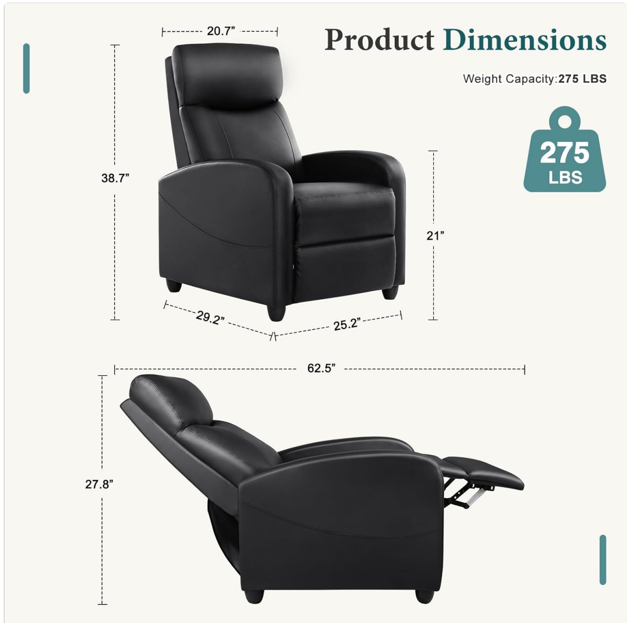
Image: Detailed dimensions of the recliner chair in both upright and fully reclined positions, indicating a maximum weight capacity of 275 lbs.