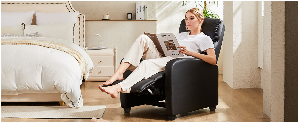
Image: The recliner chair with its massage remote, detailing the various massage settings and the chair's comfort features.