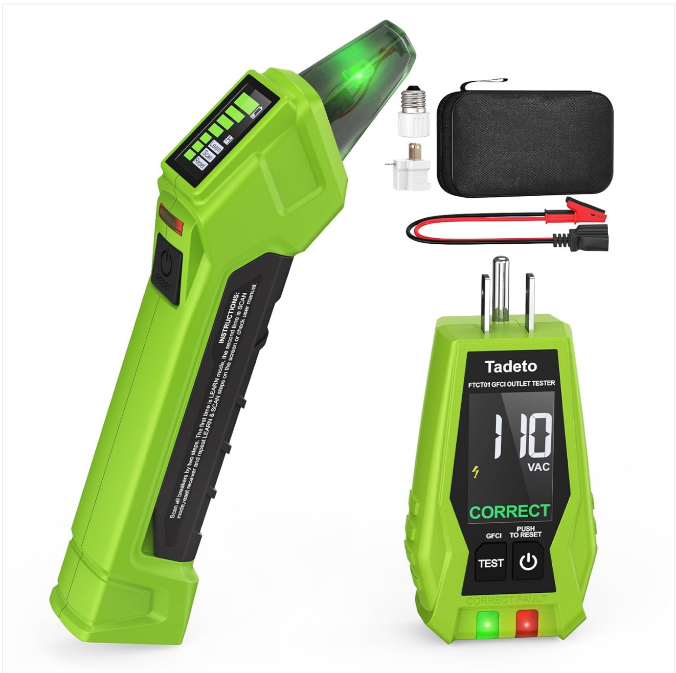
Image 1.1: Tadeto FTCT01 Circuit Breaker Finder Tool and Outlet Tester Kit. The image displays the green-colored receiver and transmitter units, along with various adapters and a carrying case.