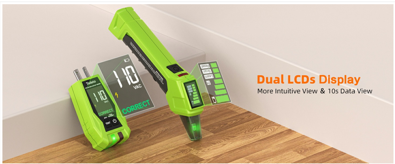
Dual LCDs Display More Intuitive View & 10s Data View