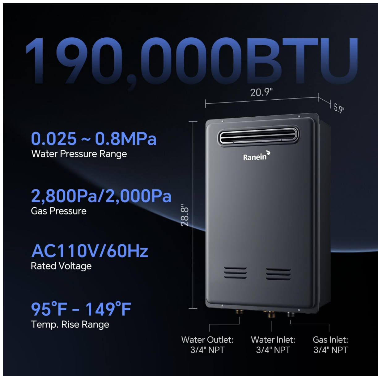
Image 4.2: Detailed view of water and gas connections, along with product dimensions.