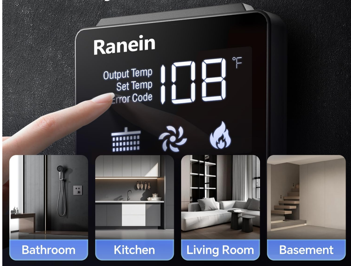
Image 5.2: The LED temperature control panel for the water heater.