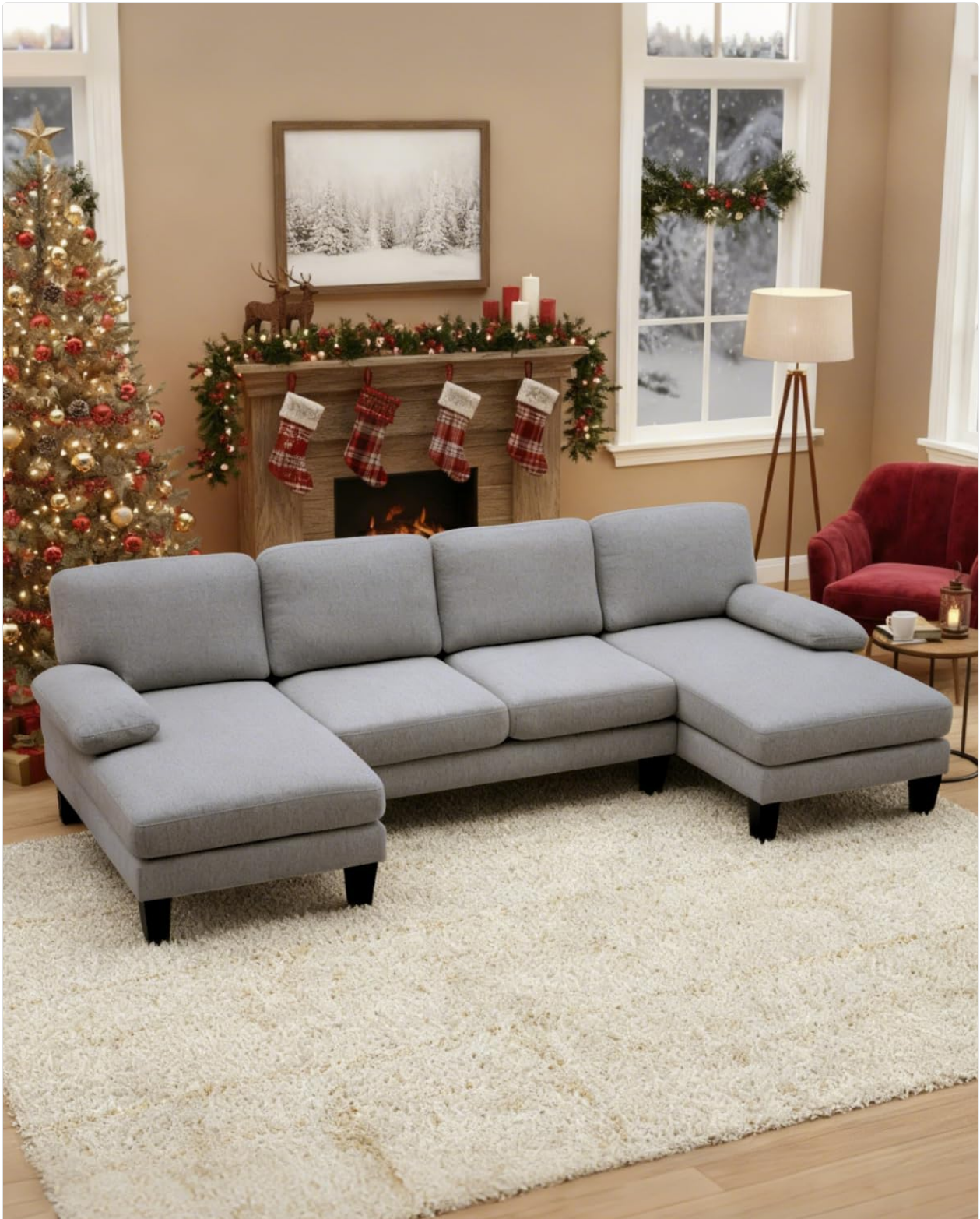
This image displays the fully assembled Karl home 110-inch U-Shape Sectional Sofa in Dusty Gray, showcasing its spacious design and chenille upholstery within a decorated living room setting.