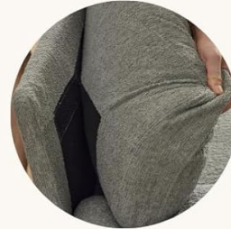
Back with Velcro