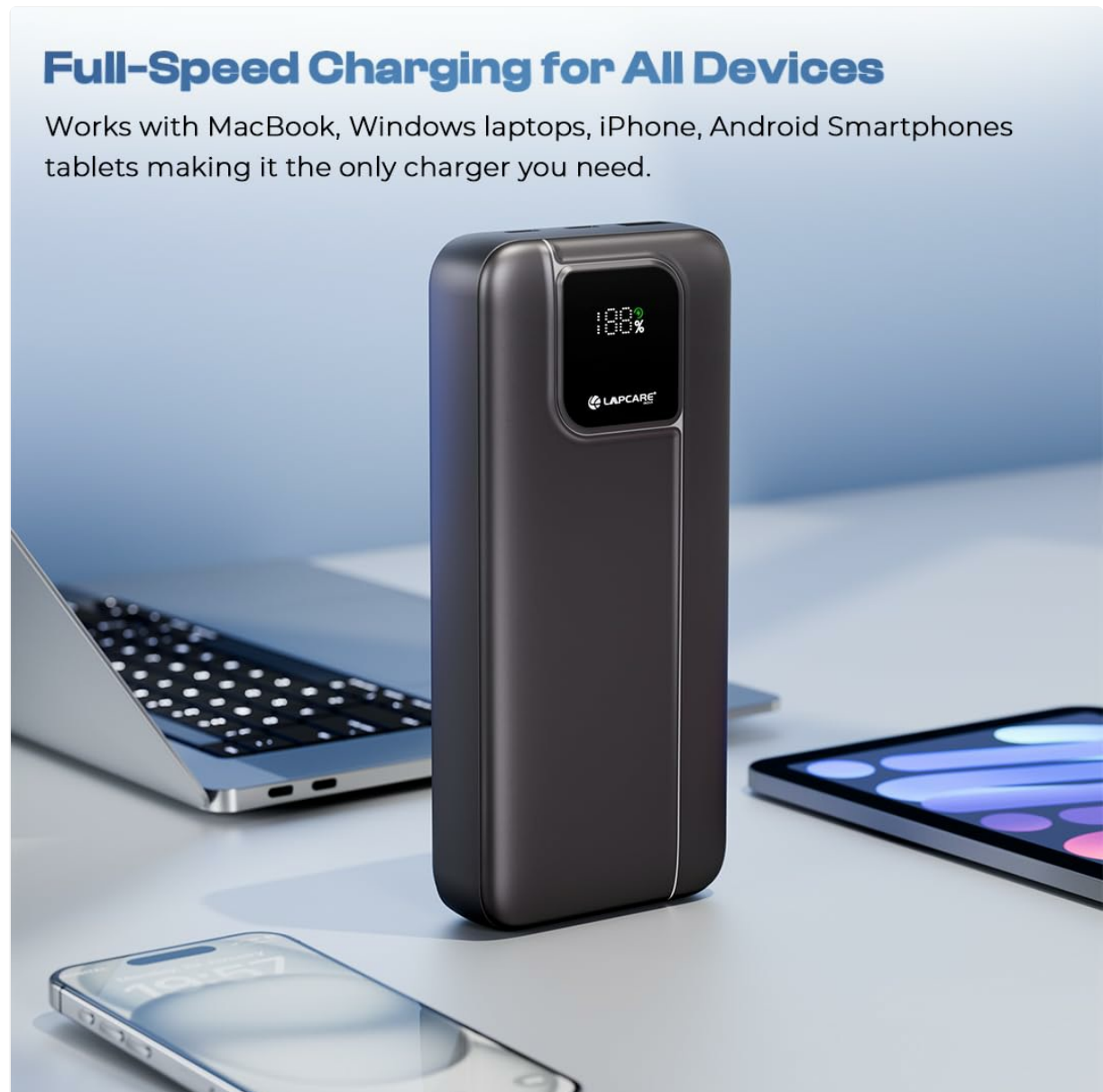
Image: The Lapcare Bravo Power Bank connected via USB-C to a laptop and via USB-A to a smartphone, demonstrating its multi-device charging capability.

The Lapcare Bravo Power Bank can charge various devices, including laptops, tablets, and smartphones, using its Type-C PD and USB-A Quick Charge ports.