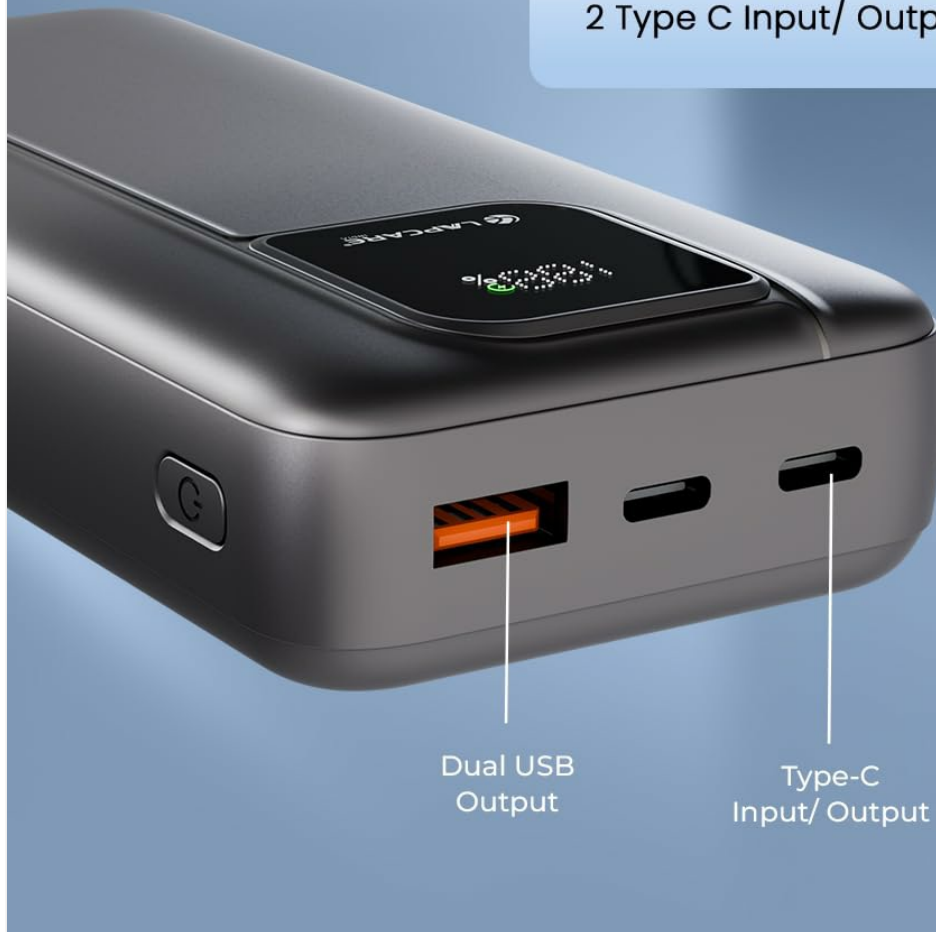
Image: The Lapcare Bravo Power Bank showing its dual Type-C input/output ports and a USB-A output port. The LED display is visible on the top surface.