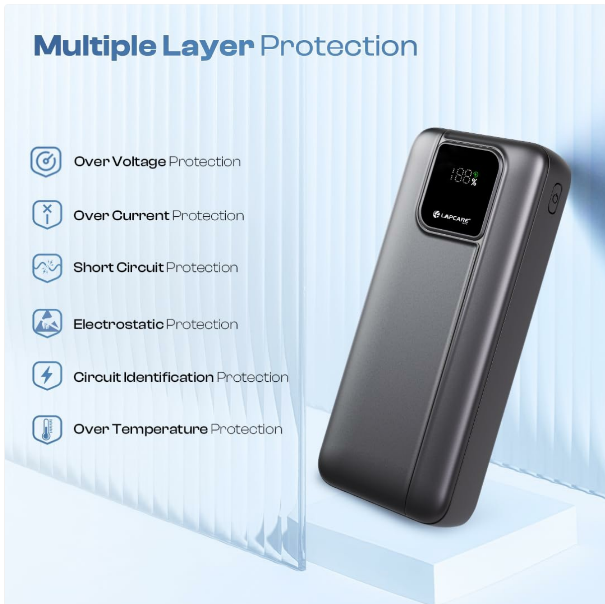
Image: The Lapcare Bravo Power Bank highlighting its multiple layer protection features, including Over Voltage, Over Current, Short Circuit, Electrostatic, Circuit Identification, and Over Temperature Protection.

To ensure safe operation and prevent damage to the power bank or connected devices, please observe the following safety guidelines: