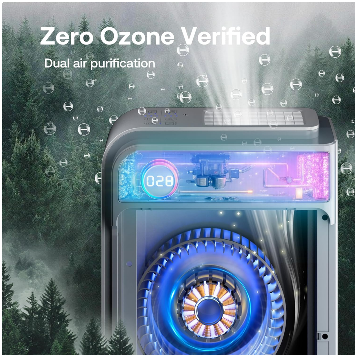
Image: The air quality display on the Trucozie air purifier, showing a numerical PM2.5 index and corresponding color indicators for air quality levels (Very Good, Good, Moderate, Bad).