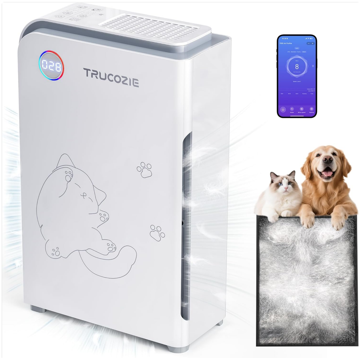
Image: The Trucozie Large Pet Air Purifier T555, a white unit with a digital display and subtle pet paw print designs, shown alongside a golden retriever and a cat, with a smartphone displaying the air purifier's control application.