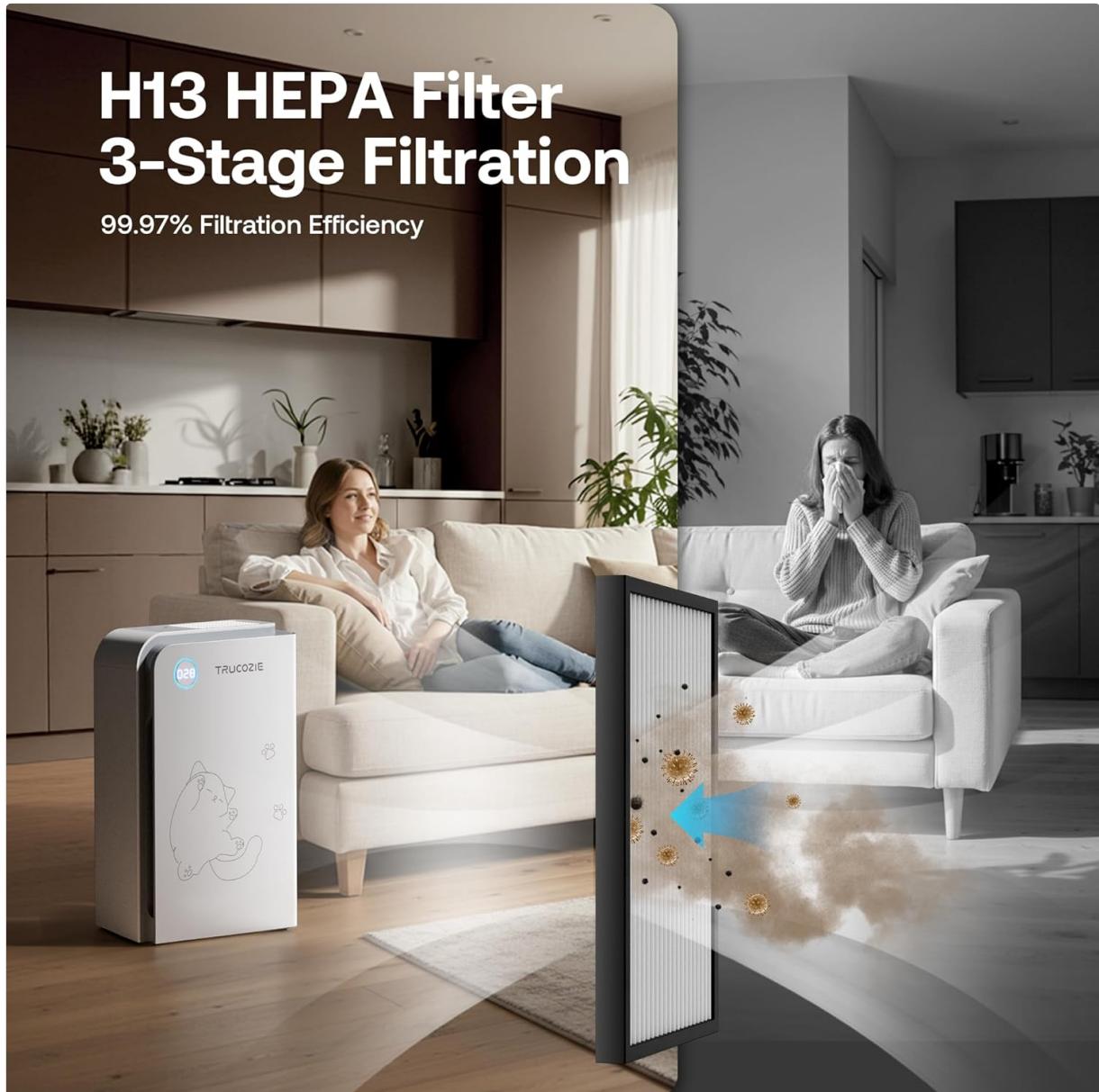
Image: The Trucozie air purifier in a living room setting, with an overlay illustrating the H13 HEPA filter's effectiveness in capturing fine particles.