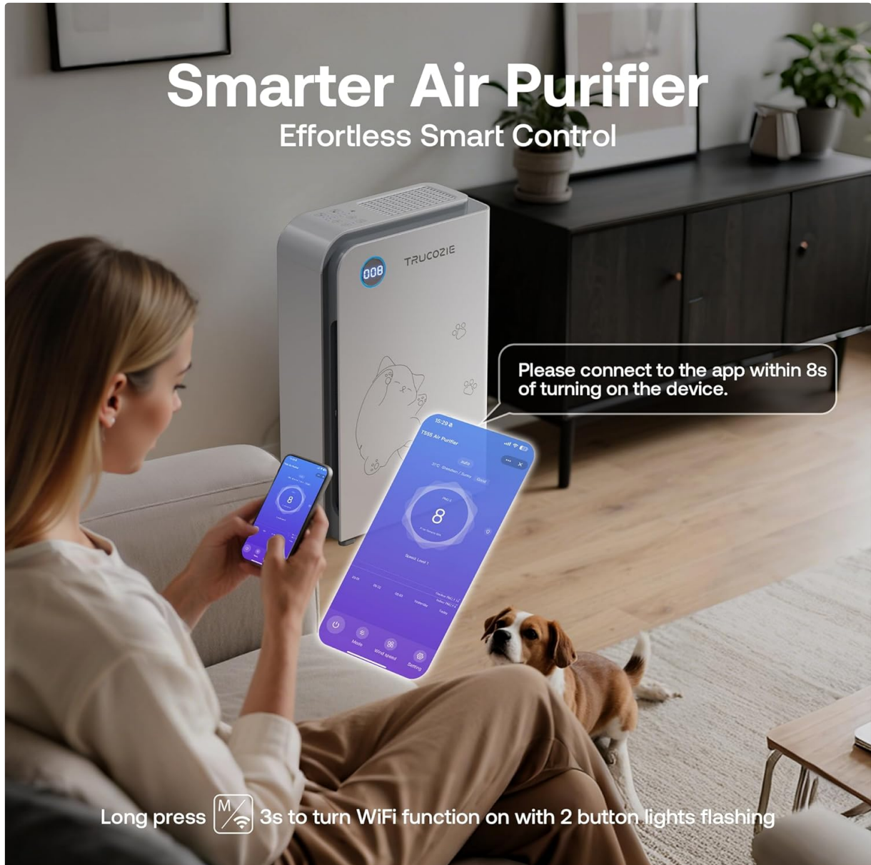
Image: A user interacting with the Trucozie air purifier via a smartphone app, demonstrating the smart control features.

Note: Please connect to the app within 8 seconds of turning on the device for successful pairing.