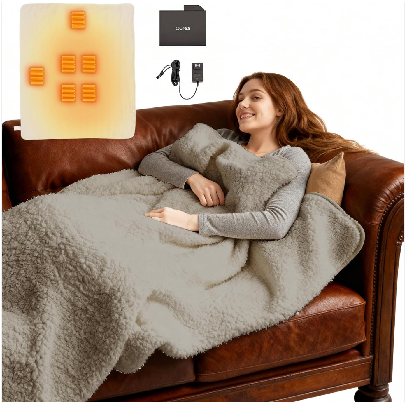
Image: The ZonLi Ourea Portable Cordless Heating Blanket in use, highlighting its comfort and portability.