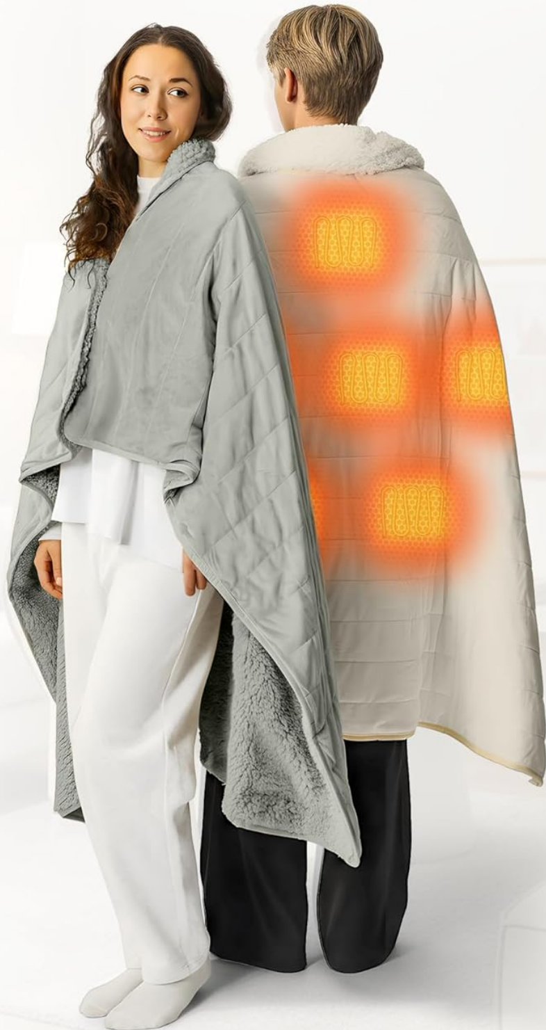
Image: Visual guide to the blanket's heating zones and temperature control options.