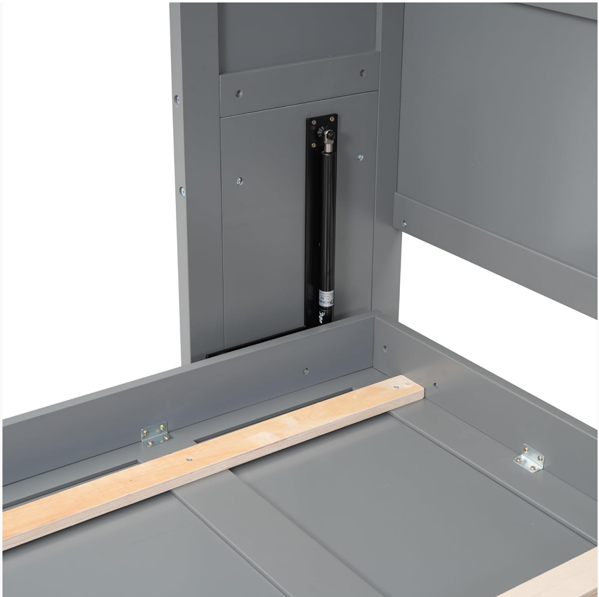
Figure 3: Detail of the gas lift mechanism for smooth operation.