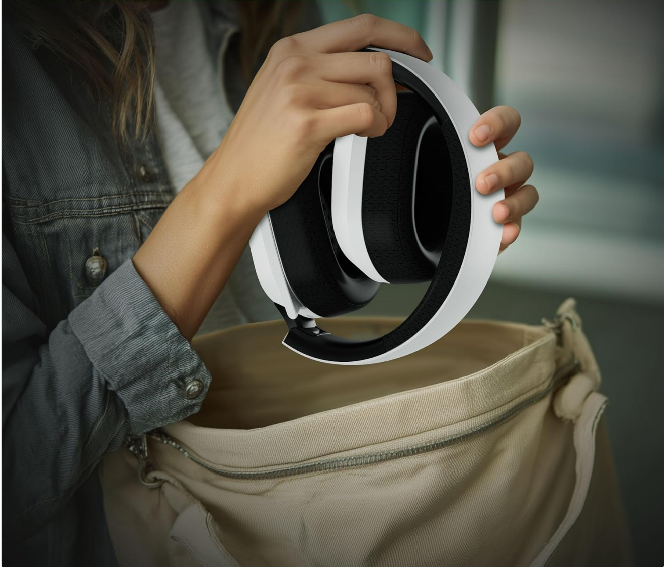
Image: A person demonstrating the foldable design of the headset, placing it into a bag for compact storage.