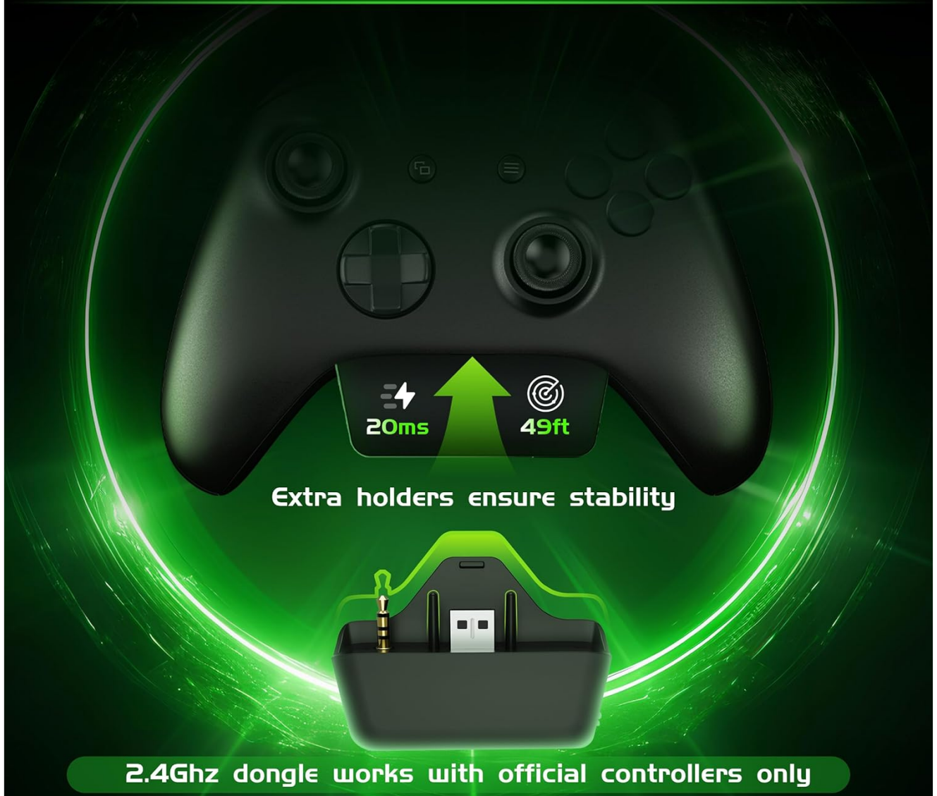
Image: The 2.4GHz wireless transmitter securely inserted into the bottom of an Xbox controller.