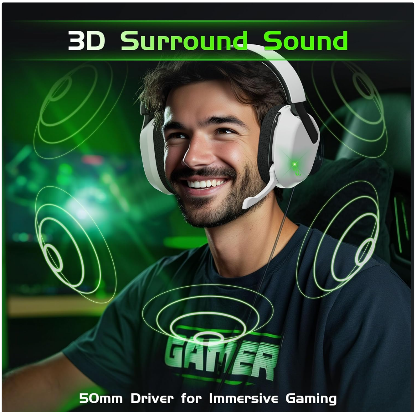
Image: A person wearing the headset, surrounded by visual representations of 3D sound waves, emphasizing immersive audio.