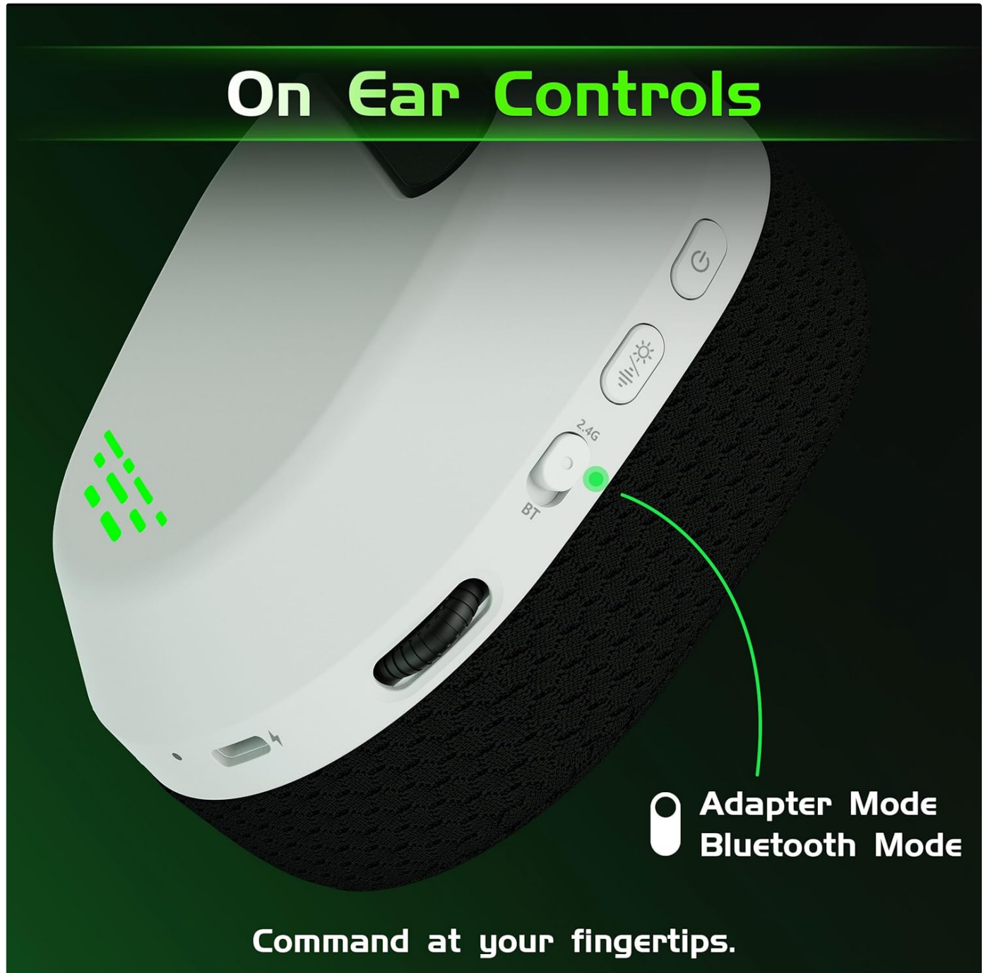
Image: Close-up of the headset's left earcup, showing the power button, light button, 2.4G/BT mode switch, and volume scroll wheel.

Adjust the volume using the scroll wheel located on the left earcup.