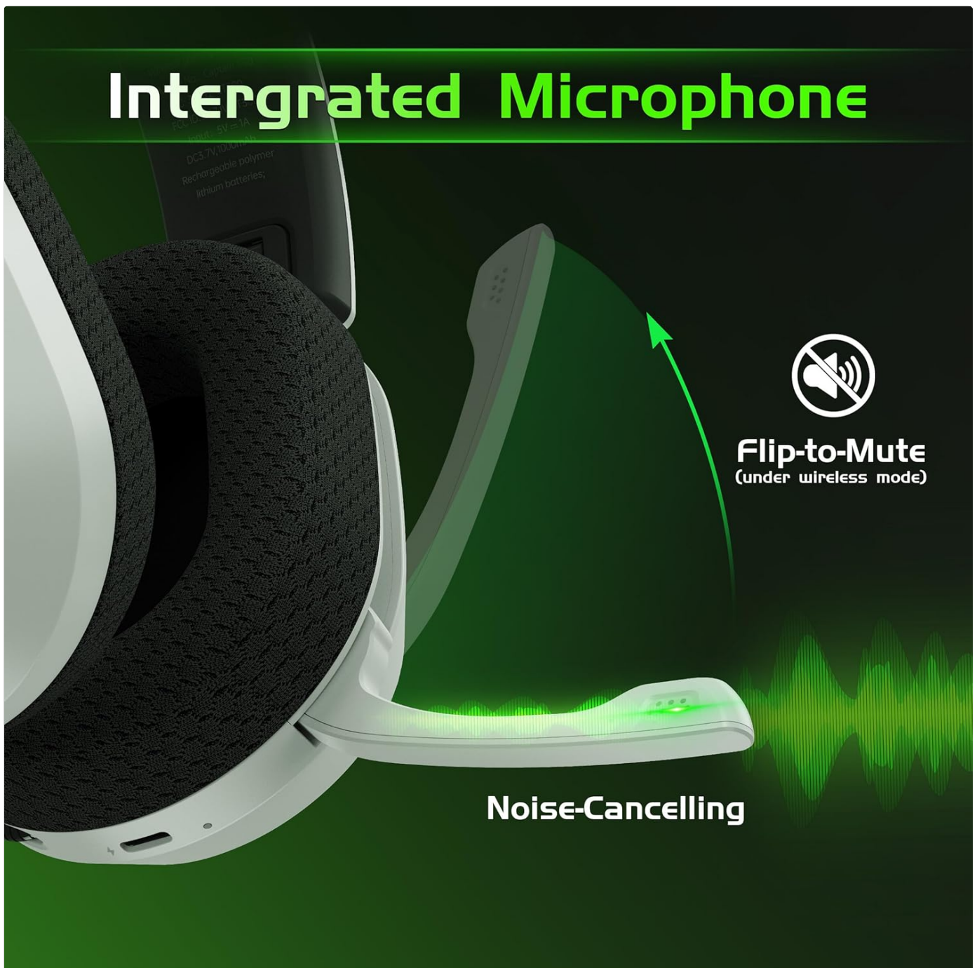
Image: The integrated microphone of the headset, demonstrating its flip-to-mute functionality and noise-canceling feature.