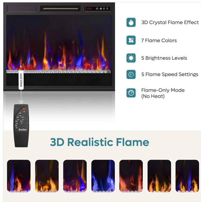
Figure 5: Flame color, brightness, and speed options.