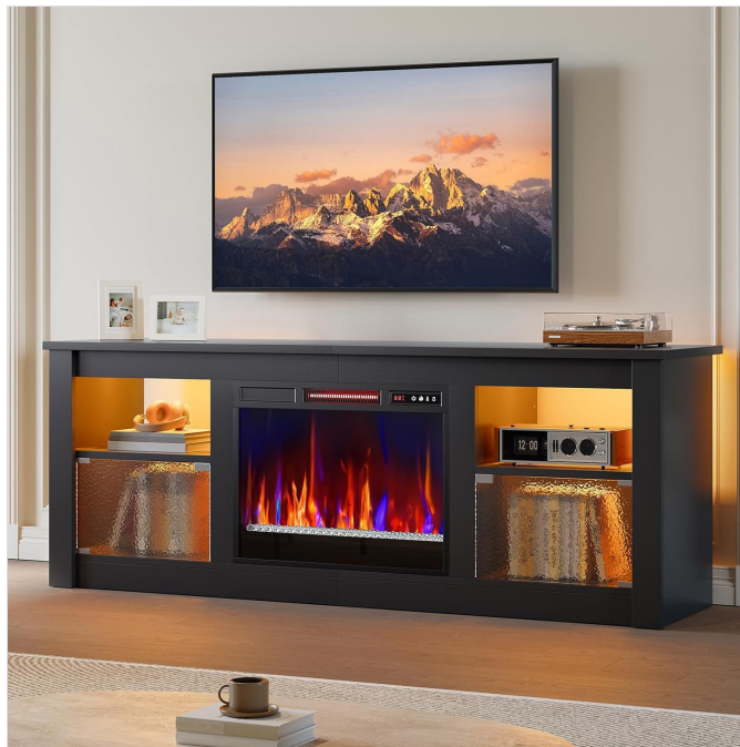
Figure 1: The Bestier 63-inch Fireplace TV Stand.