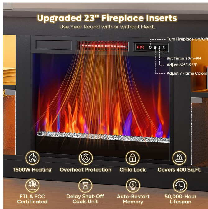
Figure 4: Fireplace control panel and features.