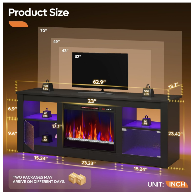
Figure 8: Product dimensions and TV size compatibility.