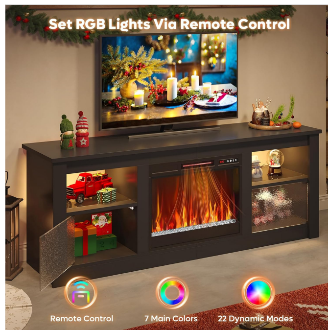
Figure 6: RGB LED lighting features and remote control.