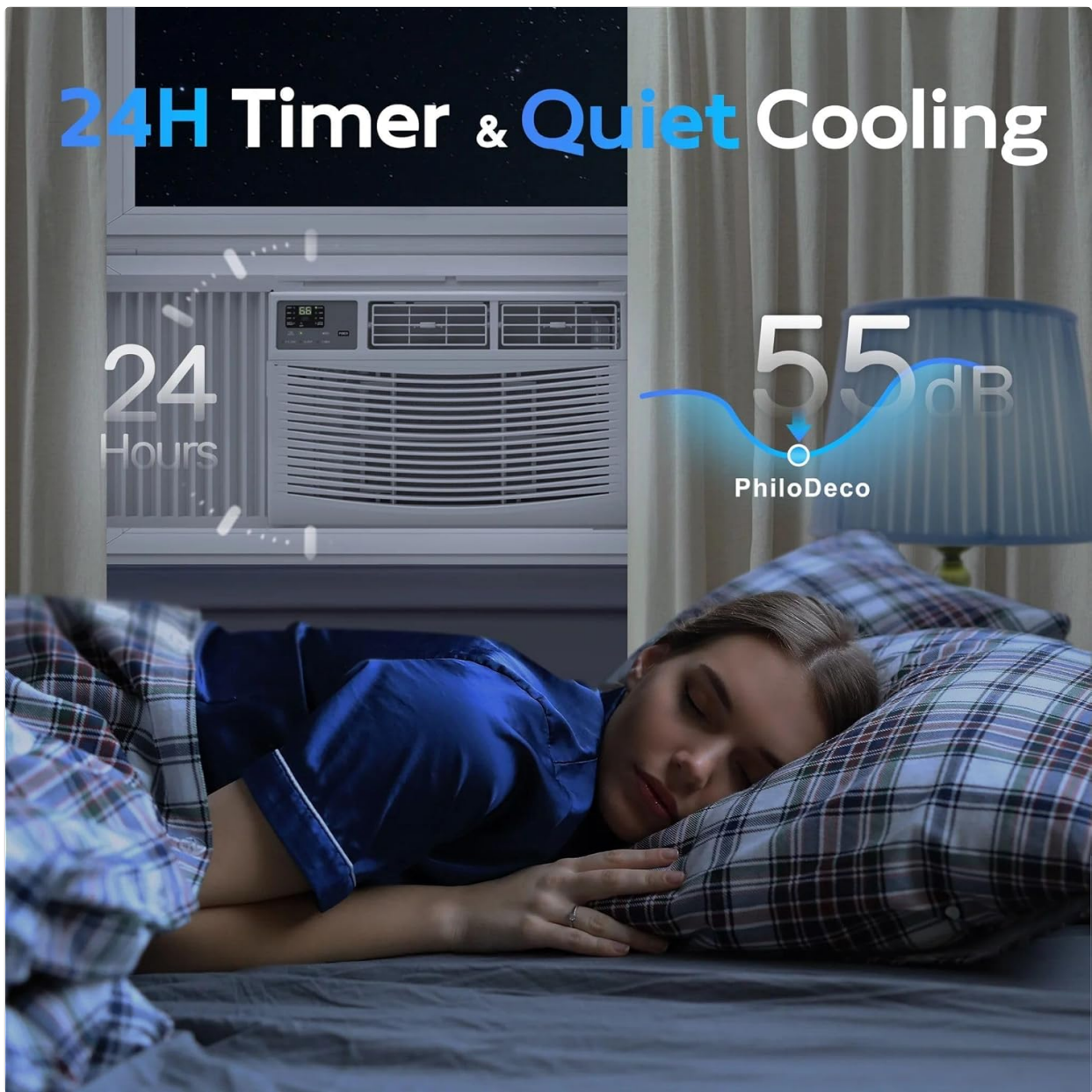
Figure 4.3: The 24-hour timer feature and quiet operation of the air conditioner. The unit operates at a low noise level of 55dB, making it suitable for use during sleep.