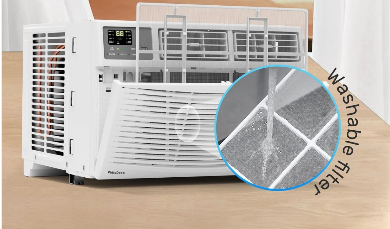
Figure 5.1: Steps for cleaning the washable filter. The image shows the filter being removed from the front of the unit and then being rinsed under running water to remove accumulated dust and debris.

Washable filter, daily cleaning only requires removing the filter and rinsing