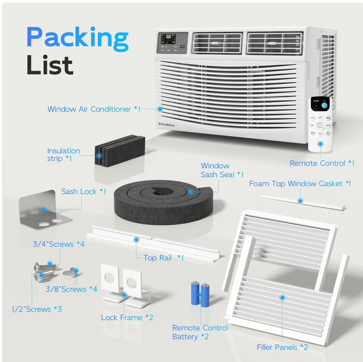
Figure 2.1: Contents of the PhiloDeco 12000 BTU Window Air Conditioner package. This image displays the main air conditioner unit, remote control, insulation strip, window sash seal, foam top window gasket, sash lock, various screws (3/4", 3/8", 1/2"), top rail, lock frames, remote control batteries, and filler panels.