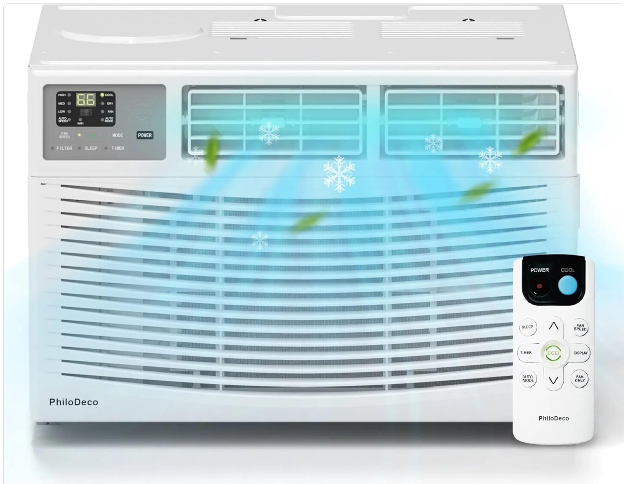
Figure 4.1: Front view of the PhiloDeco 12000 BTU Window Air Conditioner and its remote control. The unit features an LED display and buttons for Fan Speed, Filter, Sleep, Timer, Mode, and Power. The remote control includes buttons for Power, Cool, Sleep, Fan Speed, Timer, ECO, Display, Auto, Up/Down temperature, and Fan Only.

The air conditioner can be operated using the control panel on the unit or the included remote control. The remote control offers full functionality for convenience.