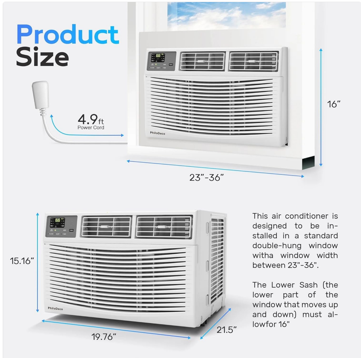
Figure 3.1: Product dimensions and window installation requirements. The unit measures approximately 19.76" (width) x 15.16" (height) x 21.5" (depth). The power cord is 4.9 ft long. The air conditioner is designed for a standard double-hung window with a width between 23" and 36". The lower sash must allow for a minimum opening of 16" in height.

This air conditioner is designed for installation in standard double-hung windows. Ensure your window meets the following dimensions: