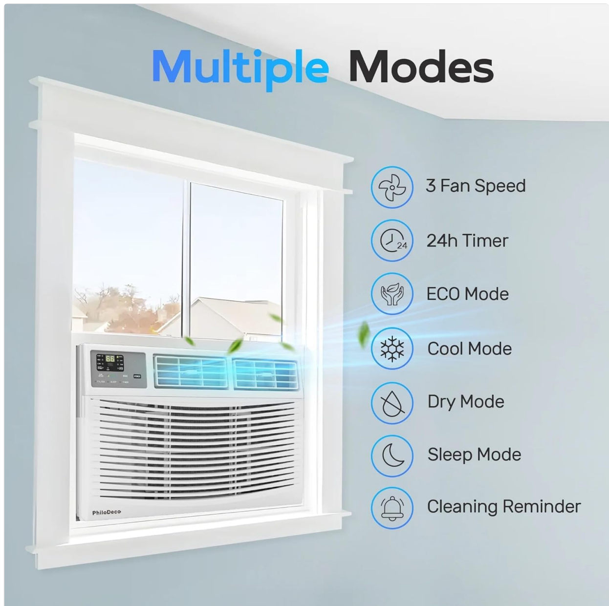
Figure 4.2: Overview of available operating modes and features. This image highlights the 3 Fan Speed settings, 24-hour Timer, ECO Mode for energy saving, Cool Mode for active cooling, Dry Mode for dehumidification, Sleep Mode for quiet night operation, and a Cleaning Reminder for filter maintenance.