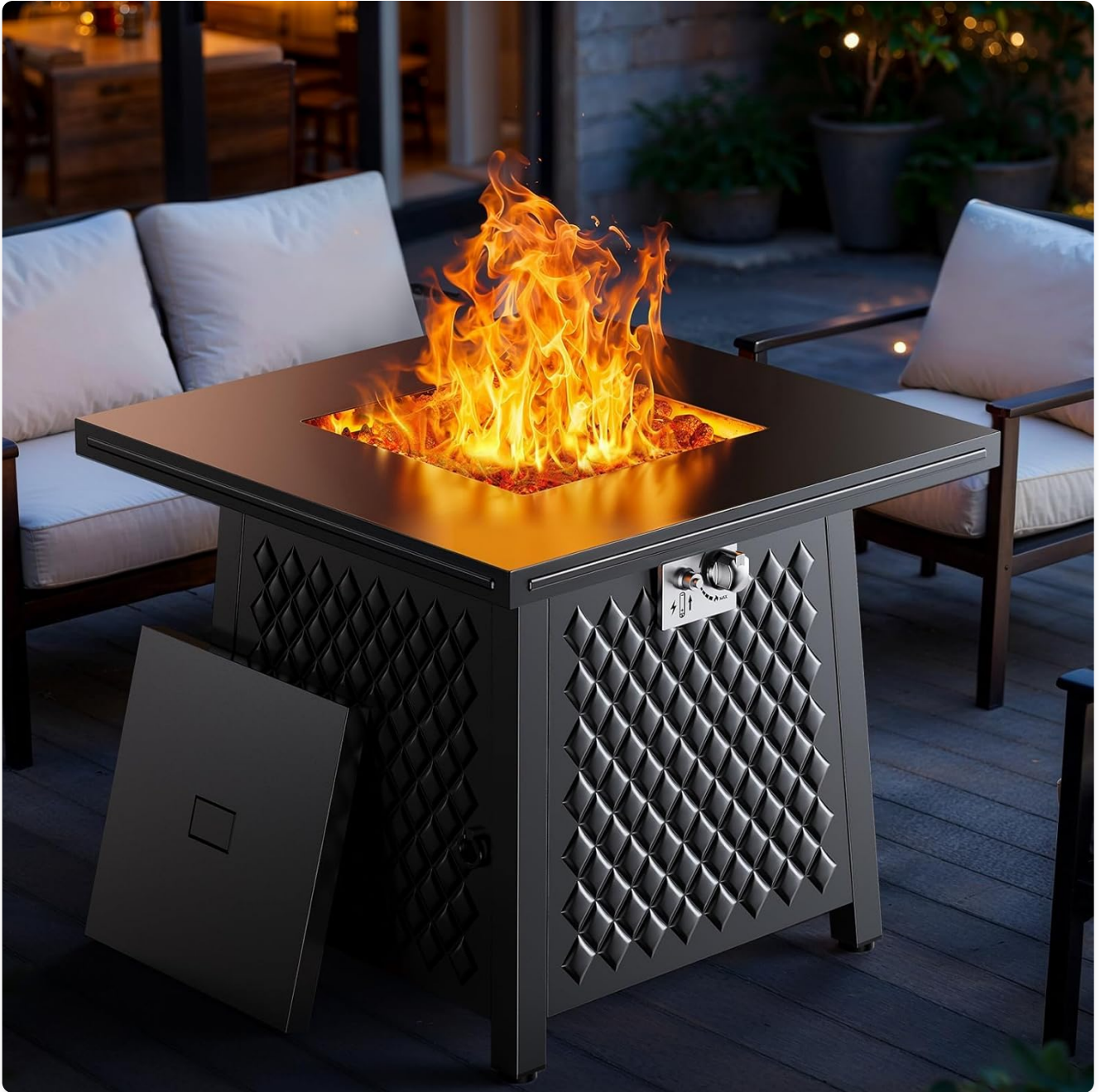
Image: The fire pit table positioned on an outdoor patio, surrounded by comfortable seating, demonstrating its use as a centerpiece for outdoor living spaces.