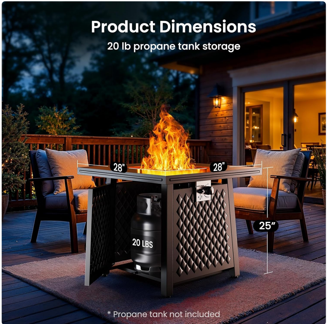
Image: The fire pit table with its side door open, revealing the internal compartment designed to store a 20 lb propane tank. Product dimensions are also indicated.