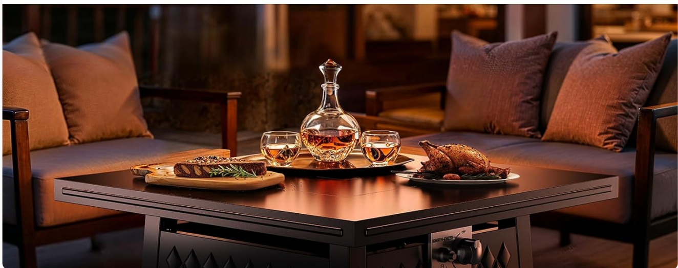
Image: A split image demonstrating the versatility of the fire pit table, showing it in use with a flame for warmth and ambiance, and then with the lid on, functioning as a solid surface coffee table.