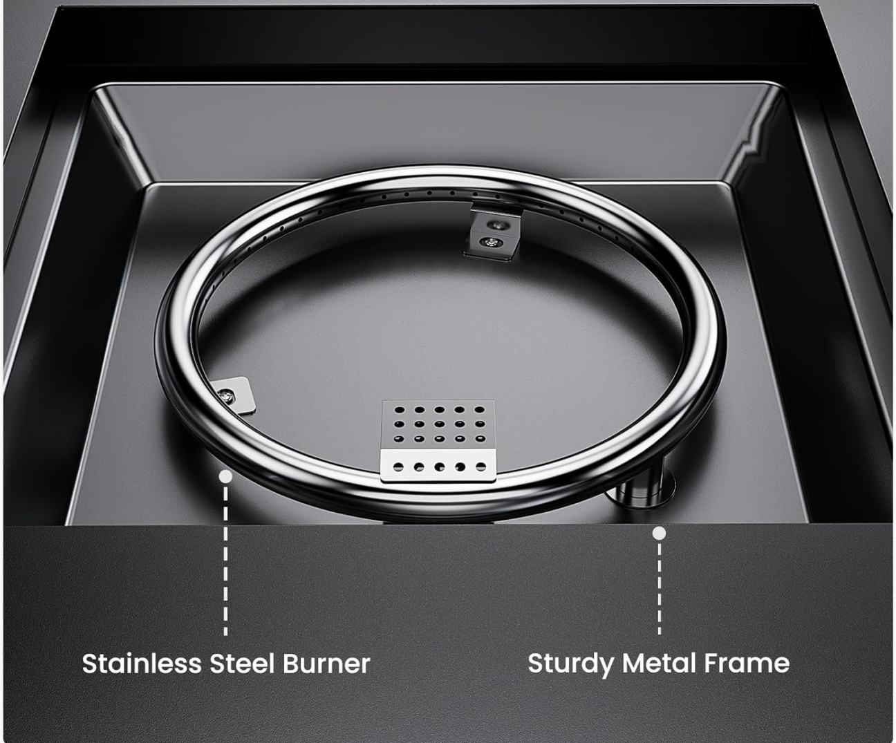
Image: A close-up view highlighting the durable stainless steel burner ring and the robust metal frame construction of the fire pit table.