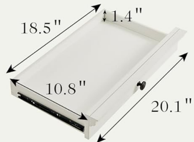
Figure 4: Detailed dimensions and weight capacities of the nightstand.