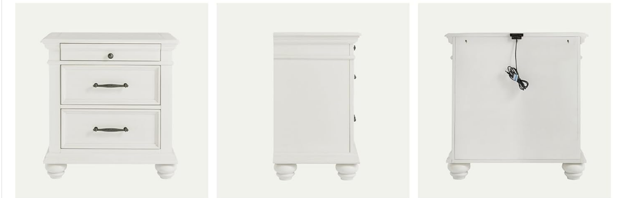
Figure 1: The nightstand body is fully assembled; only the legs need to be attached.