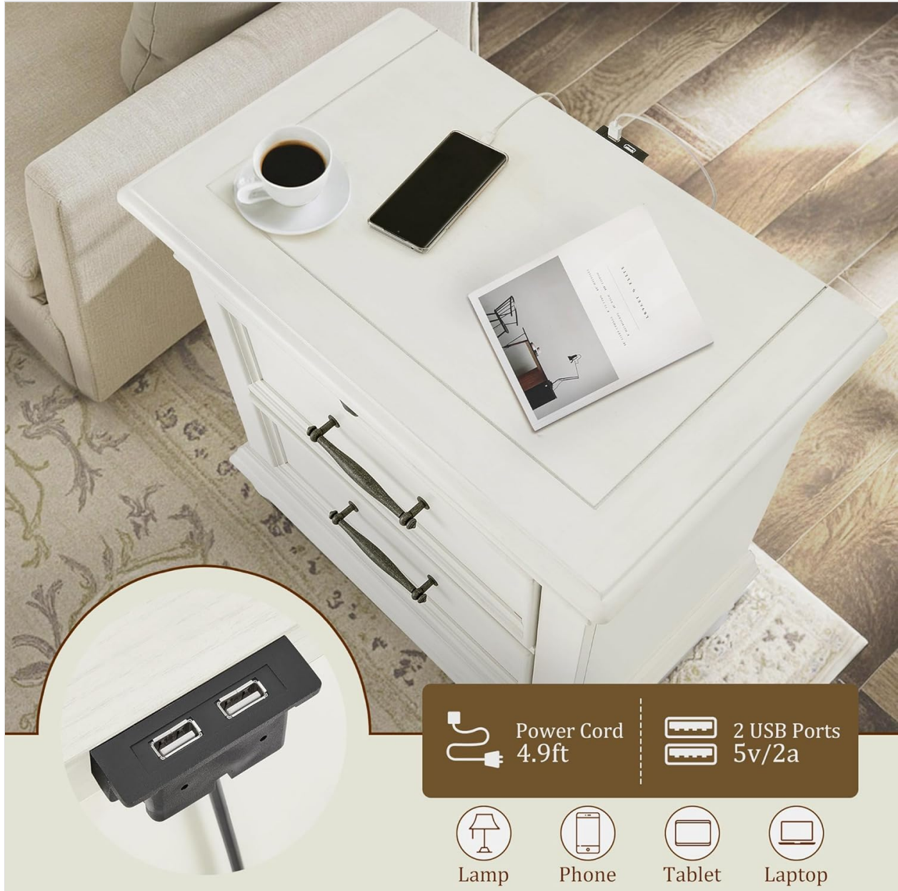
Figure 3: Spacious drawers, including a felt-lined top drawer.

The drawers are designed with smooth-gliding rails for easy opening and closing.