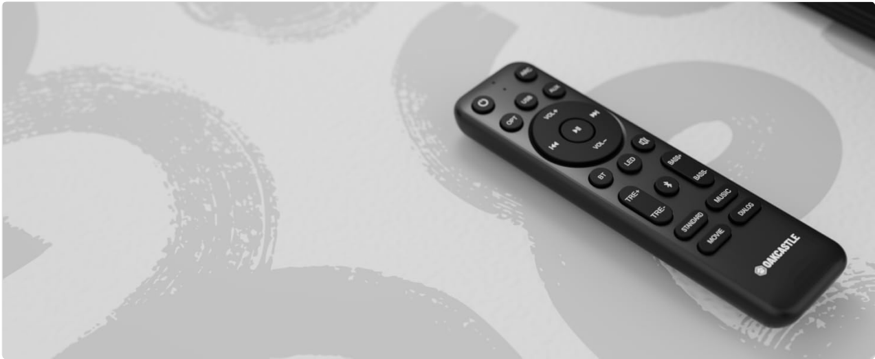
Image 8: Oakcastle SB80 Xtra remote control. This image shows the layout and buttons of the remote control for easy operation.

The included remote control allows full command over your soundbar's functions, including power, volume, input selection, and EQ modes.