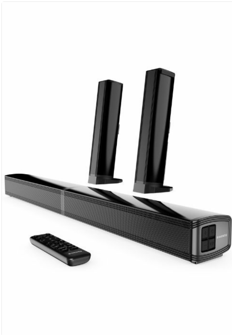
Image 6: Detail of soundbar splitting mechanism. This image illustrates how the soundbar can be separated into two individual units.