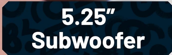
Image 3: External subwoofer with exposed driver. This image shows the 5.25-inch subwoofer designed for room-filling bass.

Your browser does not support the video tag.