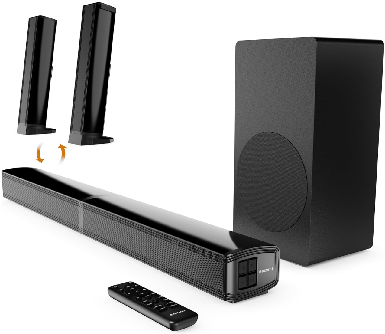
Image 1: Oakcastle SB80 Xtra Soundbar and Subwoofer. This image shows the main soundbar unit and the external subwoofer, highlighting the complete audio system.