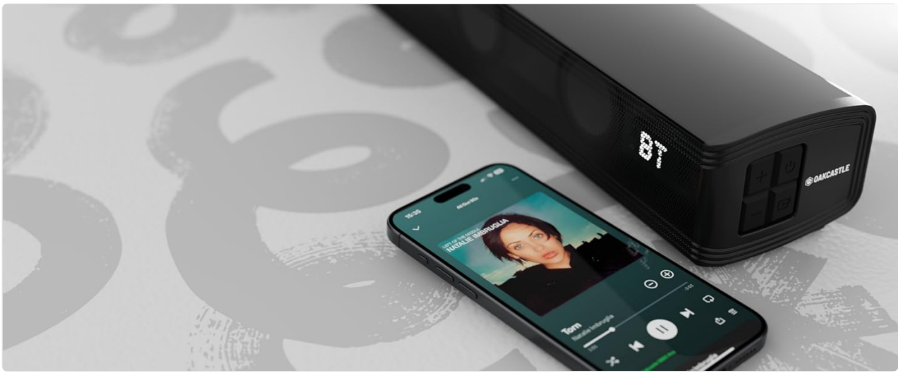
Image 9: Smartphone connected to soundbar via Bluetooth. This image shows a smartphone displaying music playback, wirelessly connected to the soundbar.