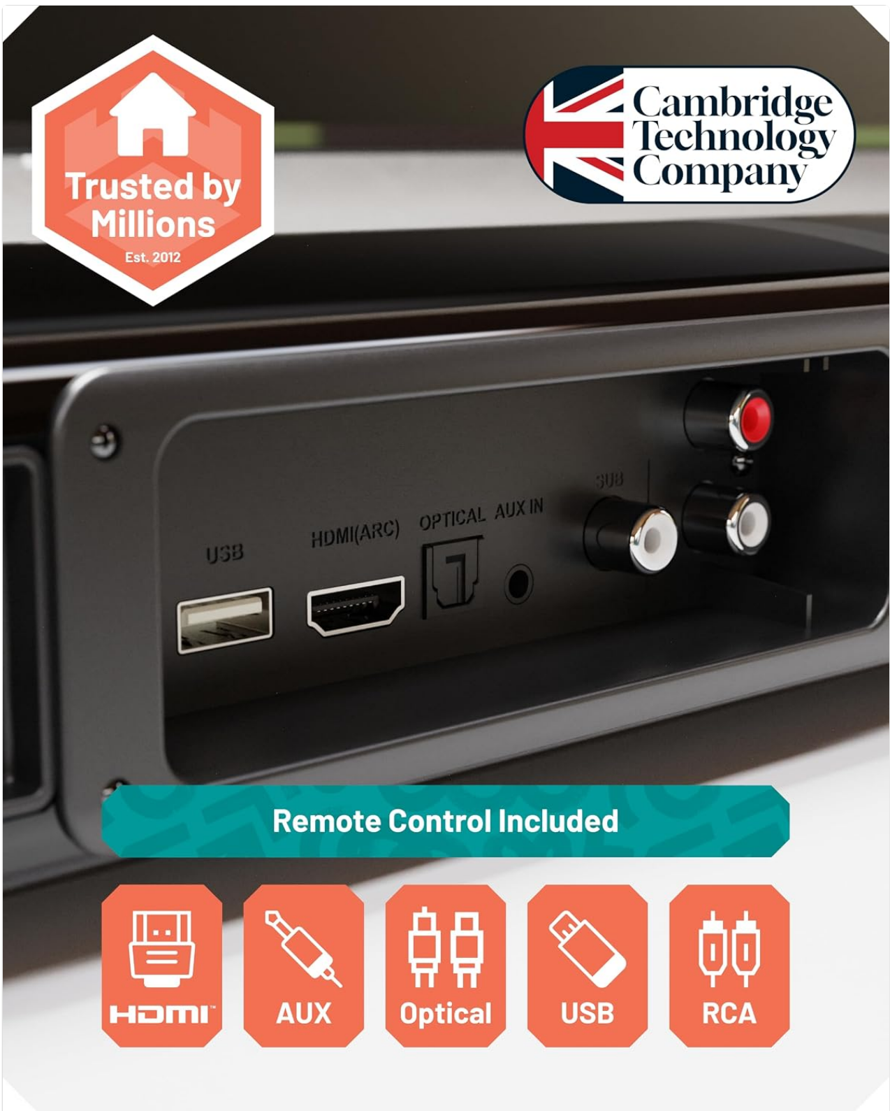
Image 7: Rear panel connections of the Oakcastle SB80 Xtra soundbar. This image displays the USB, HDMI (ARC), Optical, and AUX IN ports.

Your browser does not support the video tag.