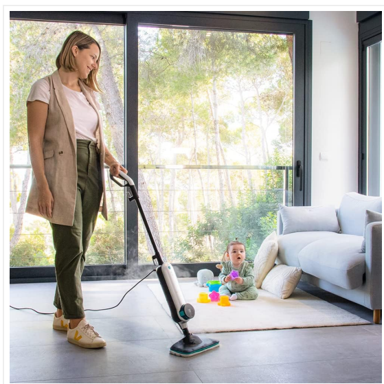
Figure 5: Steam cleaner in use in a living area.