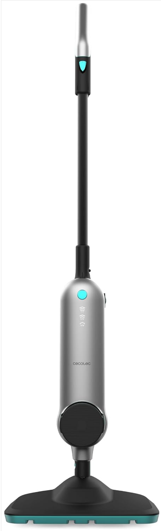
Figure 1: Front view of the Cecotec HydroSteam 3030 Blaze vertical steam cleaner, showing the main body and cleaning head.