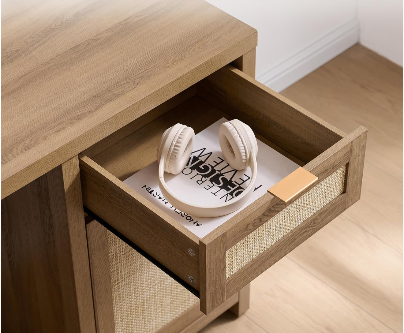
Figure 5.2: The drawer offers convenient storage for small items.