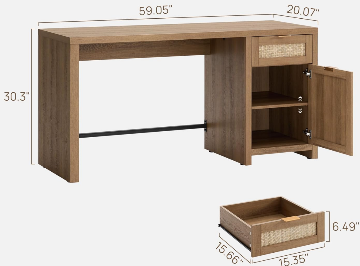
Figure 4.1: Overall Table Dimensions and Drawer Dimensions. Refer to these measurements during assembly and placement.