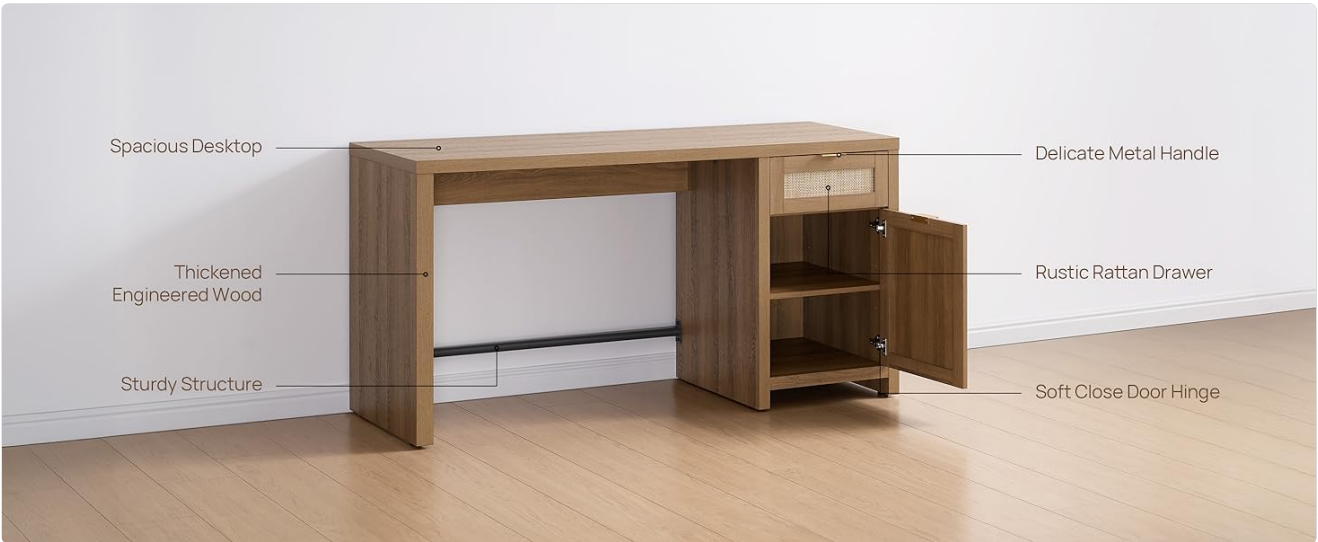
Figure 5.3: The adjustable shelf provides flexible storage options.