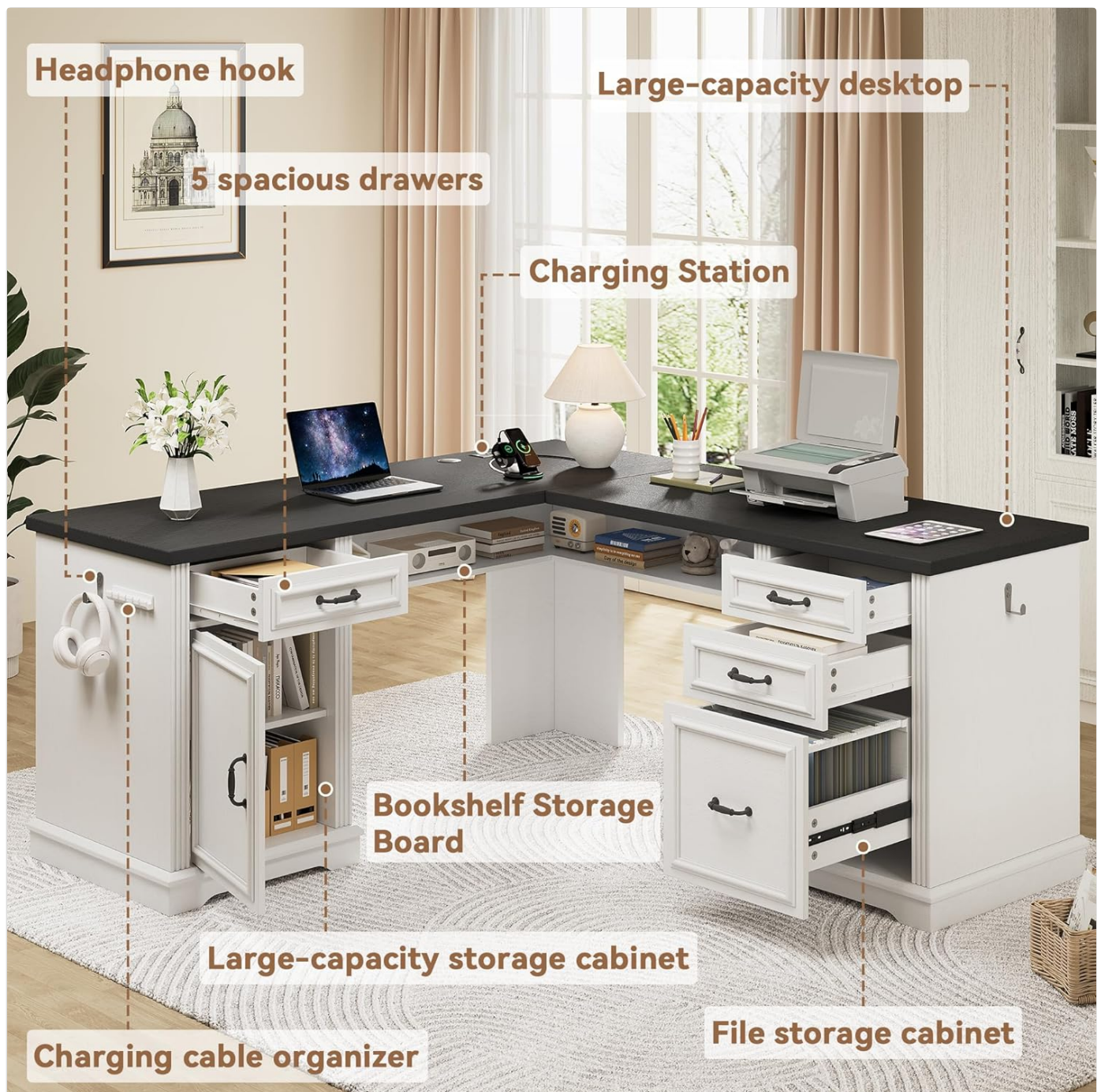
Image 6.1: An annotated diagram highlighting the desk's key features and storage components, useful during assembly.