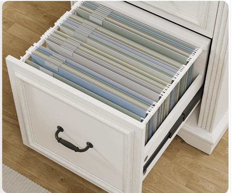
Image 7.2: Examples of the functional drawers for small items and the spacious file drawer for documents.

This large, deep drawer is specifically designed to store letter and legal-sized file folders, keeping your important paperwork neatly tucked away yet easy to access.