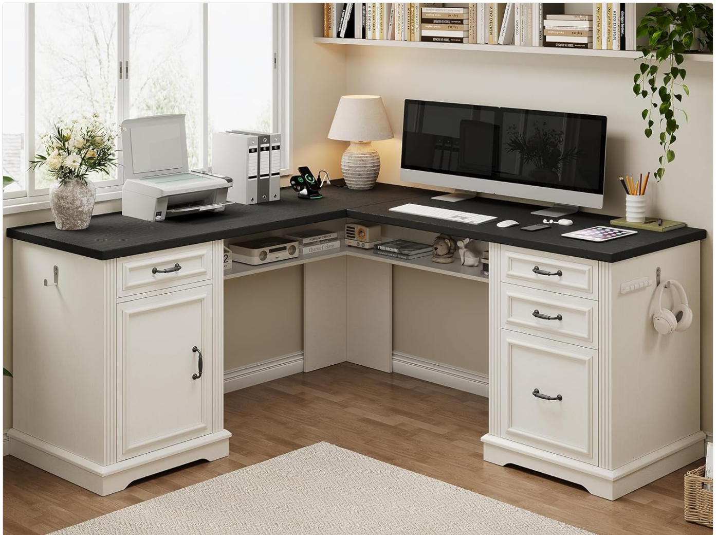
Image 2.1: The Jocoevol Farmhouse L Shaped Executive Desk, showcasing its design and functionality in a typical office environment.