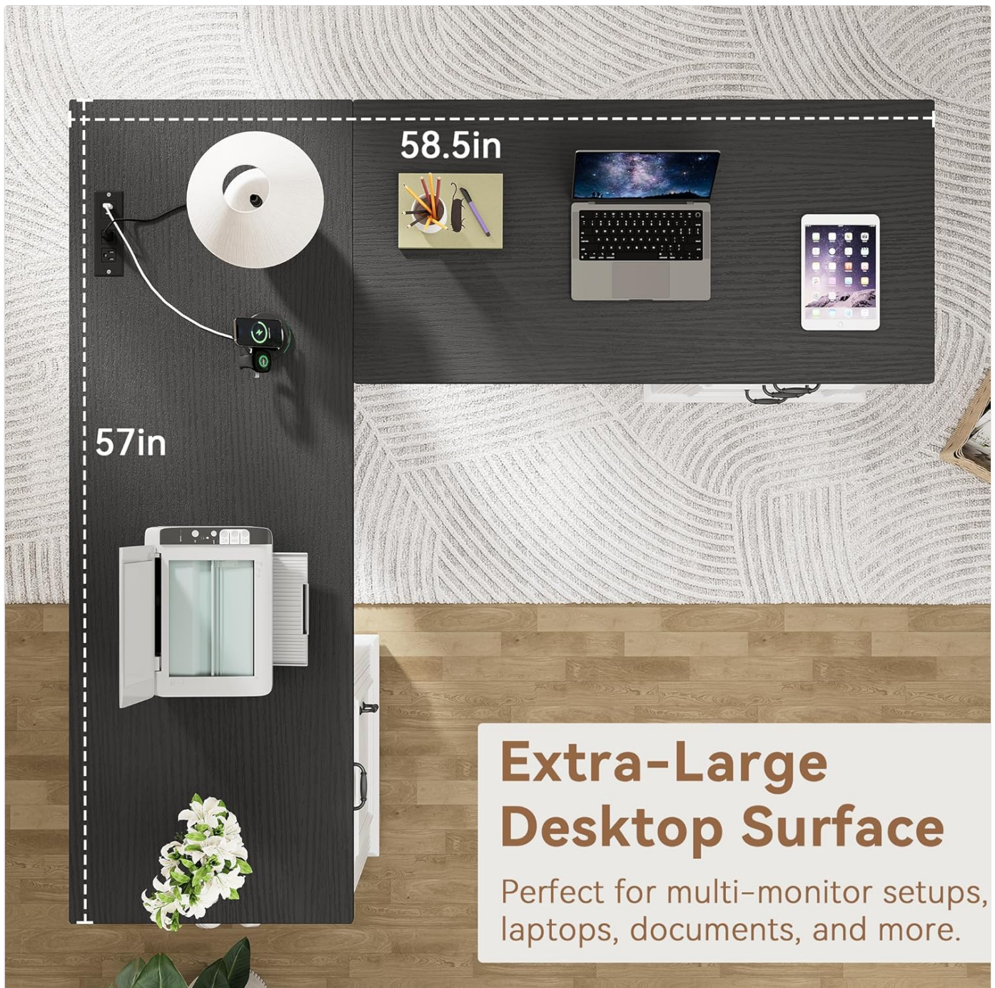
Image 6.2: Overhead view illustrating the extensive desktop surface, ideal for multiple monitors and office equipment.