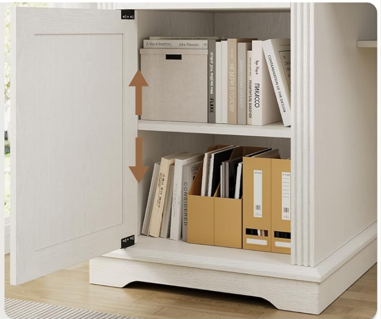
Image 7.3: The hidden under-desk storage shelf for easy access and the large cabinet offering massive storage capacity.

Maximize your storage potential and avoid clutter with this durable cabinet's extra-large interior designed to hold bulky items that are rarely used.