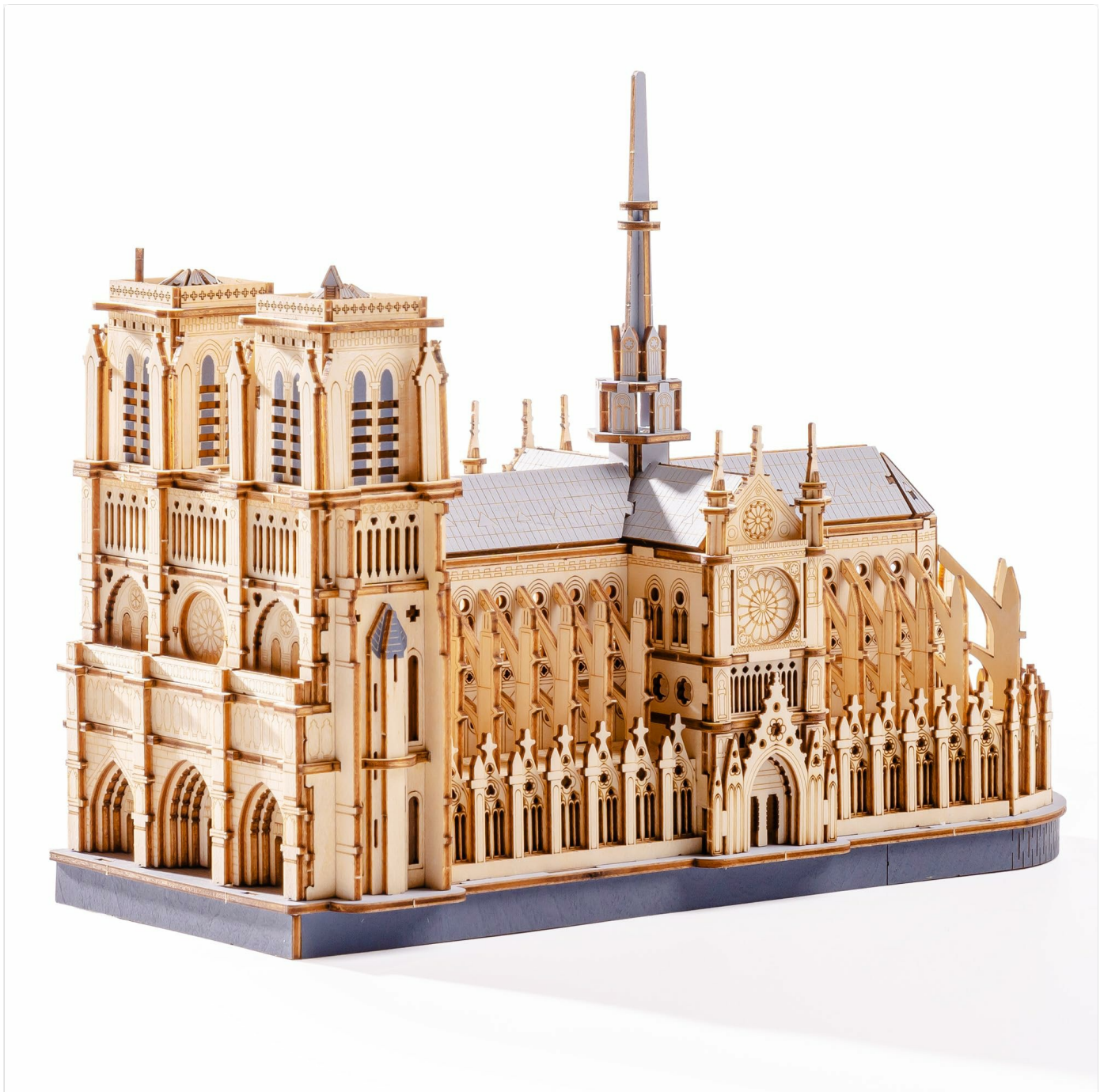
Image 1.1: The fully assembled Notre-Dame de Paris Cathedral 3D Wooden Puzzle.