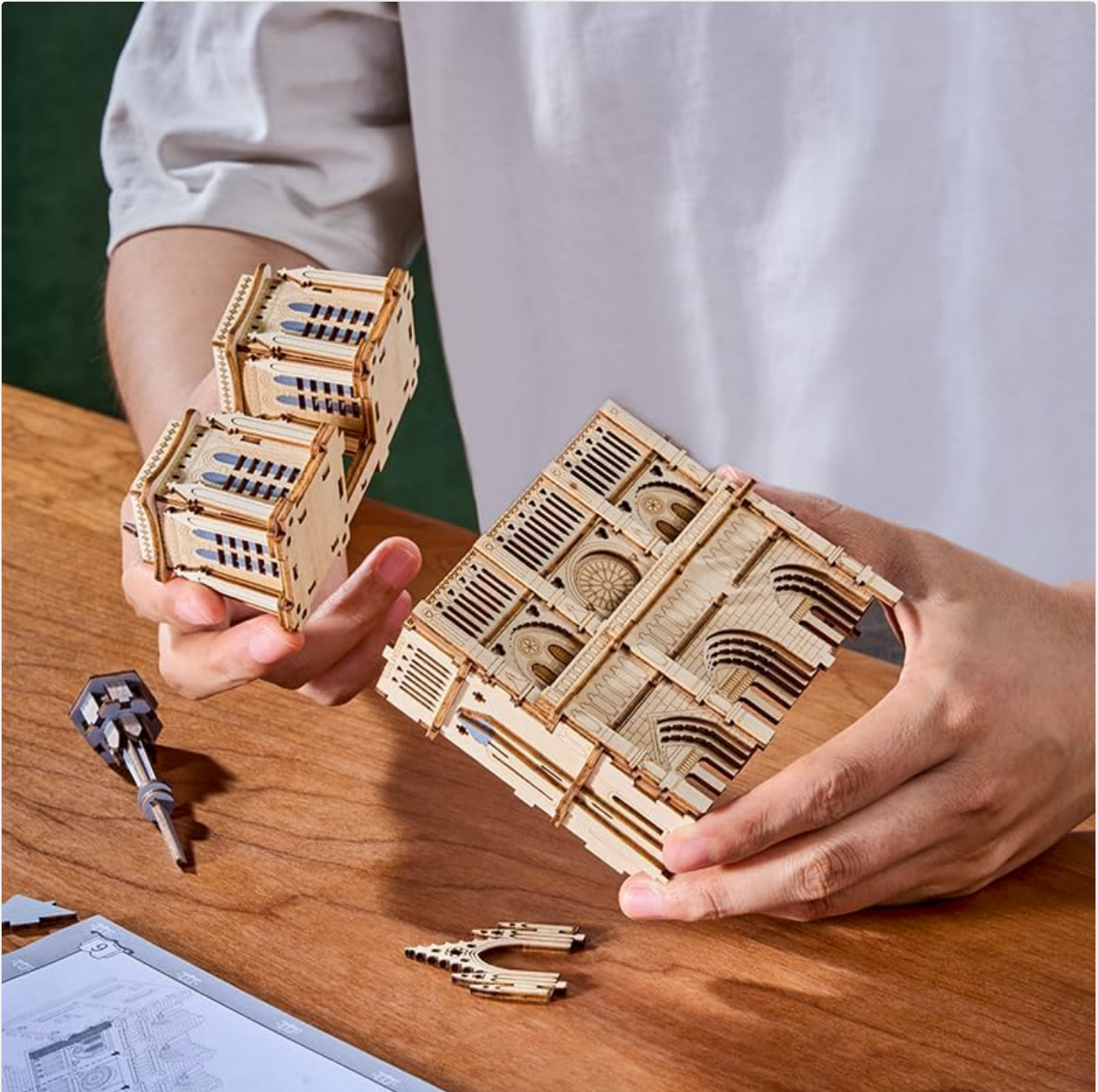
Image 3.1: Demonstrating the assembly of individual wooden components.