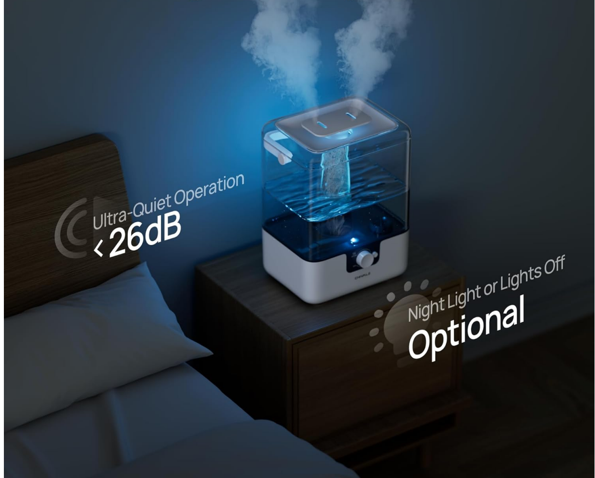
Image: Humidifier in a bedroom, showing quiet operation and nightlight.