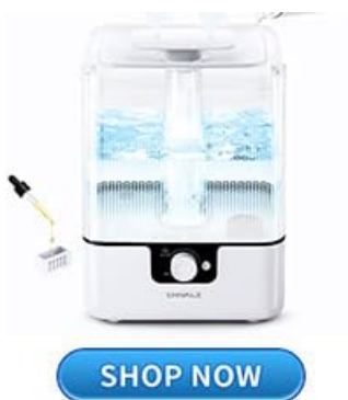
Image: Indicator light button for operational status.

Image: Extended runtime and dry burn protection.