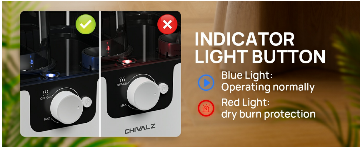
Image: Simple operation process.

Your browser does not support the video tag.