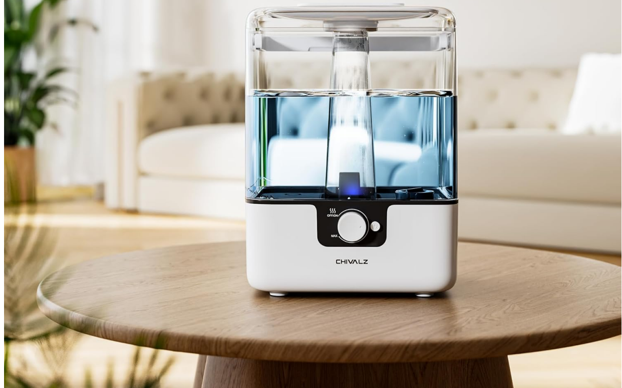
Image: CHIVALZ 6L Humidifier in operation, highlighting its large tank and fast mist.