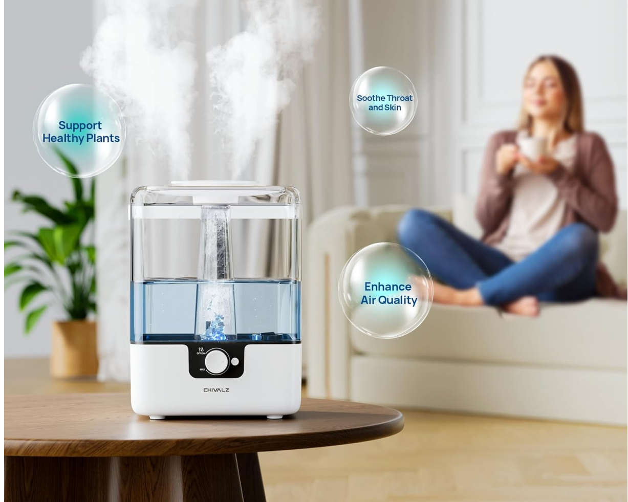
Image: Humidifier providing moisture for comfort and plant health.