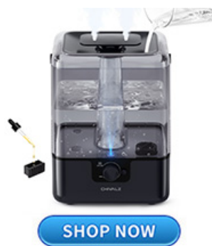
Image: 360-degree adjustable nozzle.