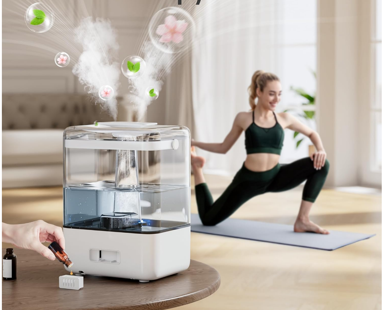
Image: Adding essential oils for aromatherapy.