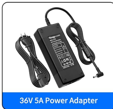
36V 5A Power Adapter