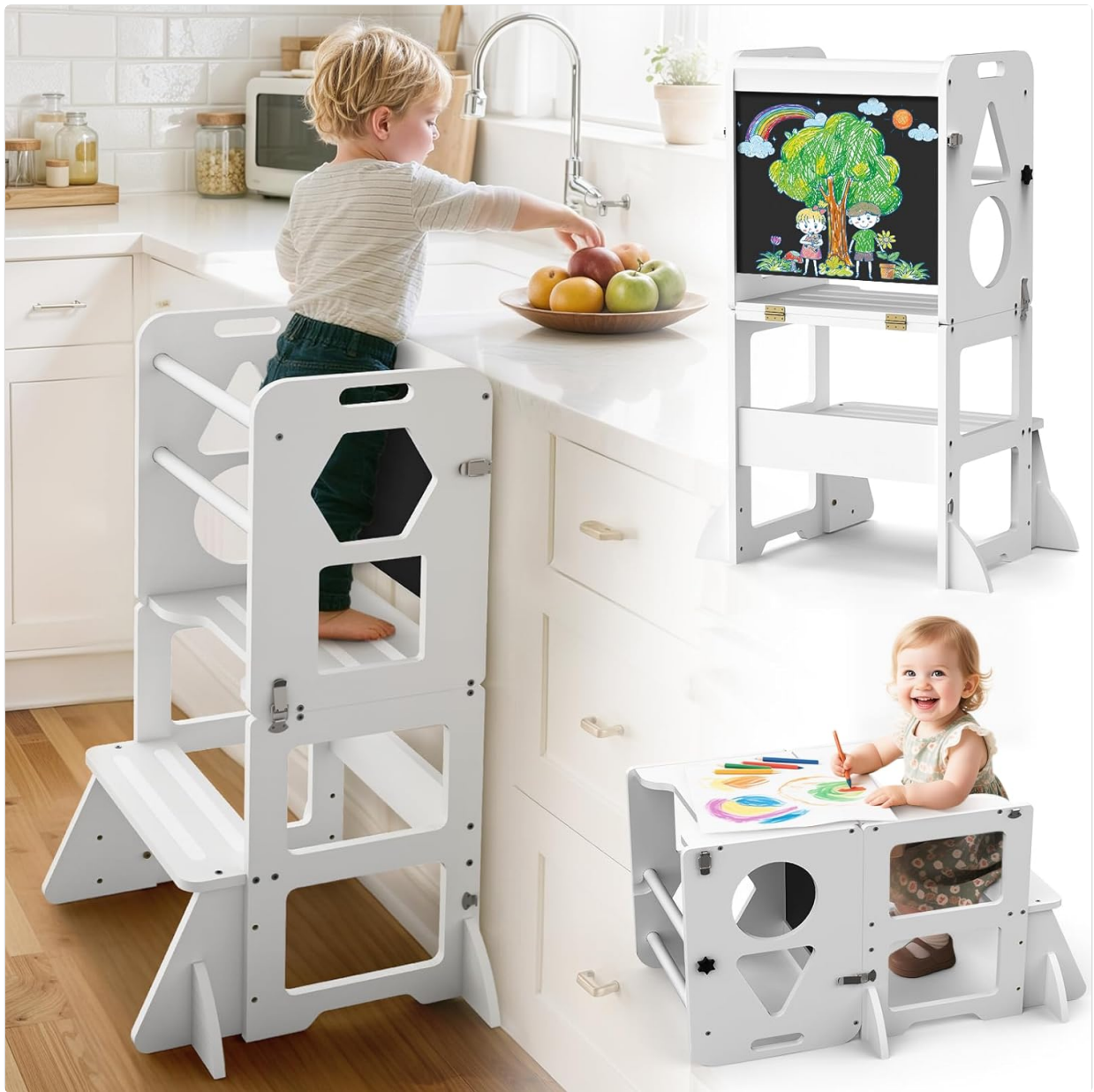
Image: The Woodure 4-in-1 Toddler Kitchen Step Stool demonstrating its multiple uses.