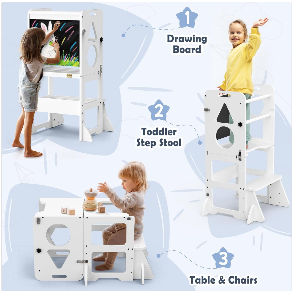
Image: The product showcasing its three primary modes of use.