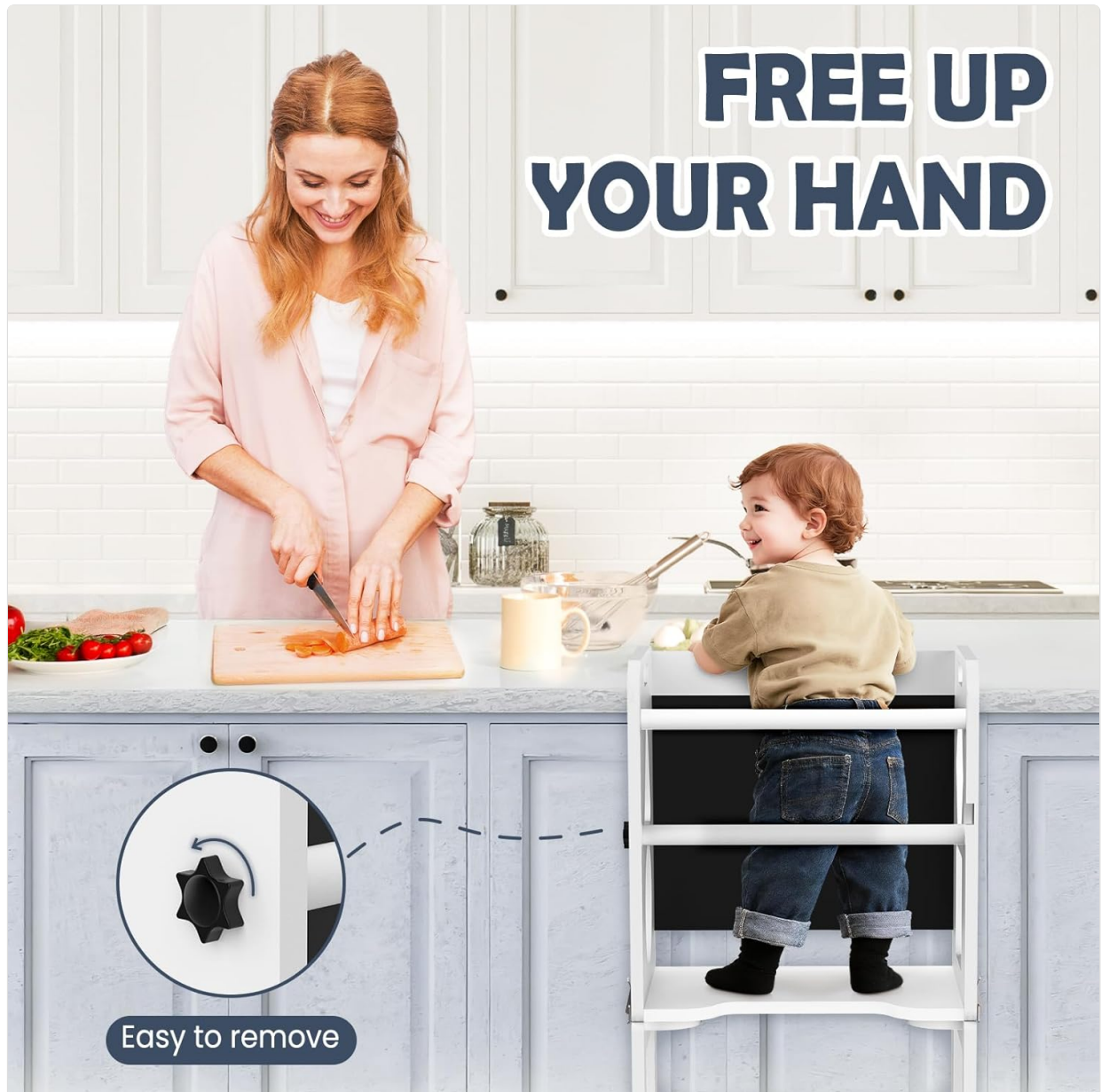
Image: Child using the step stool to participate in kitchen activities.

In this mode, the product functions as a secure standing tower, allowing your child to safely reach counter height. This is ideal for involving them in cooking, baking, and other kitchen activities alongside you.