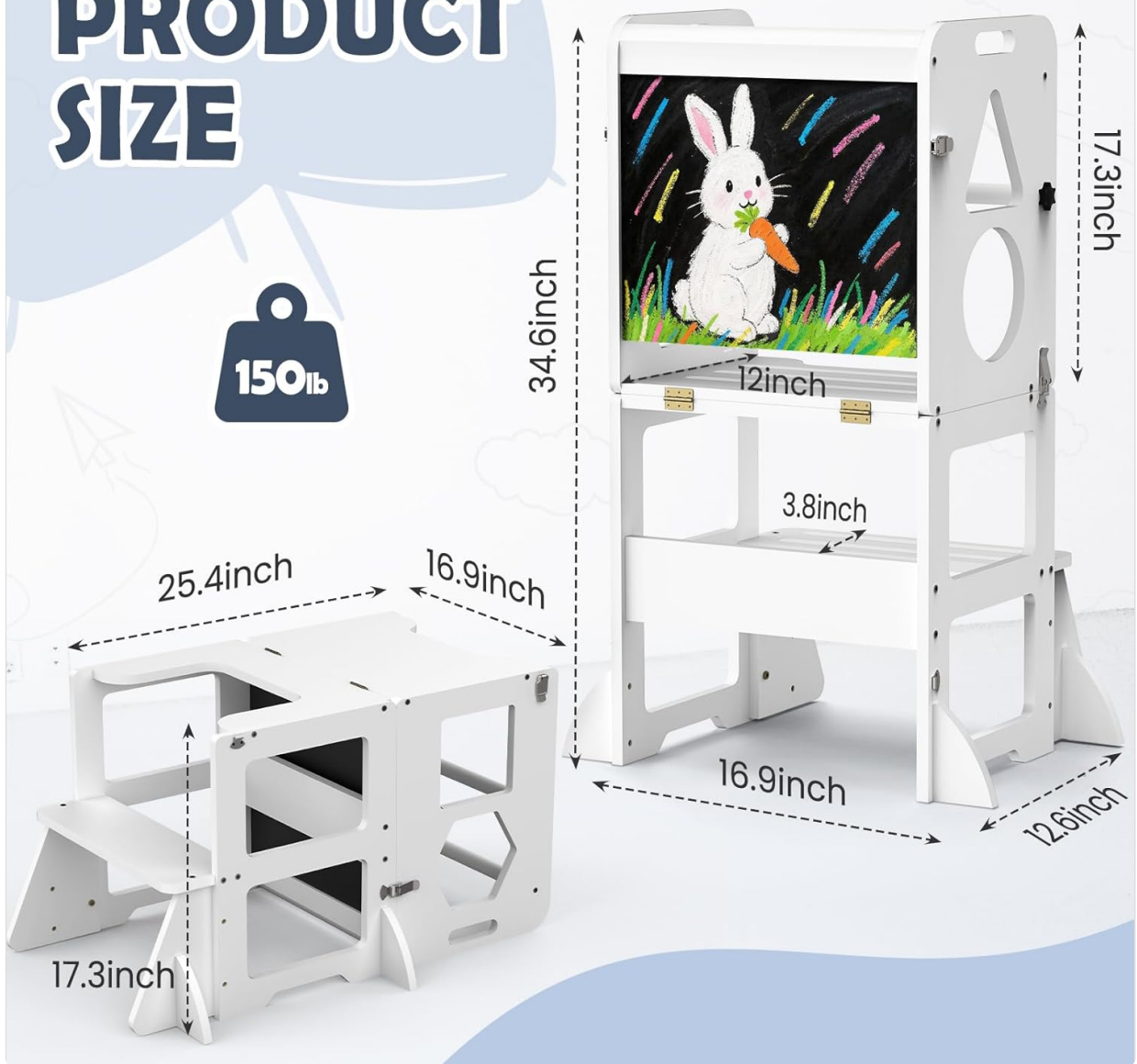
Image: Product dimensions and weight capacity.