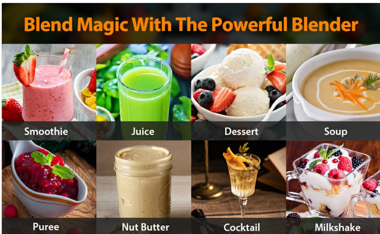
Figure 4: The 3 preset functions simplify common blending tasks.