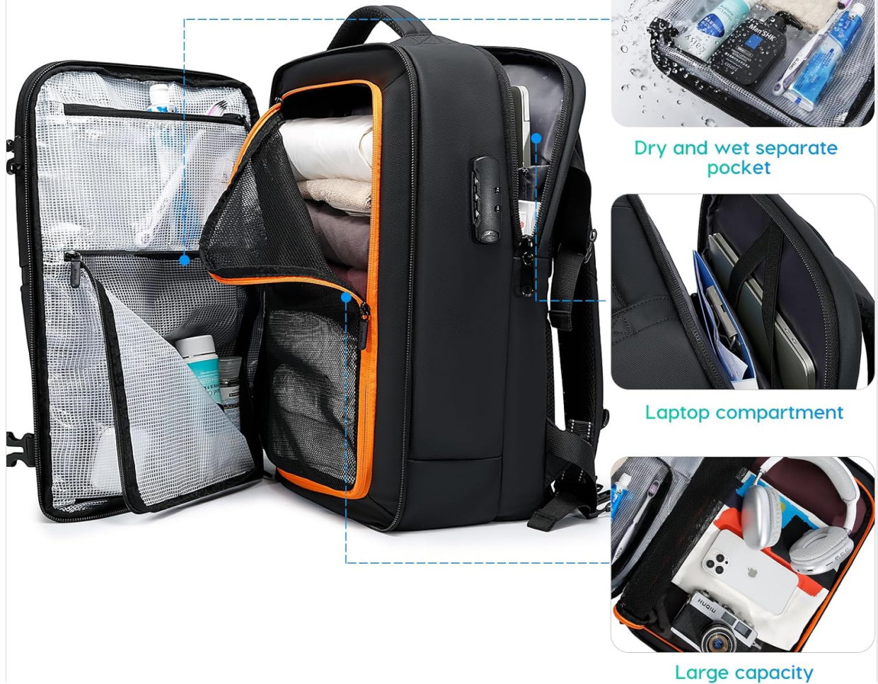
Figure 2: Interior view of the BANGE backpack, highlighting the main storage, dry-wet separation, and laptop compartment.