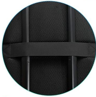
1 luggage strap