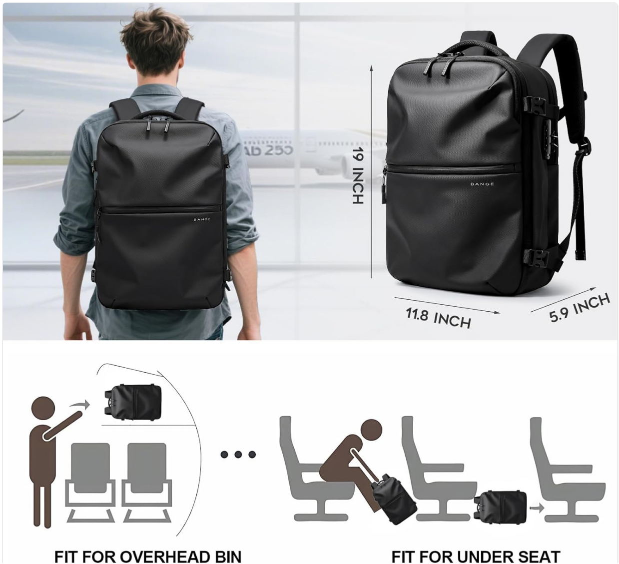
Figure 4: The backpack's dimensions (11.8"L x 19"H x 5.9"W) are suitable for overhead bins and under-seat storage on most flights.