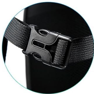
3 Adjustable Chest strap