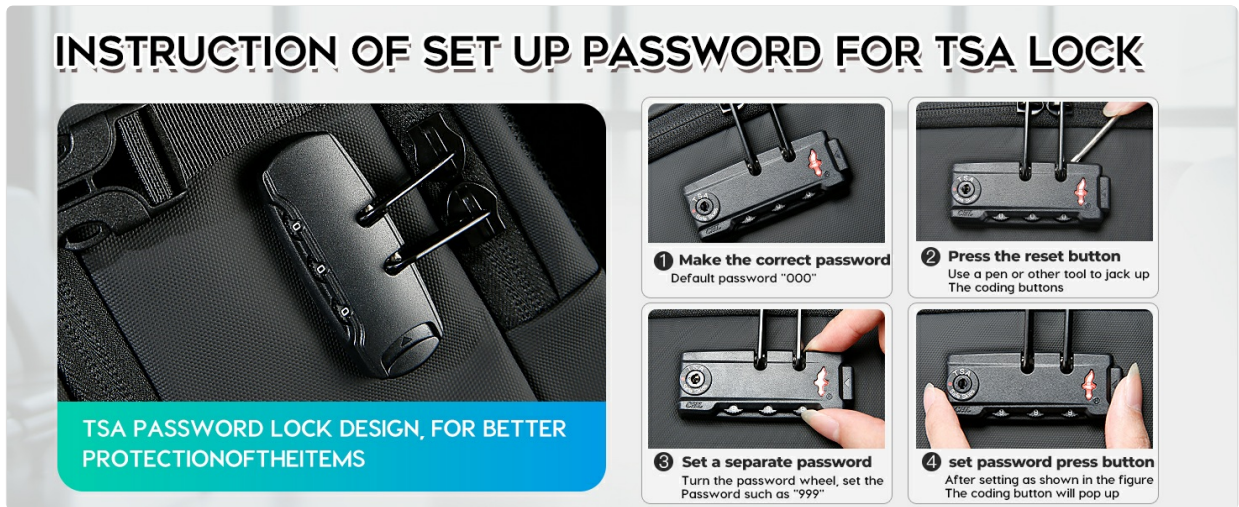
Figure 1: Visual guide for setting the TSA lock combination. The default is '000', press the reset button, set your new code, then release.