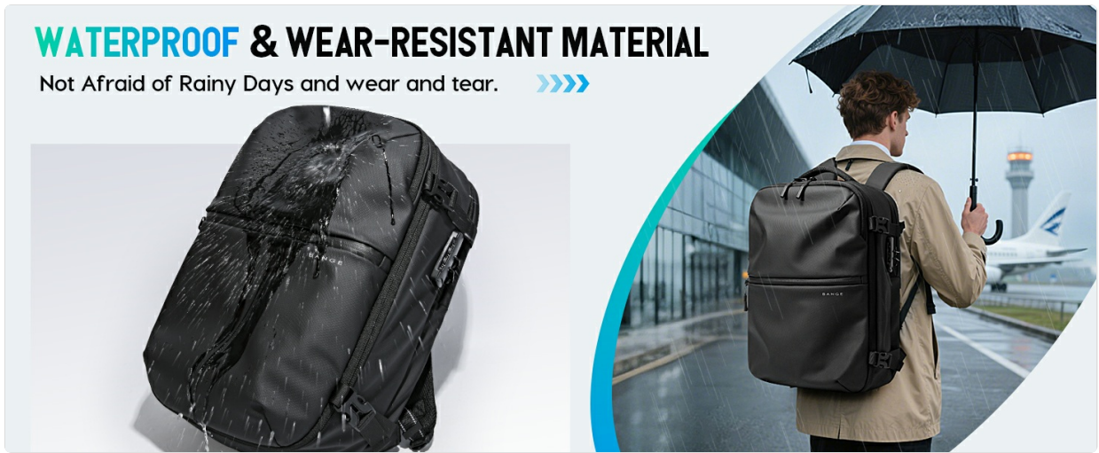
Figure 5: The Oxford cloth material provides water resistance, making it suitable for various weather conditions.

Not Afraid of Rainy Days and wear and tear. >>>>