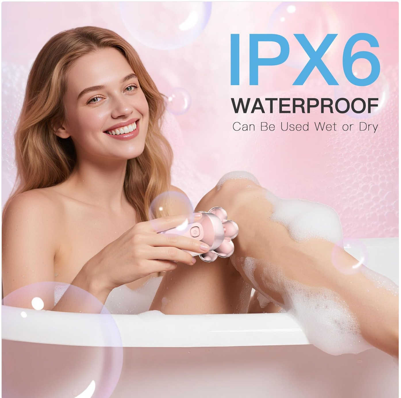
Image: The shaver being used in a wet environment, demonstrating its IPX6 waterproof rating.