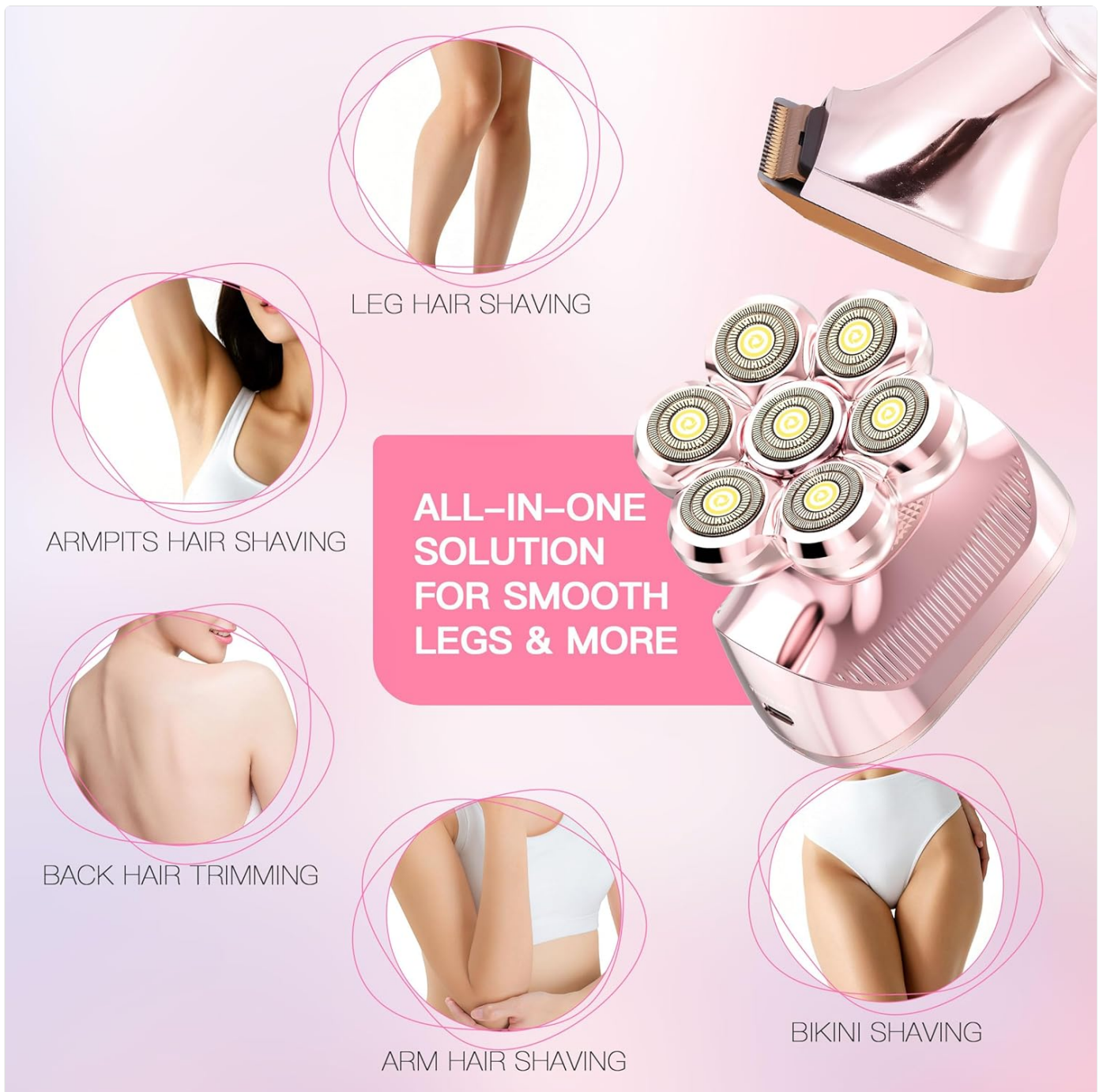
Image: Demonstrates the versatility of the shaver for use on legs, armpits, back, arms, and bikini area.

Your browser does not support the video tag.