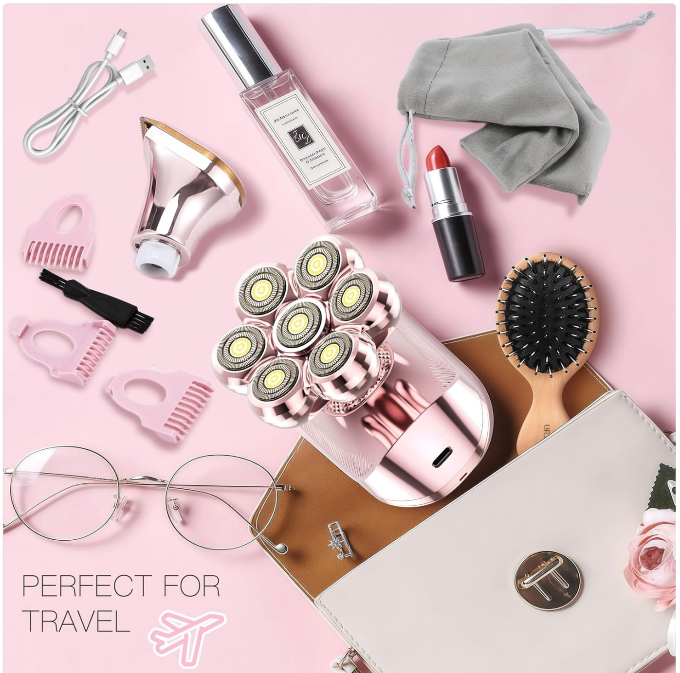
Image: The HEBECA shaver with its various attachments and accessories, including the travel pouch and charging cable.