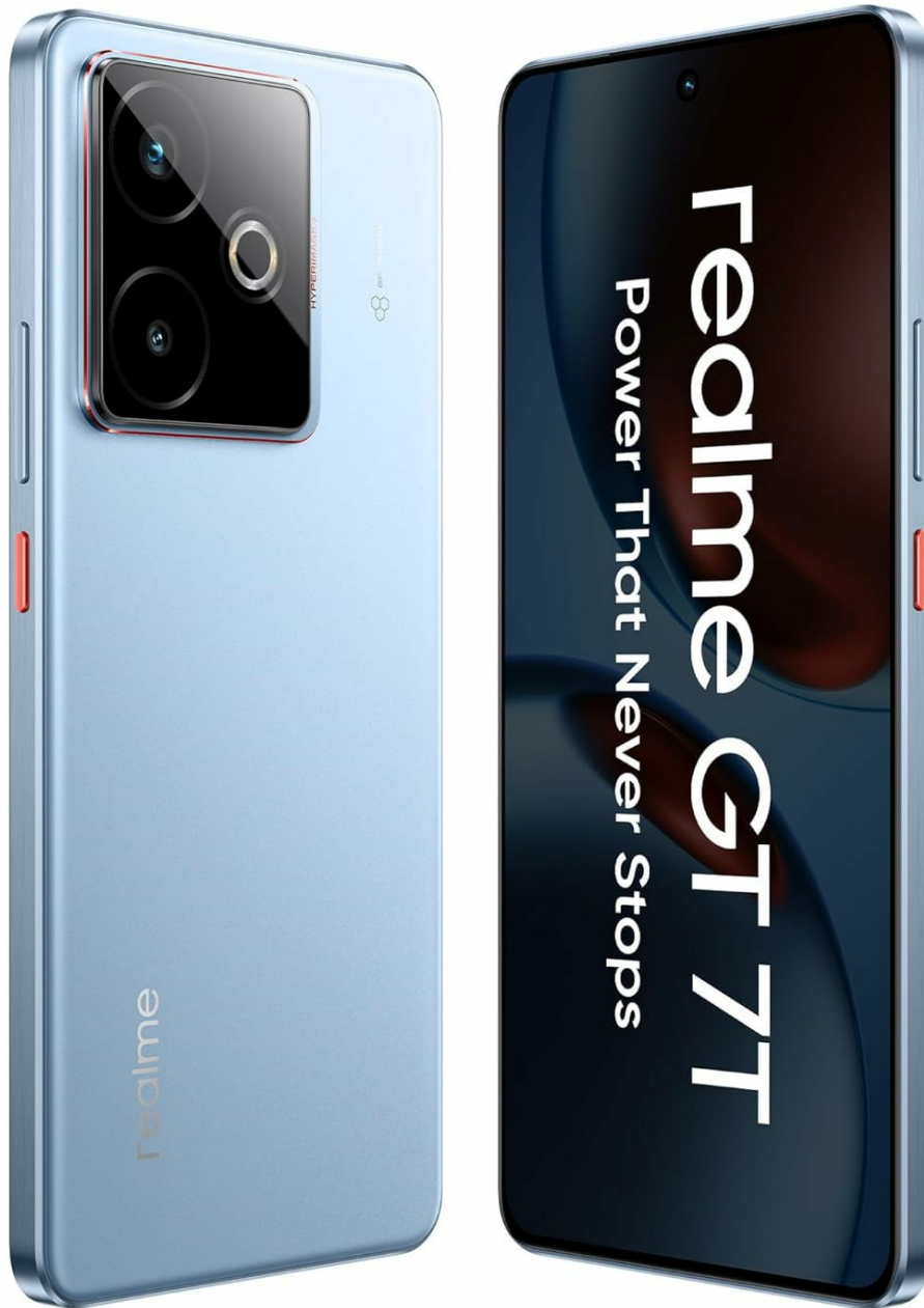
Image: The realme GT 7T highlighting its IP69 rating and ArmorShell™ Glass for enhanced durability.