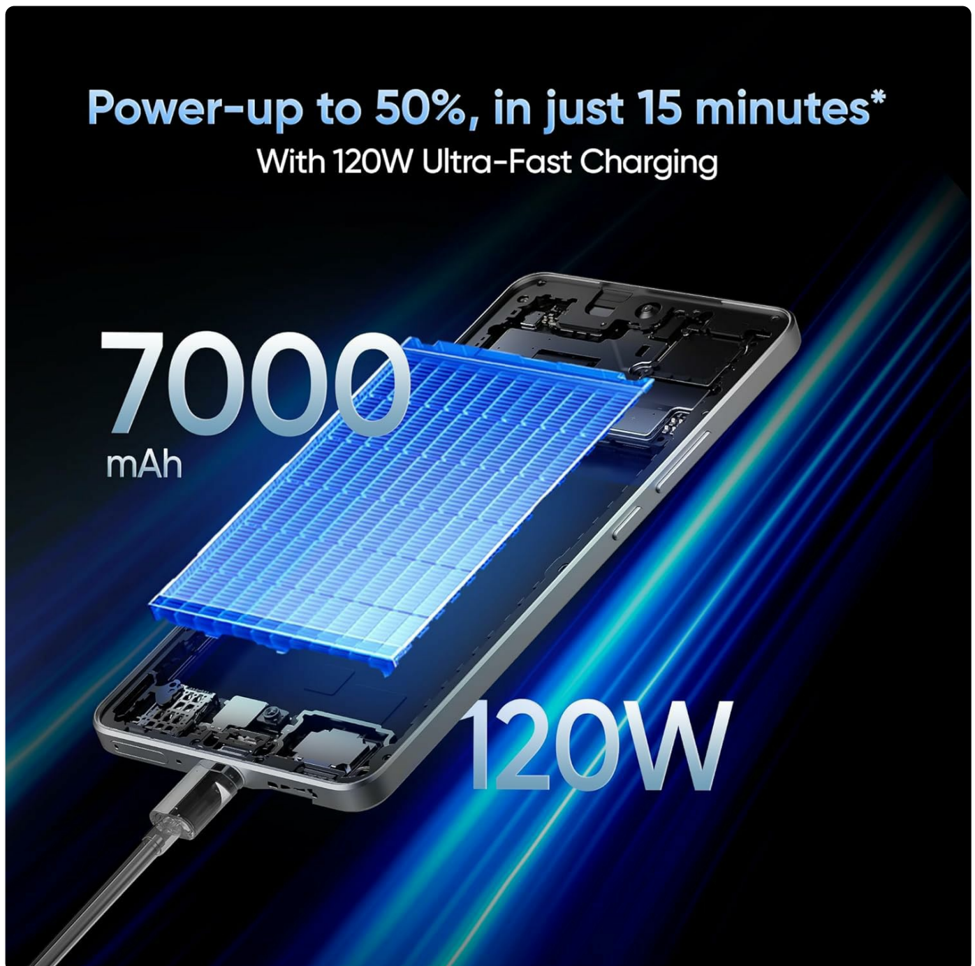
Image: The realme GT 7T connected to its 120W Ultra-Fast Charger, illustrating the rapid charging capability.