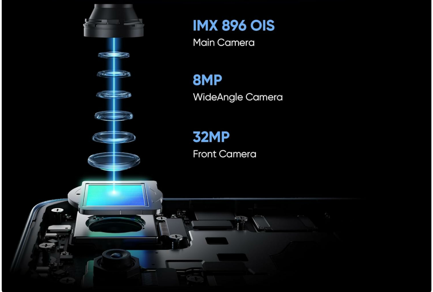
Image: Exploded view of the AI Travel Snap Camera system, detailing its IMX 896 OIS Main Camera, Wide Angle Camera, and Front Camera.