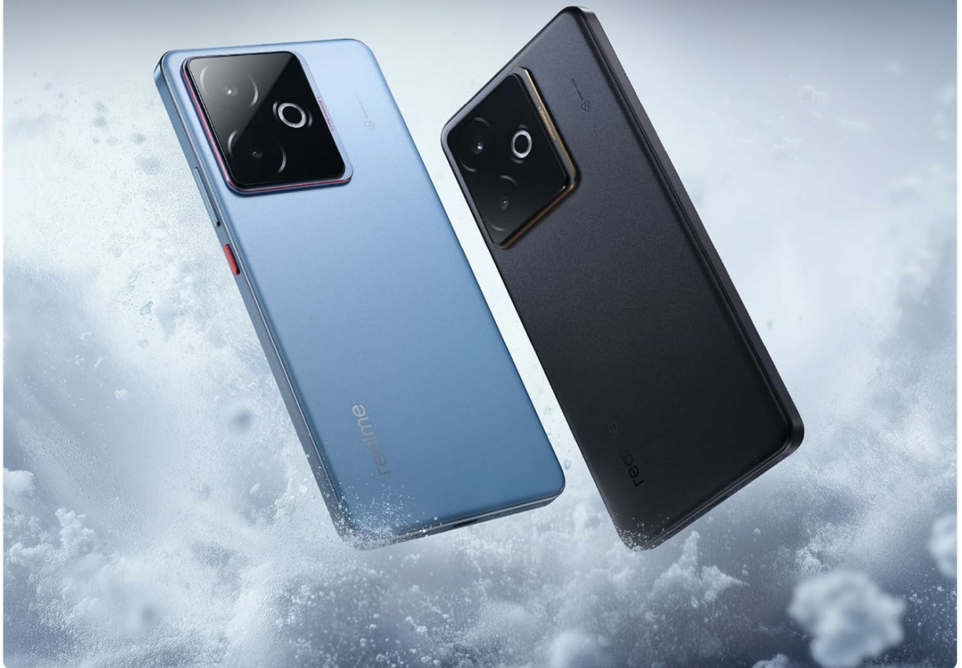
Image: Two realme GT 7T phones illustrating the Graphene Cover IceSense Design for 360° Ultimate Cooling.