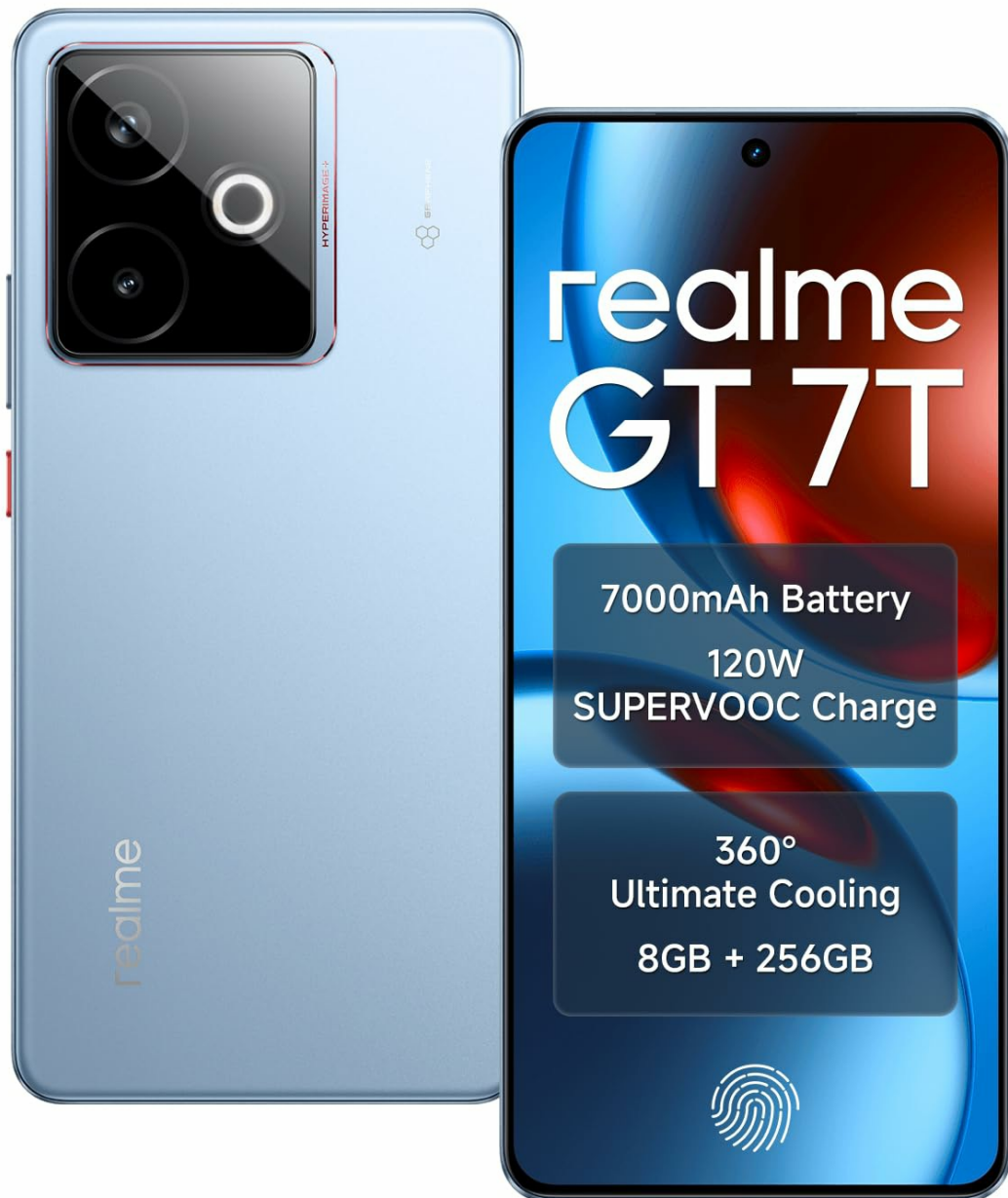
Image: The realme GT 7T Smartphone, showcasing its design and color.

The realme GT 7T features a 6.8-inch 120Hz display, MediaTek Dimensity 8400-MAX processor, 7000mAh battery with 120W UltraDART charging, a 50MP AI Triple Camera system, and IP69 durability. It operates on Android 15.