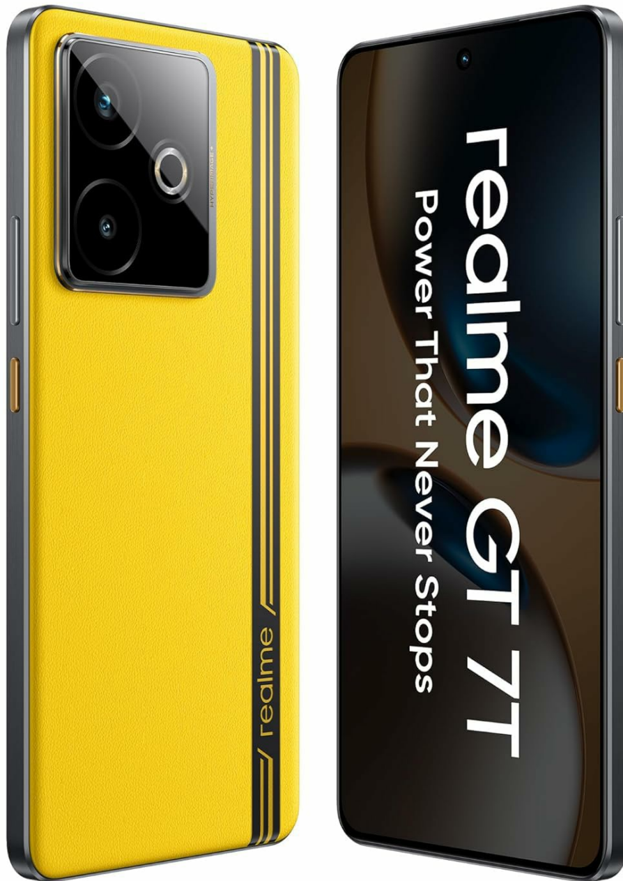
Image: Front view of the realme GT 7T Smartphone, showcasing its display.