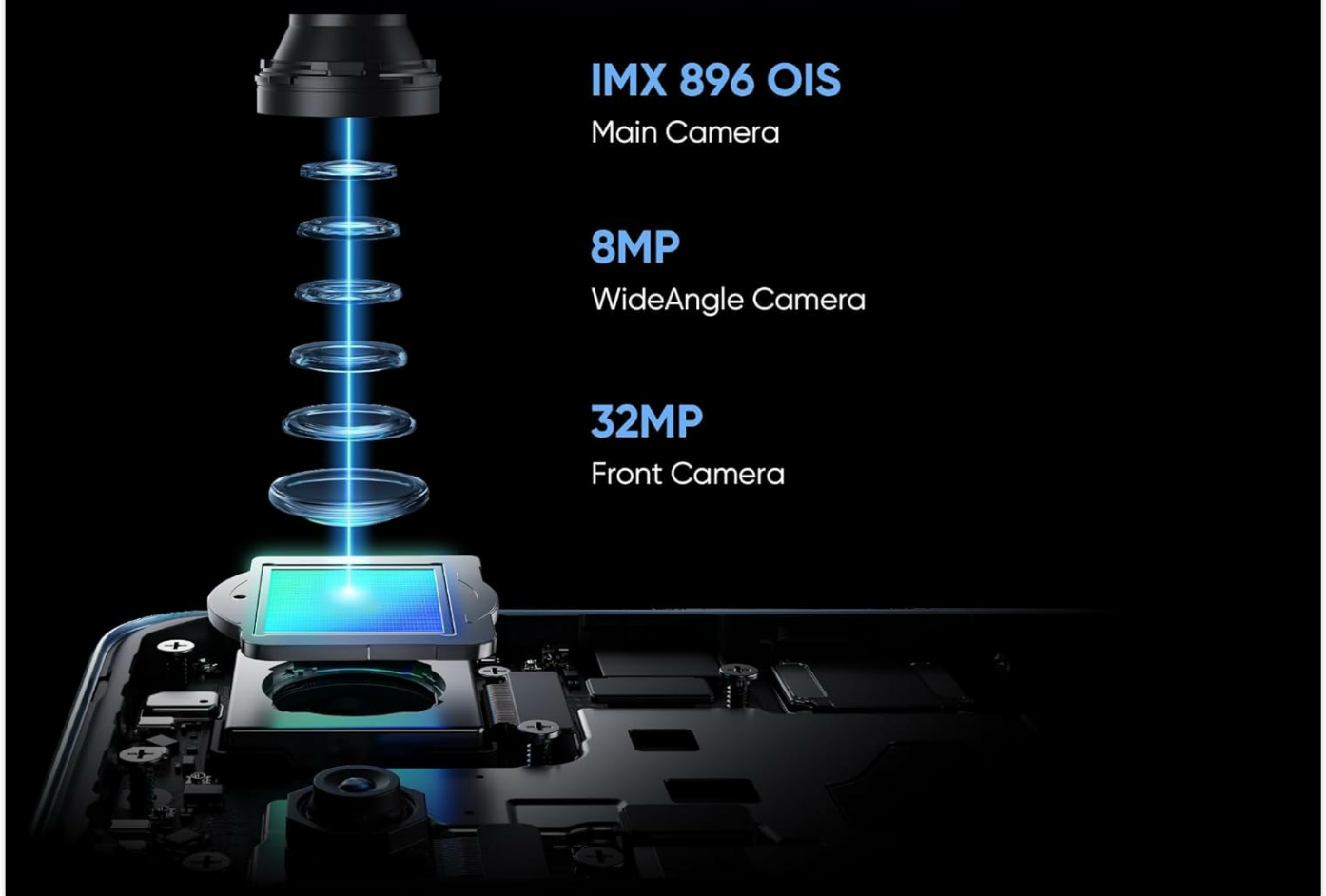
Image: Diagram illustrating the components of the realme GT 7T's AI Camera system, including the 50MP OIS main camera, 8MP wide-angle camera, and 32MP front camera.