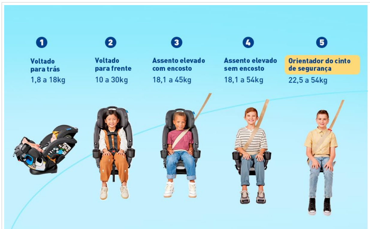
Image: Visual representation of the five modes of use for the Graco 4Ever DLX Grad car seat, illustrating how it adapts from rear-facing harness for infants to a seat belt guide for older children, with corresponding weight and height ranges.