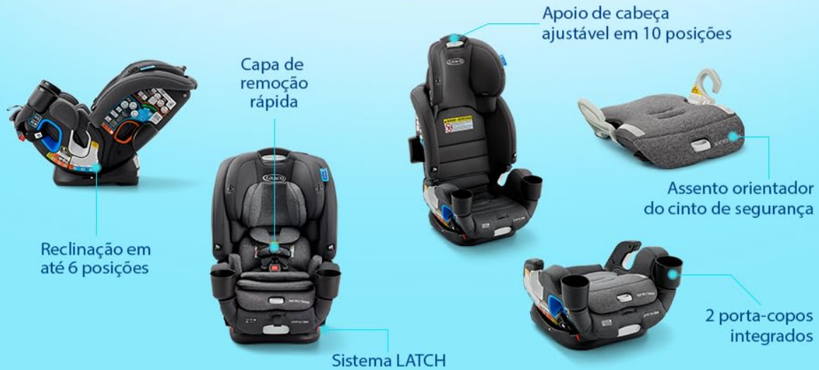
Image: Overview of the Graco 4Ever DLX Grad car seat highlighting its key features such as the 10-position adjustable headrest, reinforced steel structure, harness storage compartment, quick-remove cover, two integrated cup holders, LATCH system, up to 6 recline positions, and seat belt guide.