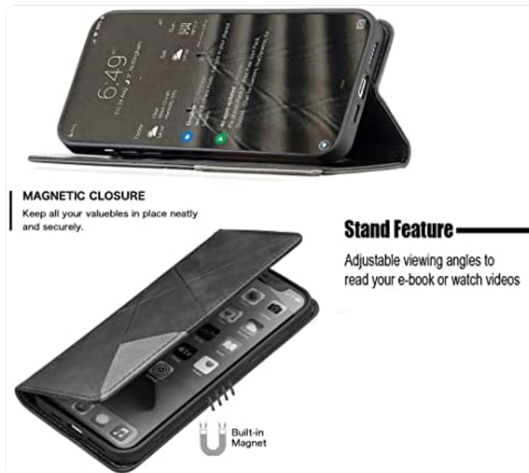
Image: Demonstration of the magnetic closure and stand feature.