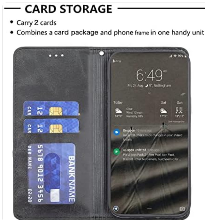
Image: Illustration of the card storage capacity within the case.