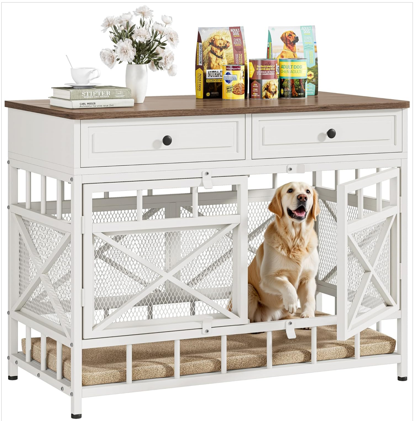
Figure 1: Fully assembled IRONCK dog crate furniture with a dog inside.