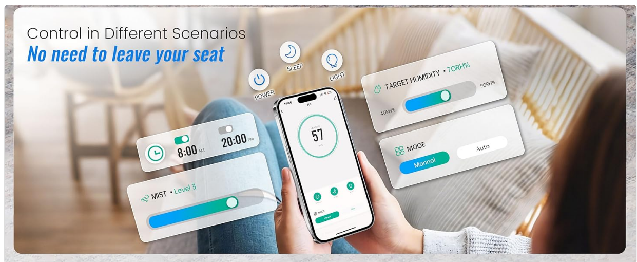
Image 3.1: The humidifier's smart control interface on a mobile app, allowing for precise adjustments and scheduling.