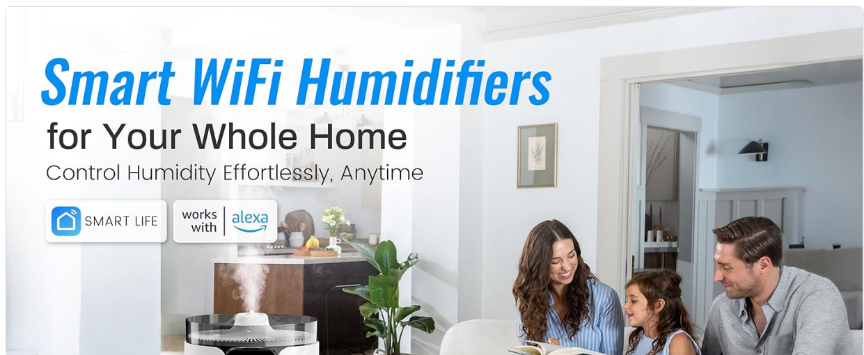
Image 1.1: The Lacidoll 16L Smart Humidifier seamlessly integrated into a modern living space, showcasing its smart WiFi capabilities and extensive coverage.

The Lacidoll 16L Smart Ultrasonic Cool Mist Humidifier is designed to provide efficient and customizable humidification for large spaces up to 1500 sq.ft. Featuring a substantial 4.2-gallon (16L) tank, it offers extended operation for up to 48 hours on a single fill. This smart humidifier integrates touch, app, and voice control for convenient management of humidity levels, mist output, and various settings. It includes a built-in humidistat for energy-saving automatic operation, a diffuser tray for essential oils, and safety features like auto-shutoff.