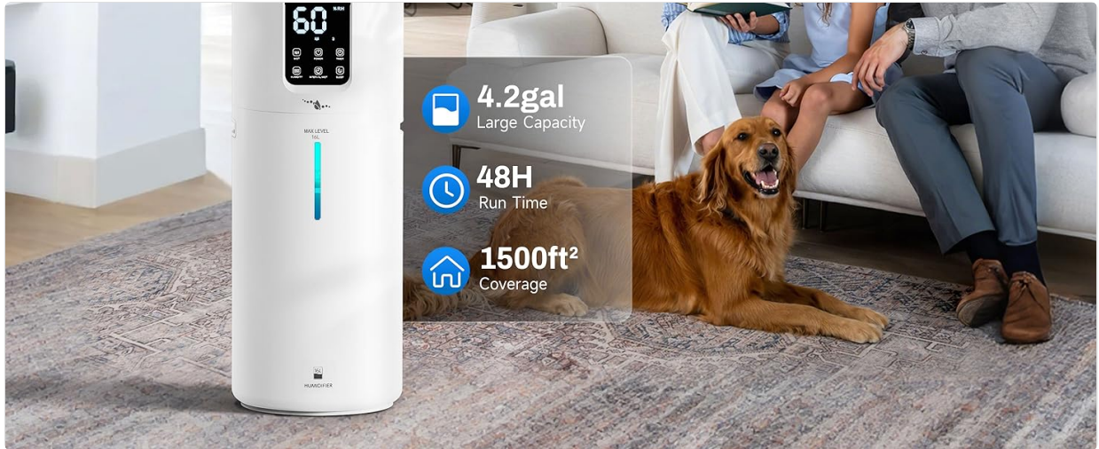
Image 2.1: Visual representation of the humidifier's large 4.2-gallon (16L) capacity, ensuring long operational periods.