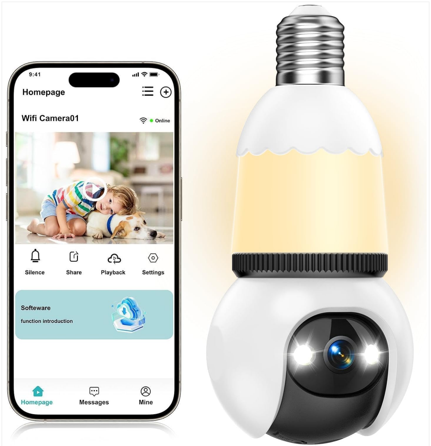
Image: Front view of the Hawkray WiFi Light Bulb Security Camera alongside a smartphone displaying its app interface. The camera features a white and black dome design with visible lenses and lights, and a standard light bulb screw base.