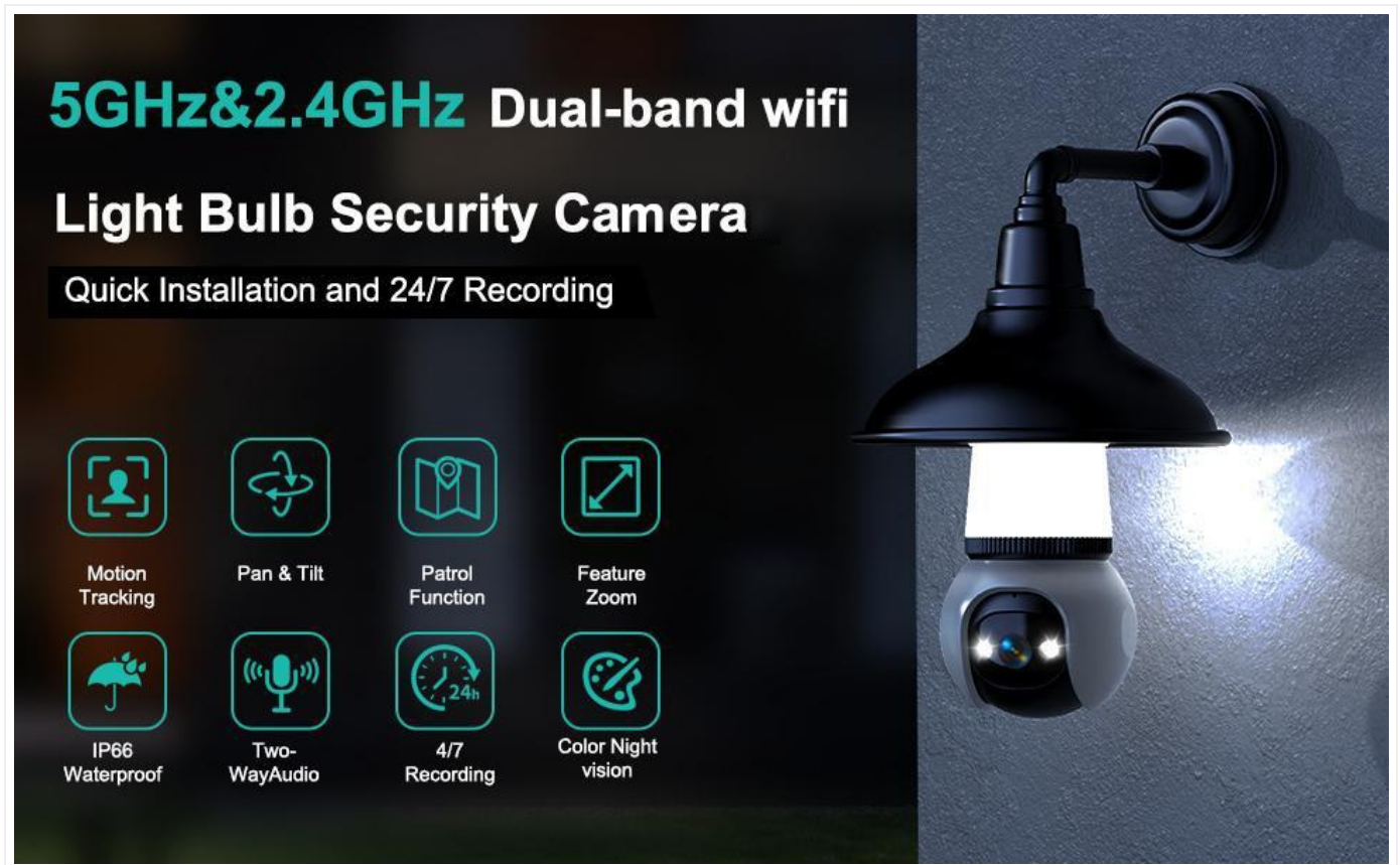
Image: The Hawkray light bulb camera installed in an outdoor wall-mounted light fixture, demonstrating its dual function as a light source and security camera.

Image: Diagram illustrating the easy installation process. Step 1 shows connecting the camera near a router using an offered socket. Step 2 shows screwing the camera into a light socket, emphasizing its simple plug-and-play nature.