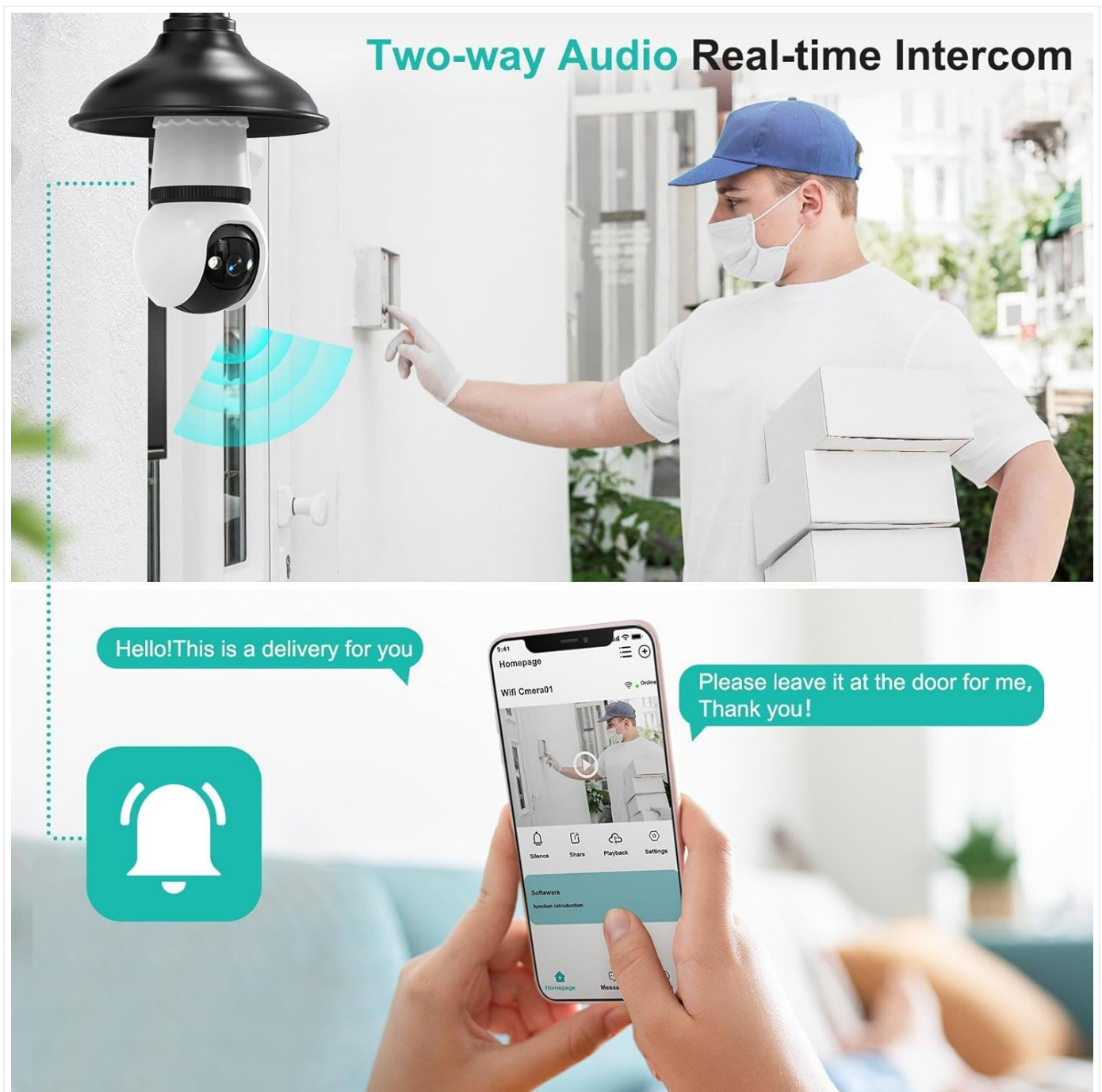
Image: A delivery person at a door, with the Hawkray camera installed above. A smartphone screen shows a message "Hello! This is a delivery for you" and a reply "Please leave it at the door for me, Thank you!", demonstrating the two-way audio feature.