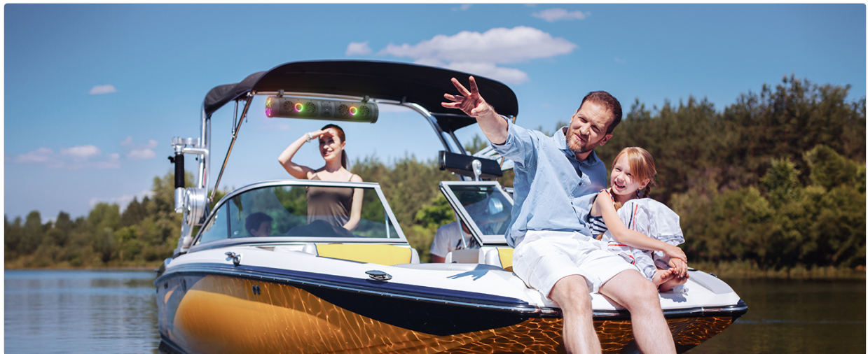
Figure 5: Example of two sound bars connected in TWS mode for enhanced audio coverage.

Connect two Ehaho sound bars in TWS mode for a more powerful and immersive stereo experience. Refer to the user guide for detailed pairing instructions.