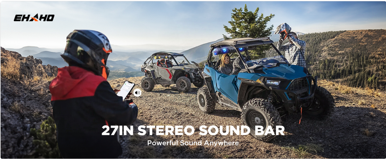
Figure 6: The sound bar's dynamic RGB lighting system, offering multiple colors and effects.

Your browser does not support the video tag.