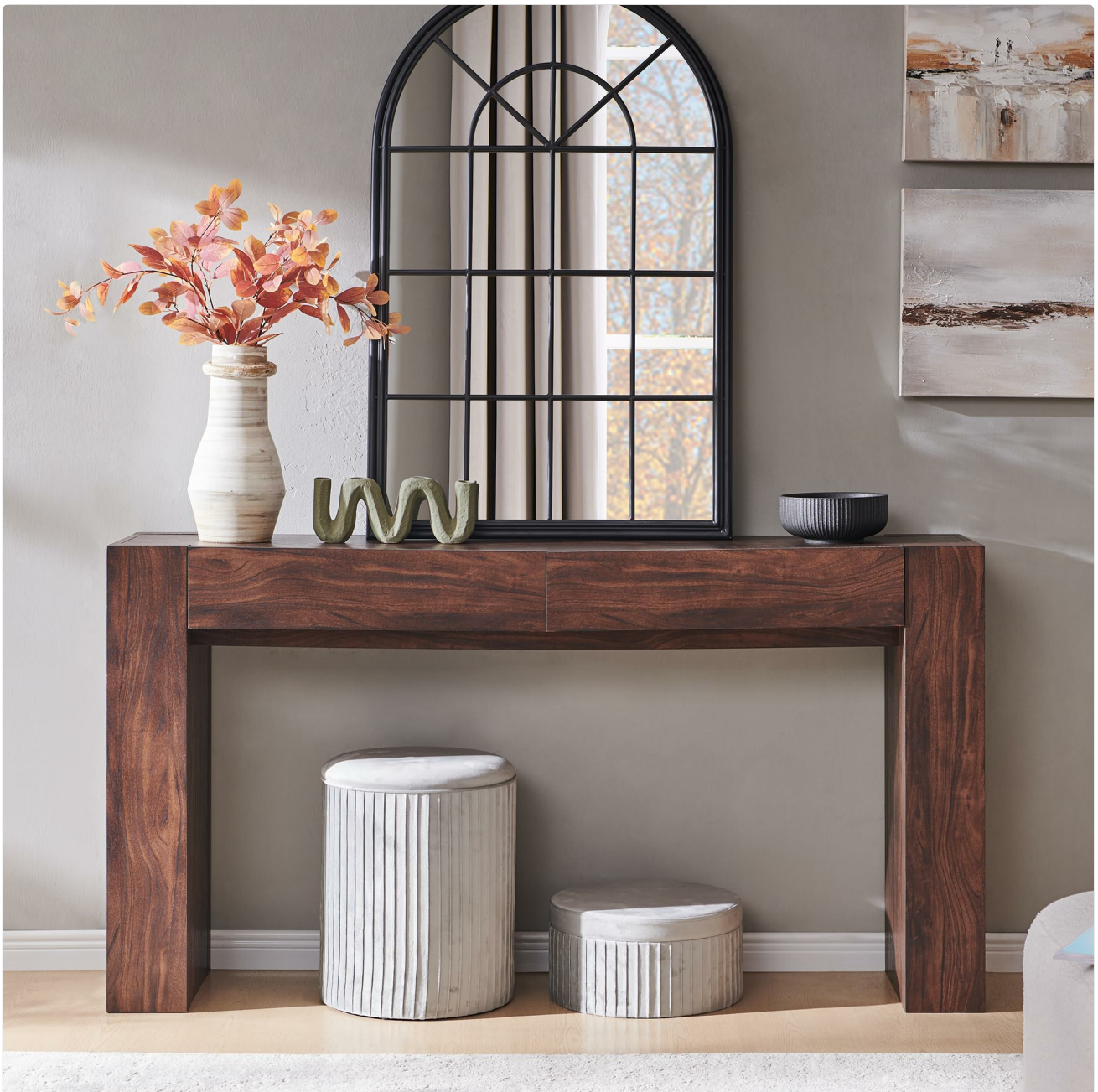
Figure 4: OKD Console Table in Dark Walnut. A full view of the console table, showcasing its dark walnut finish and overall aesthetic.