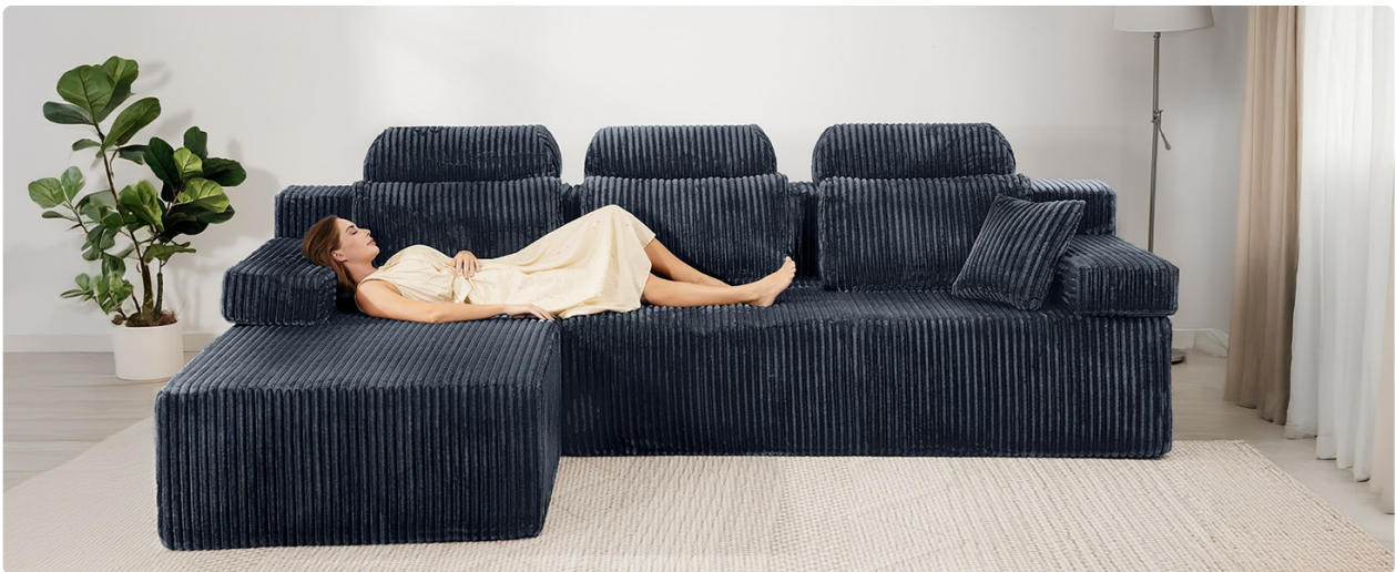
Image: Foam sectional sofa expanding after being unboxed, showing the material texture.