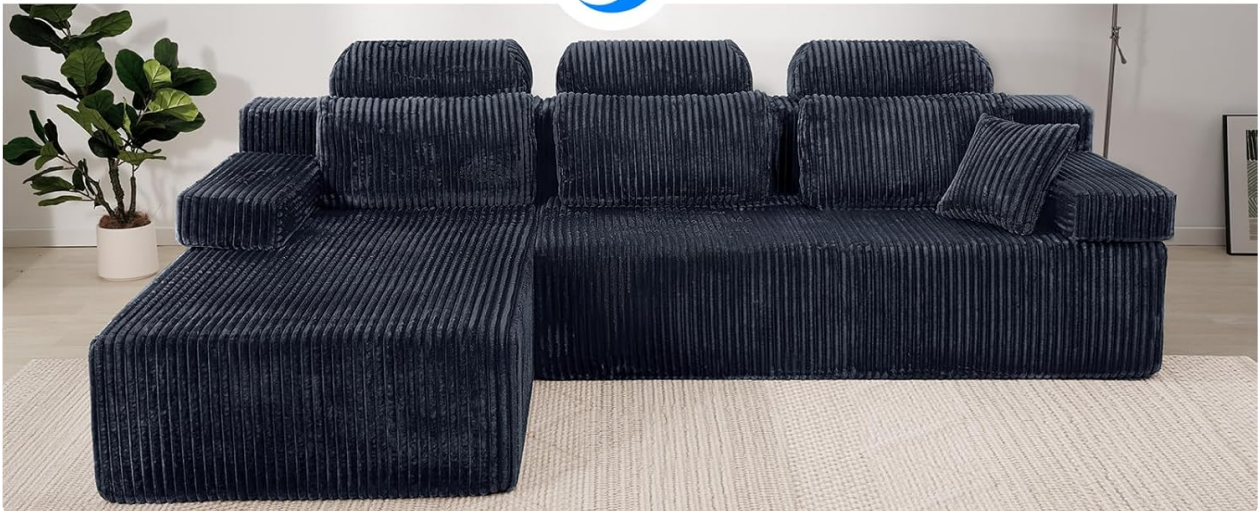
Image: Demonstrates the flexible and movable chaise, allowing for left or right configuration.