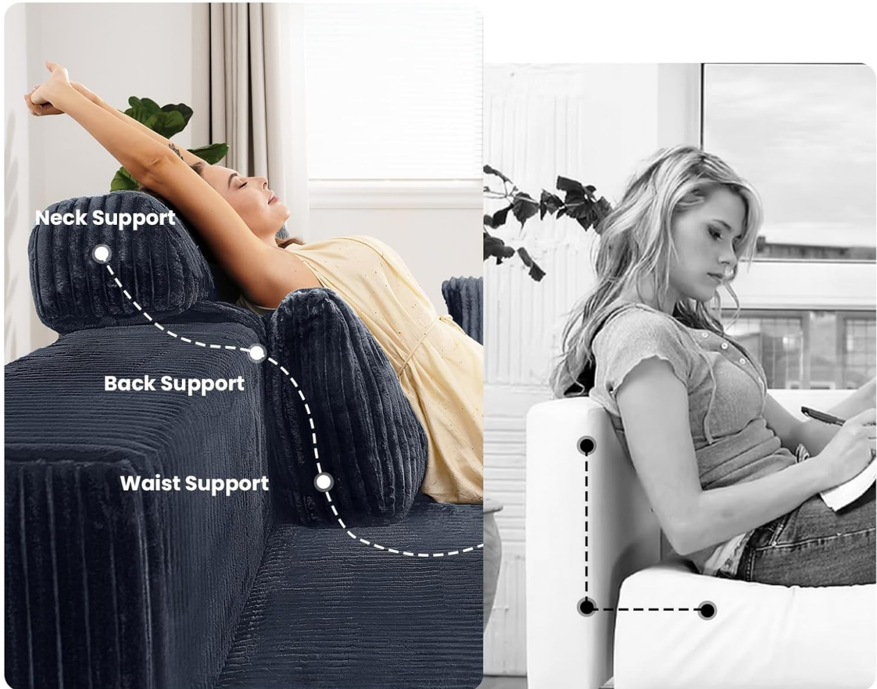
Image: A person relaxing on the sofa, highlighting the ergonomic high backrest design for neck, back, and waist support.

Perfectly support your neck, back and waist, protecting your sitting posture while relaxing your body