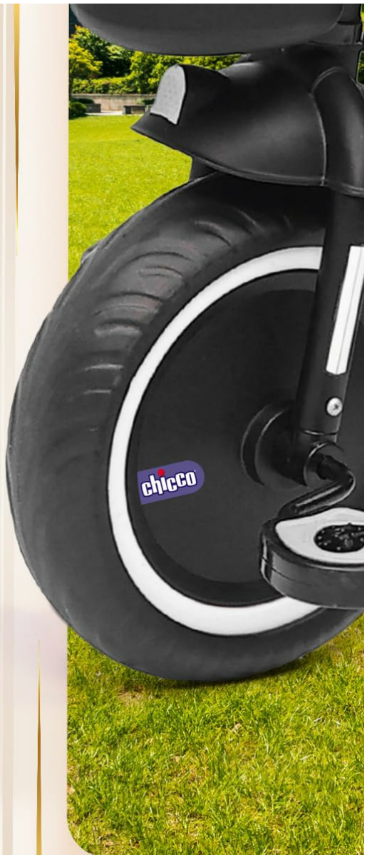
Image: Close-up of the anti-puncture EVA wheels, with illustrations showing suitability for marble/tiles, concrete, wooden, and grass surfaces.