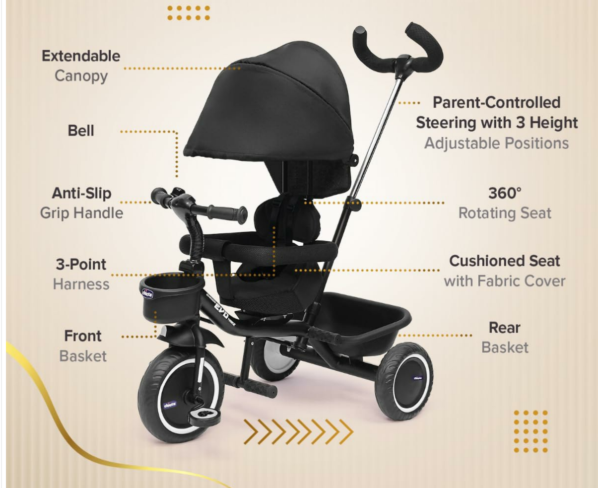
Image: An annotated diagram highlighting key features such as the extendable canopy, bell, anti-slip grip handle, 3-point harness, front basket, 360° rotating seat, cushioned seat with fabric cover, rear basket, and parent-controlled steering with 3 height adjustable positions.