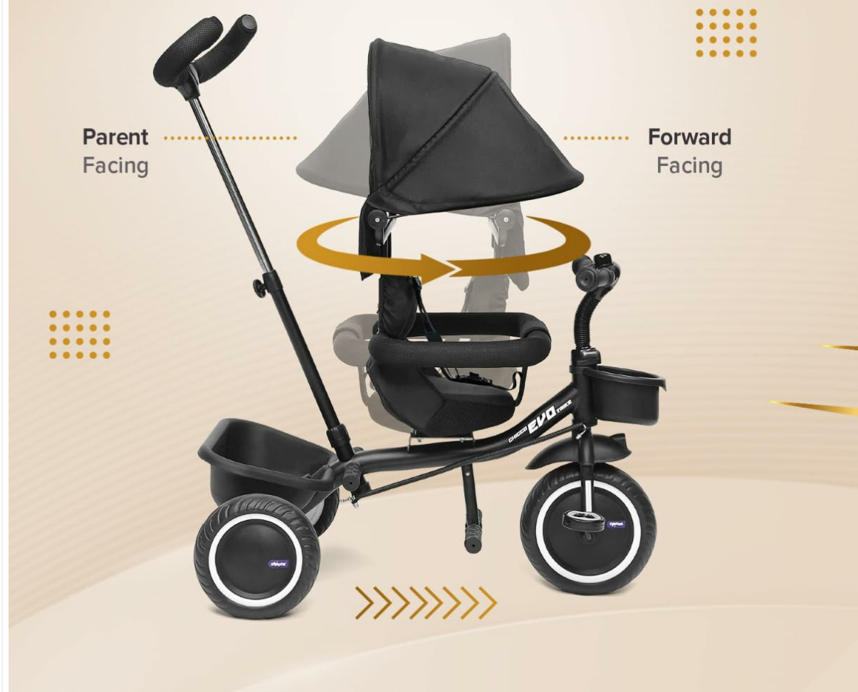
Image: A diagram demonstrating the 360° seat rotation, showing the seat transitioning from parent-facing to forward-facing positions.