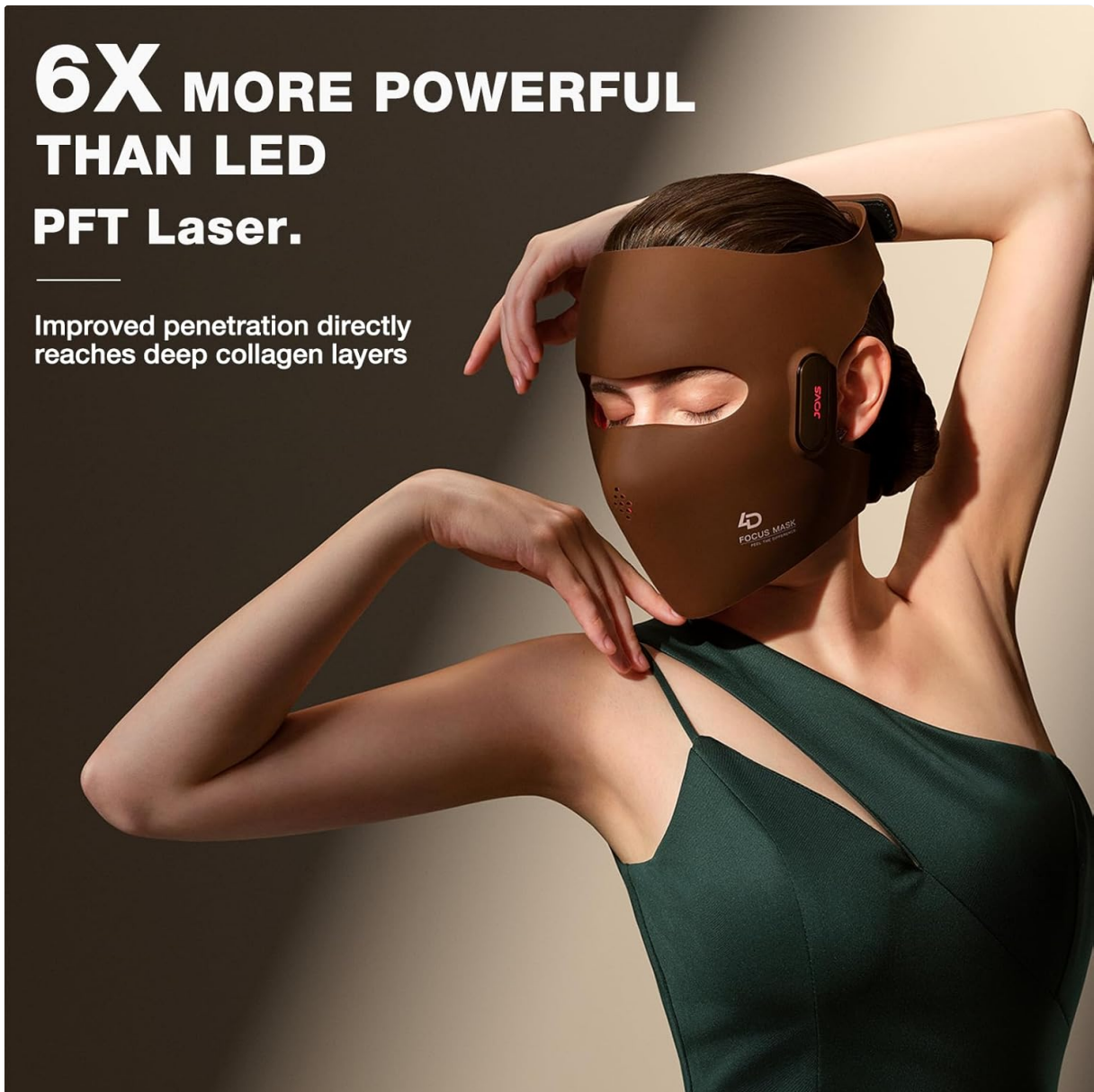
Figure 2.1: The JOVS 4D Laser Light Therapy Mask in use, highlighting its ergonomic design and how it fits the face.

Improved penetration directly reaches deep collagen layers