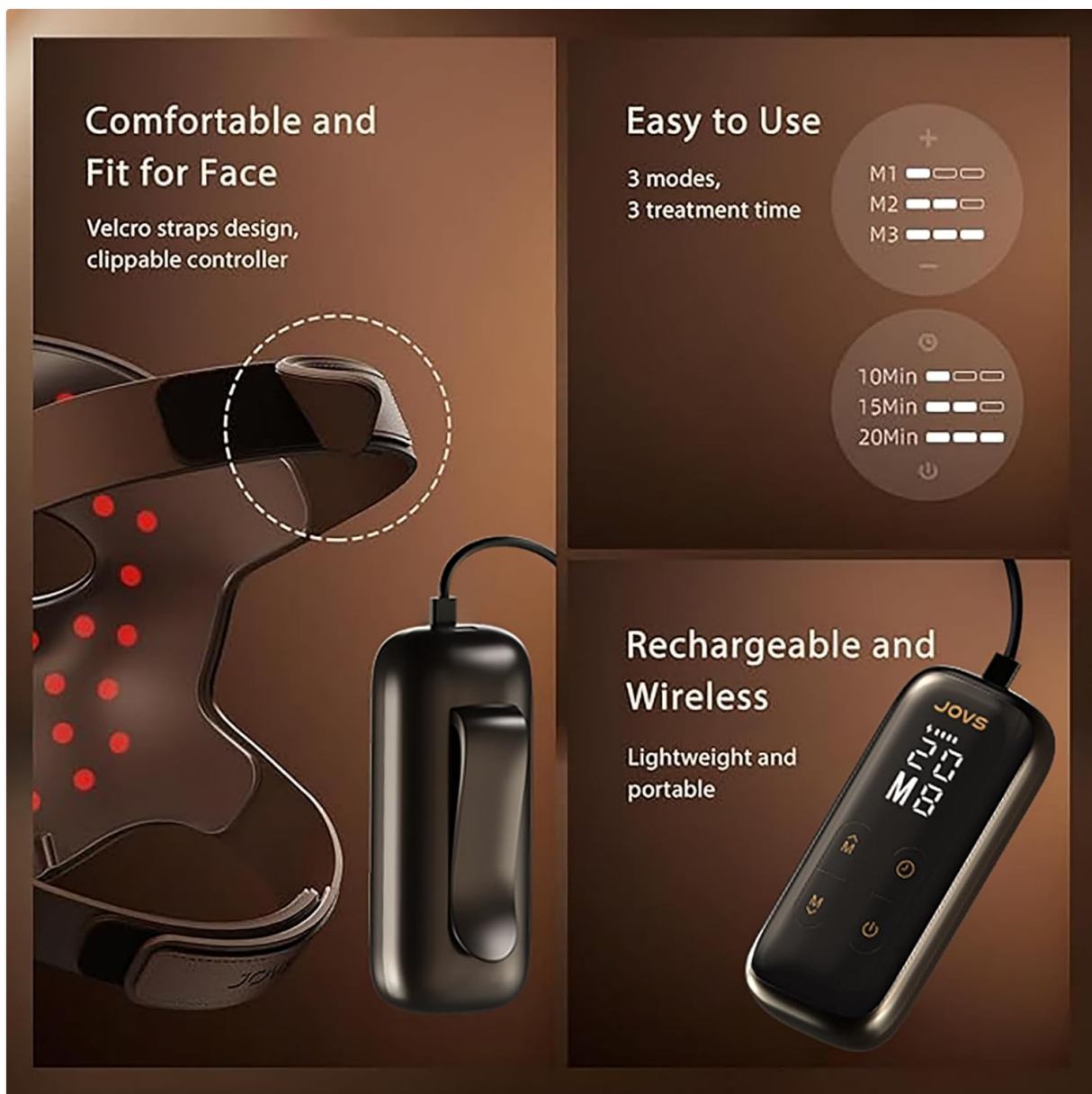
Figure 3.1: The mask's comfortable fit with velcro straps, the clip-on controller, and its rechargeable, wireless design for ease of use.