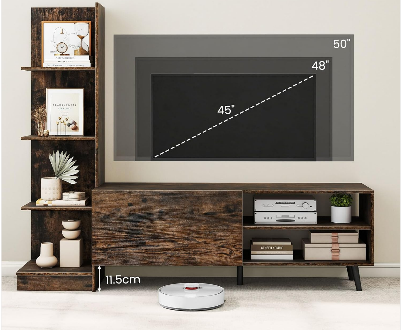
Figure 3: TV Size Accommodation. This image demonstrates how the TV stand can comfortably hold televisions up to 50 inches, with examples for 45 and 48-inch TVs.