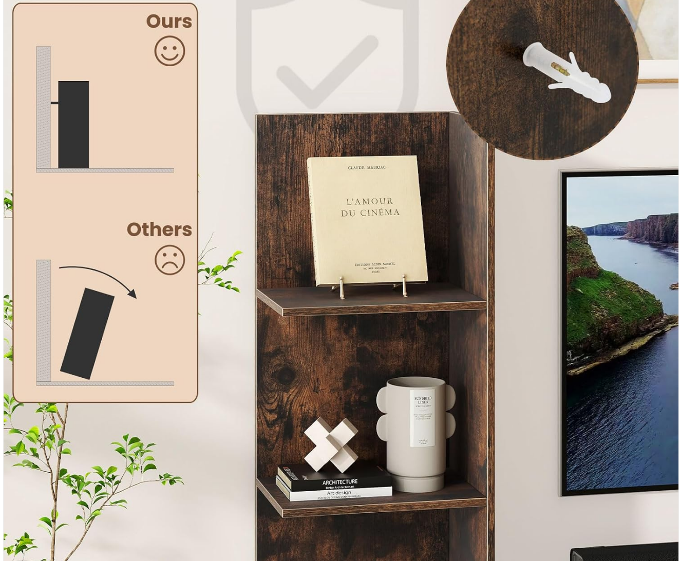
Figure 1: Anti-Tipping Kit Installation. This image illustrates the proper method for installing the anti-tipping kits to enhance stability and safety, preventing the unit from falling forward.

Prevent the TV cabinet from tipping over