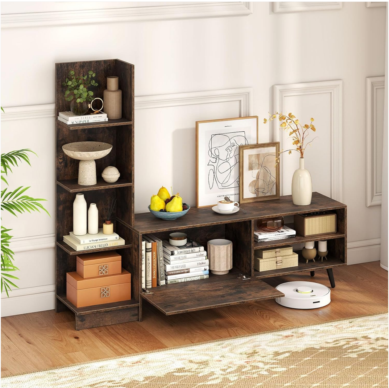
Figure 2: Assembled TV Stand. A view of the fully assembled TV stand, showcasing its rustic brown finish and functional design with a television, media devices, and decorative items.