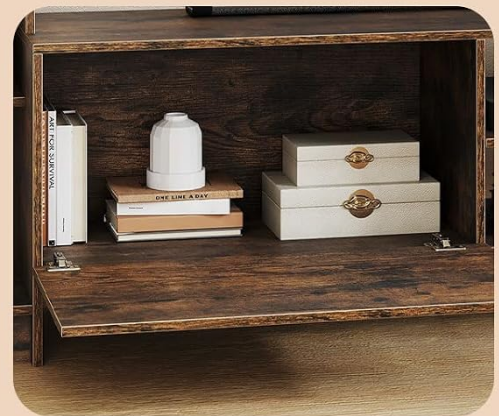
Spacious Middle Cabinet