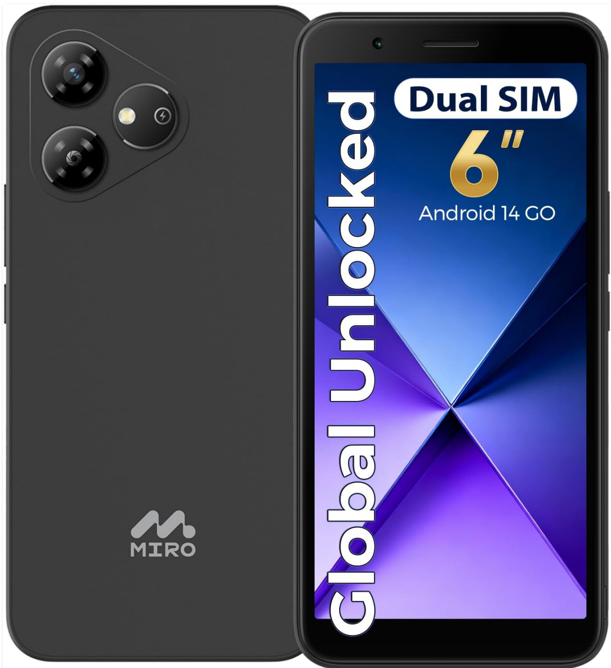
Figure 1: MIRO A1 Smartphone