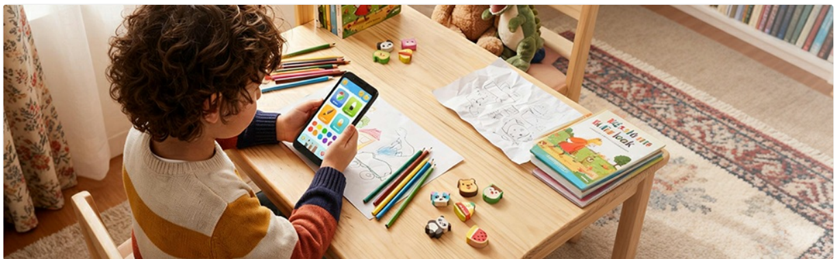
Figure 6: Expandable Storage