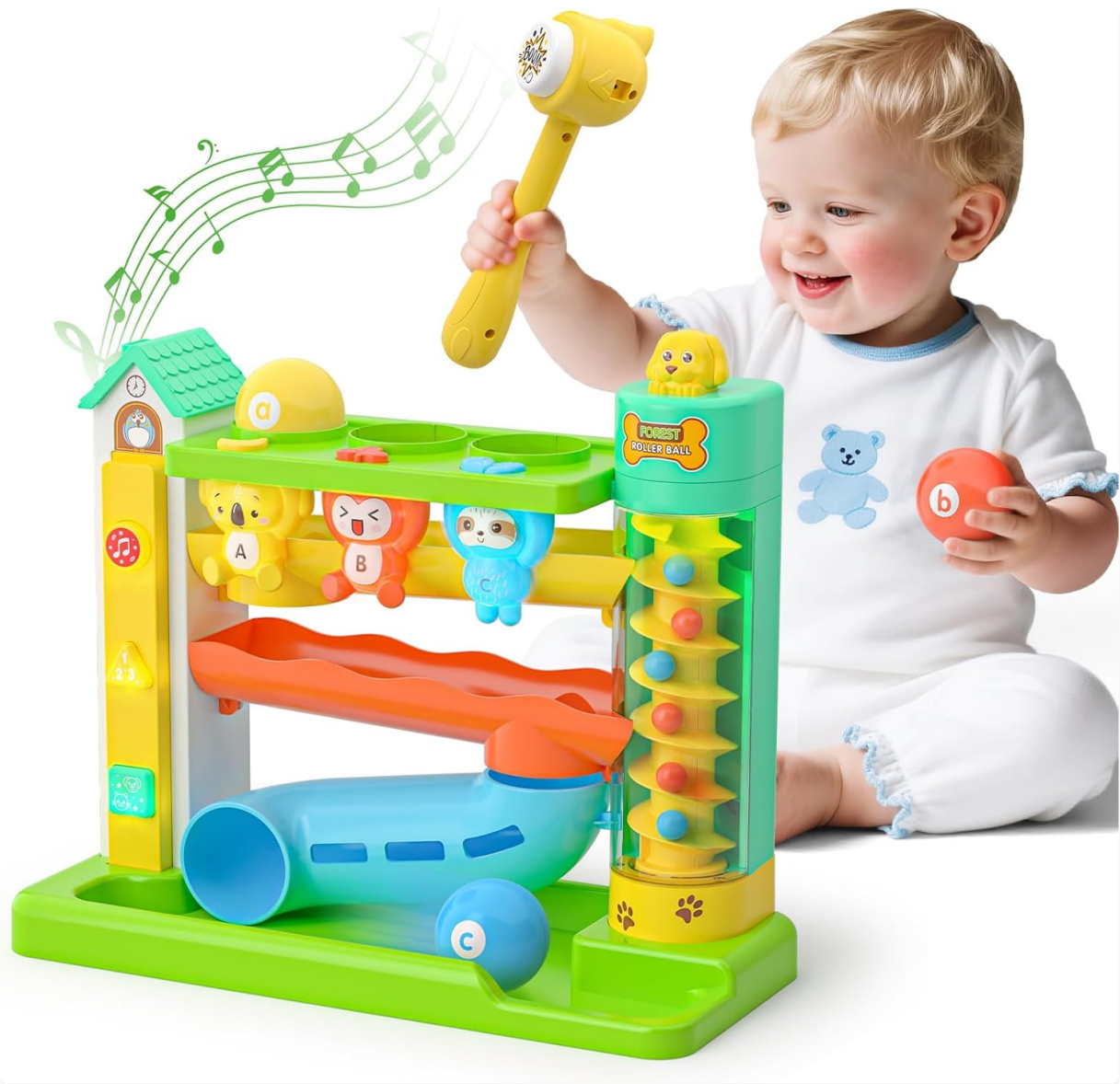
Image: A baby interacting with the Zardali Musical Pound-A-Ball Development Toy.