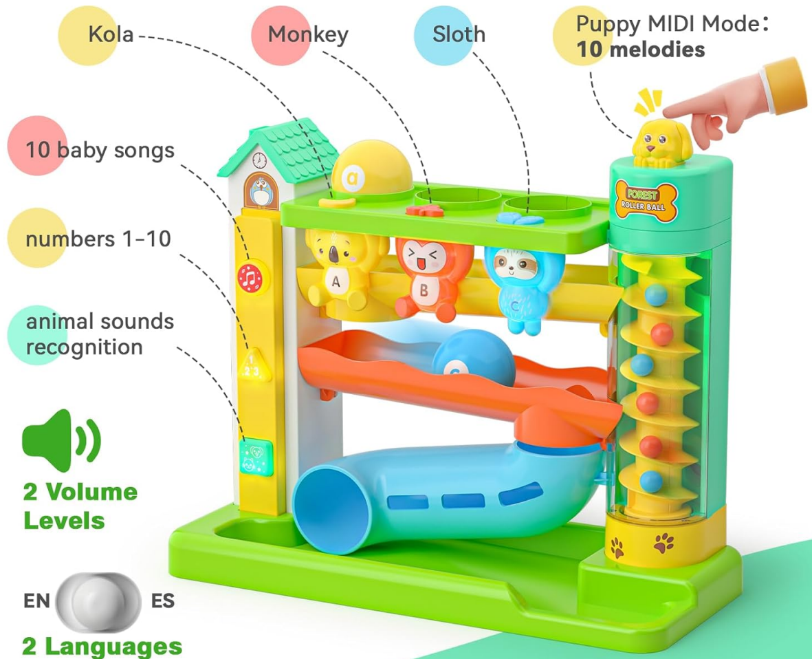
Image: Overview of the toy's bilingual and musical features.