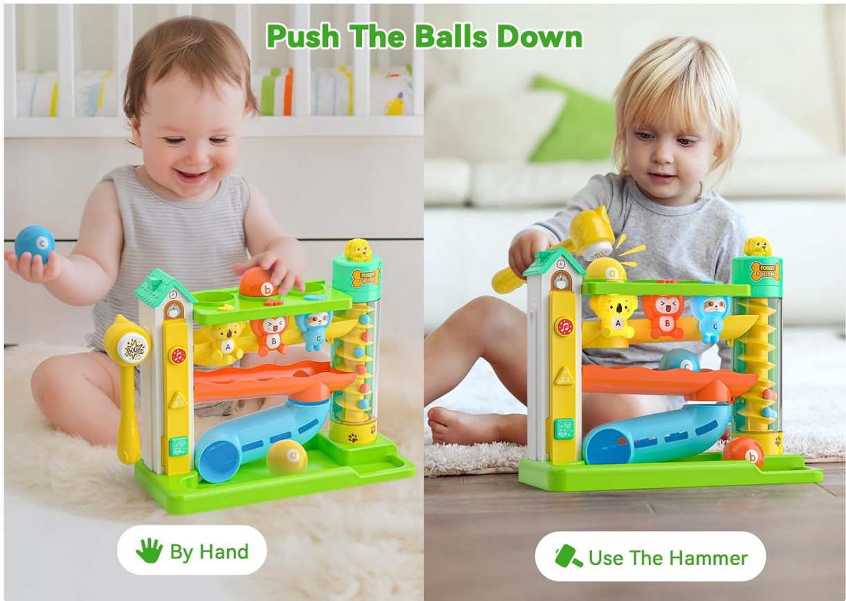
Image: Children demonstrating how to push balls by hand and use the hammer.