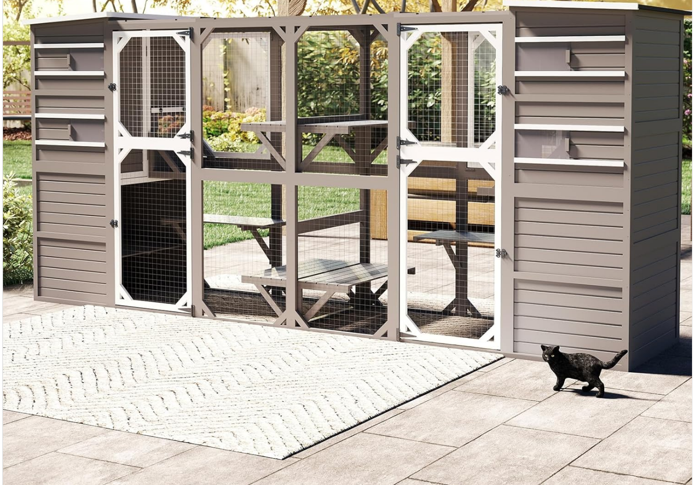
Figure 6: An example of two catio units linked together, illustrating the expandable design for increased space and enrichment.