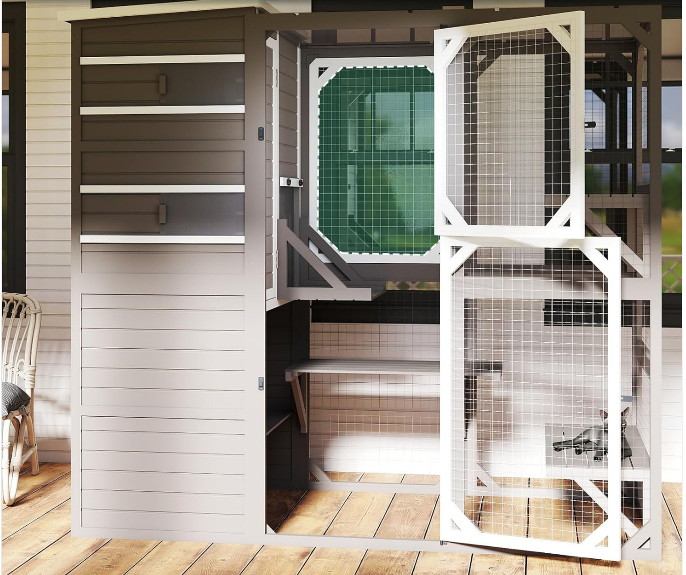
Figure 5: The catio demonstrating its window connection feature, allowing cats safe and easy access between indoor and outdoor environments.

Give Your Pets the Freedom to Come & Go!