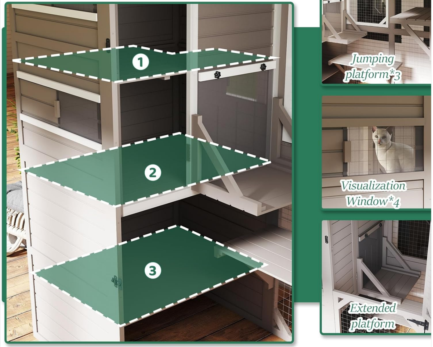
Figure 3: Illustration of the spacious multi-tier interior, highlighting the three jumping platforms and visualization windows for cat activity.