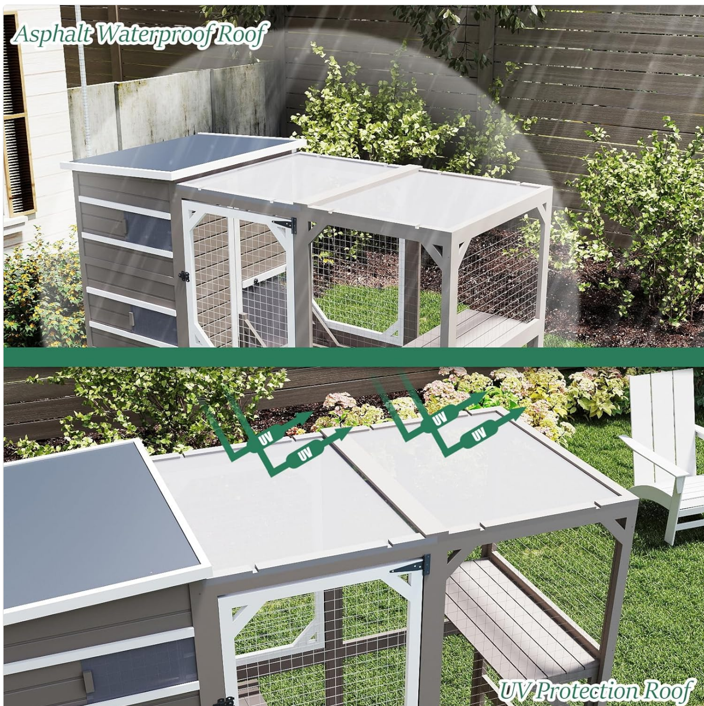
Figure 4: Detail of the catio roof, demonstrating the asphalt waterproof layer and UV protection panels for all-weather durability.