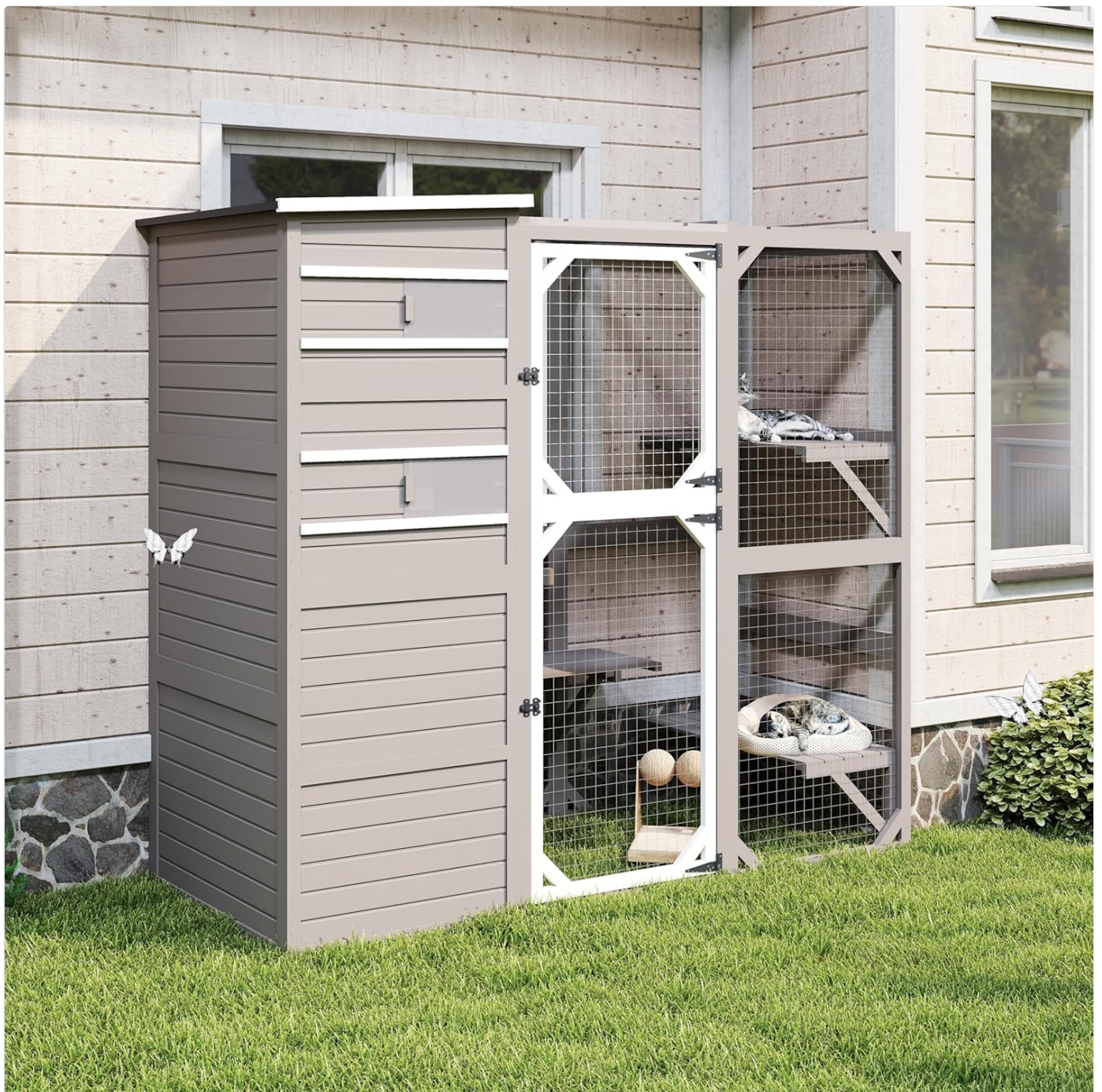
Figure 1: The MagazooPet Large Outdoor Catio Enclosure installed in a backyard, showcasing its design and integration with a home.