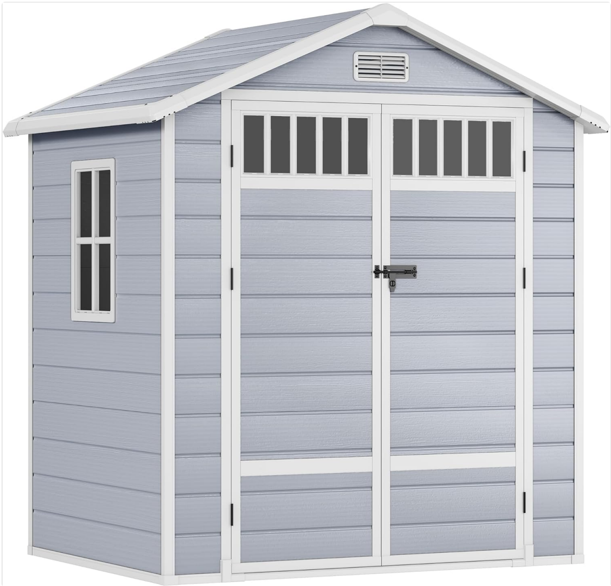
Image: The DWVO 6x4.4 FT Resin Storage Shed, showcasing its gray exterior and white trim.