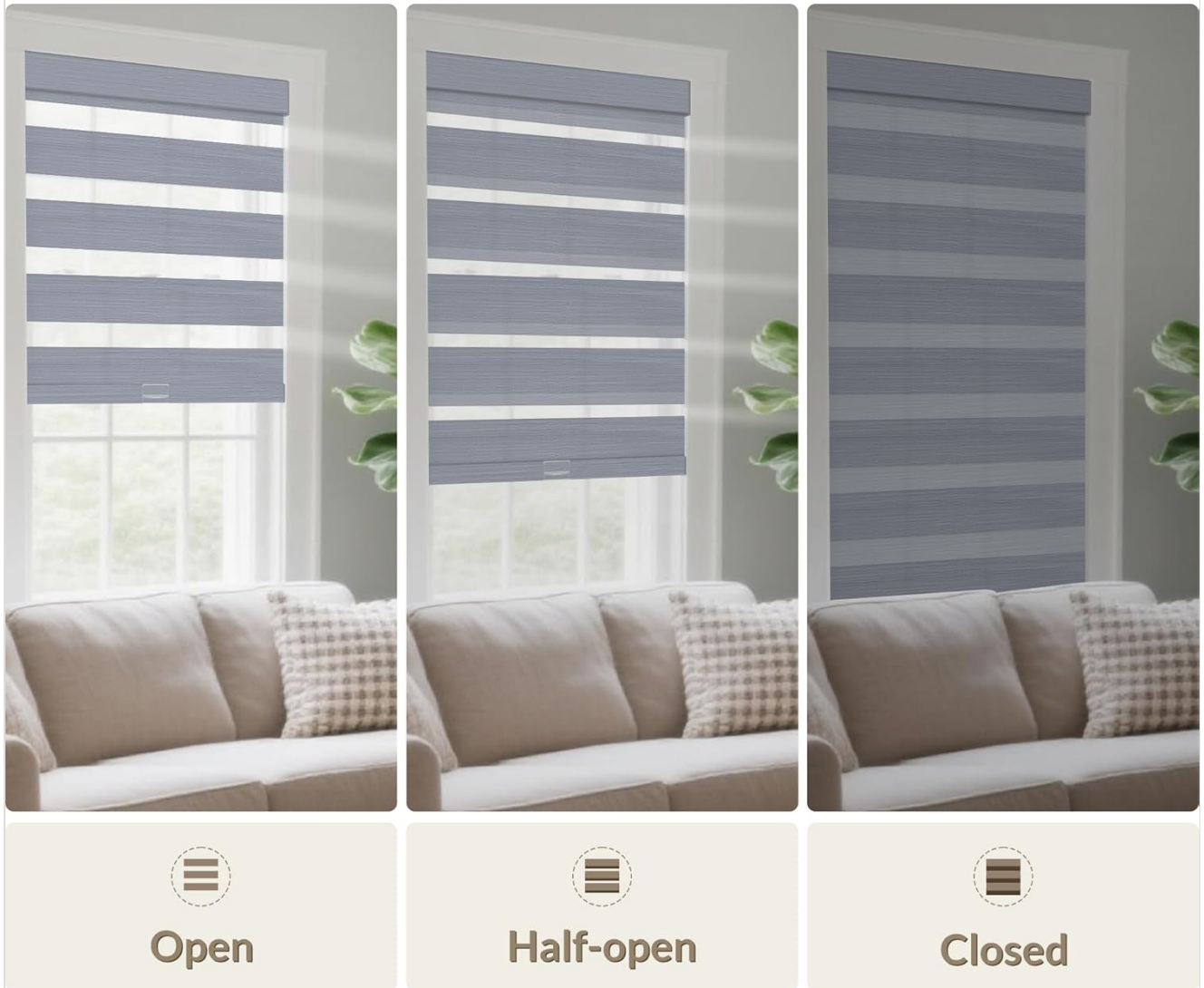
Image: Visual representation of the blinds in 'Open' (sheer and solid stripes aligned for maximum light), 'Half-open' (partially aligned for filtered light), and 'Closed' (solid stripes aligned for privacy and room darkening) positions.