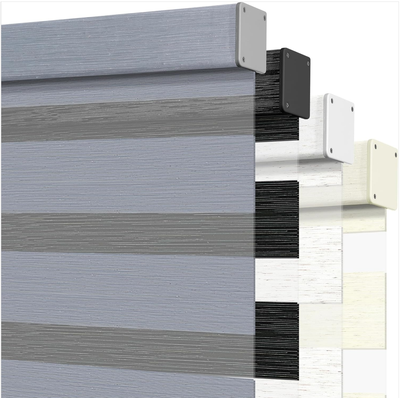
Image: Boolegon Linen Fabric Cordless Zebra Blinds in Grey, showcasing the layered fabric design.