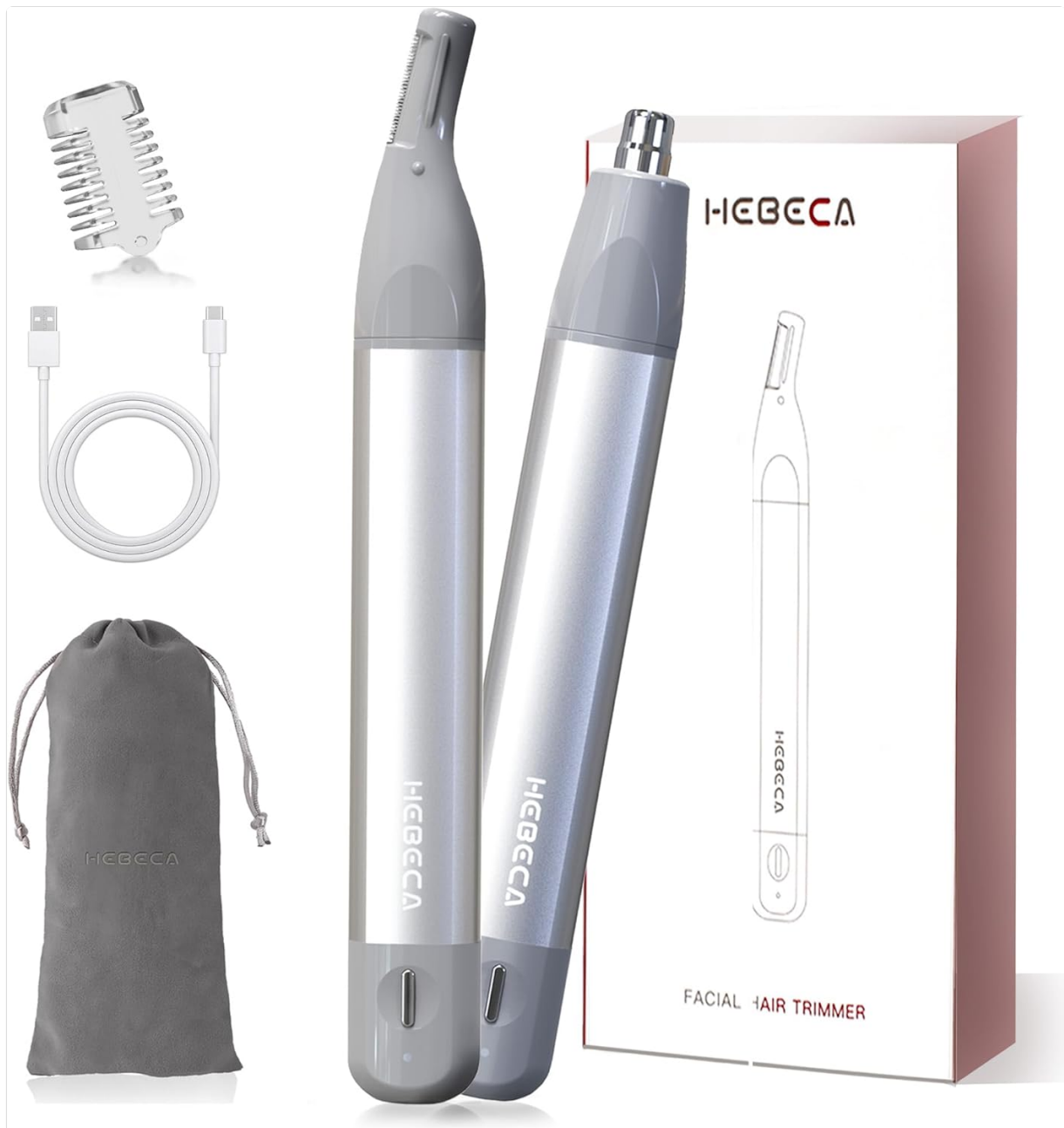
Image: The HEBECA FT2001 trimmer, showing both the nose/ear trimmer head and the eyebrow/facial hair trimmer head, along with the USB charging cable and travel pouch.