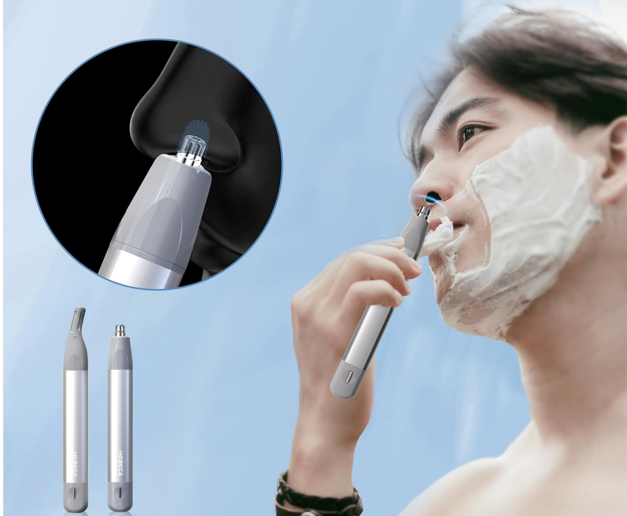
Image: A close-up view of the two interchangeable trimmer heads: the conical nose/ear trimmer head and the flat eyebrow/facial hair trimmer head.

Only cut short, not light Leave suitable nasal hair to protect nasal cavity