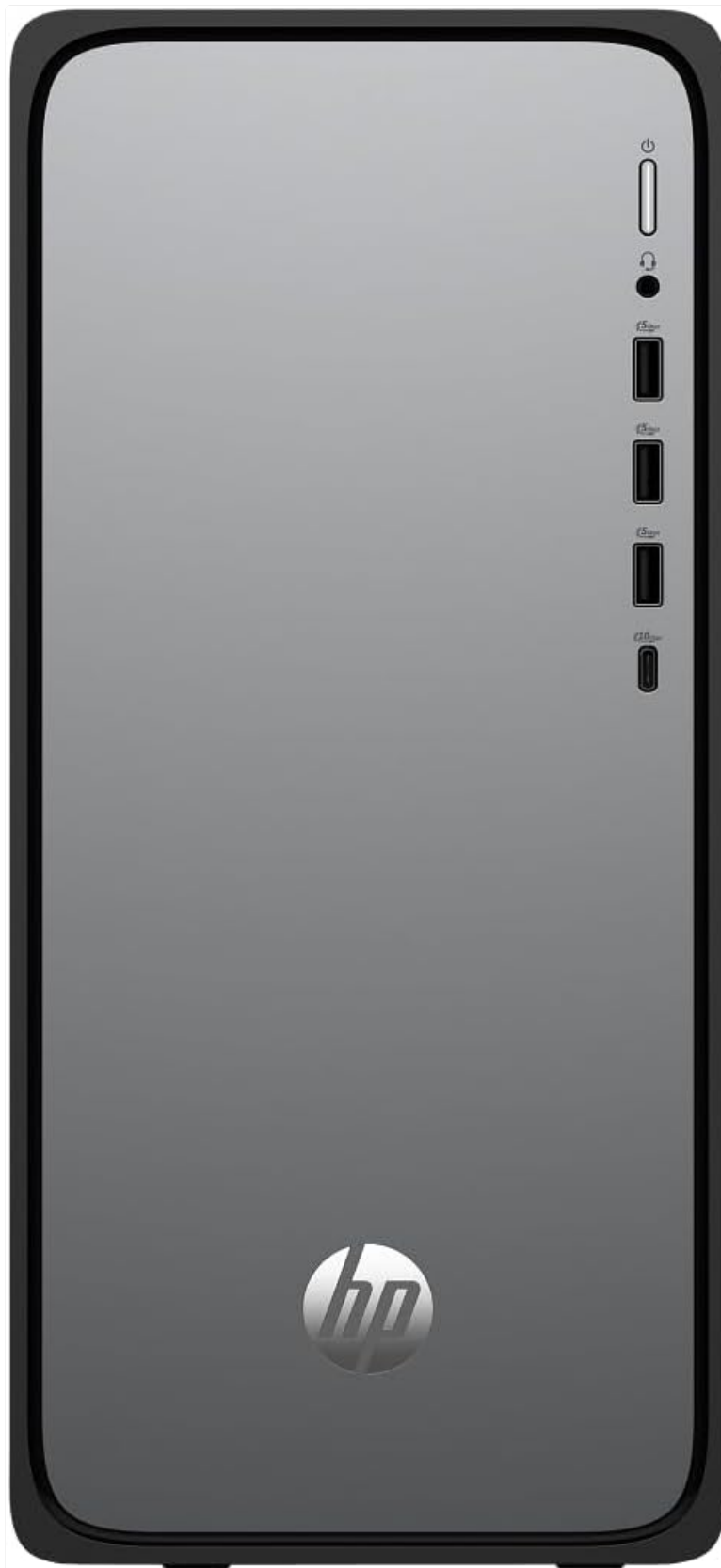
Figure 1: Front view of the HP OmniDesk Desktop PC. This image displays the sleek, meteor silver and jack black chassis with the HP logo prominently featured. The front panel includes several USB ports and a headphone/microphone combo jack for easy access.