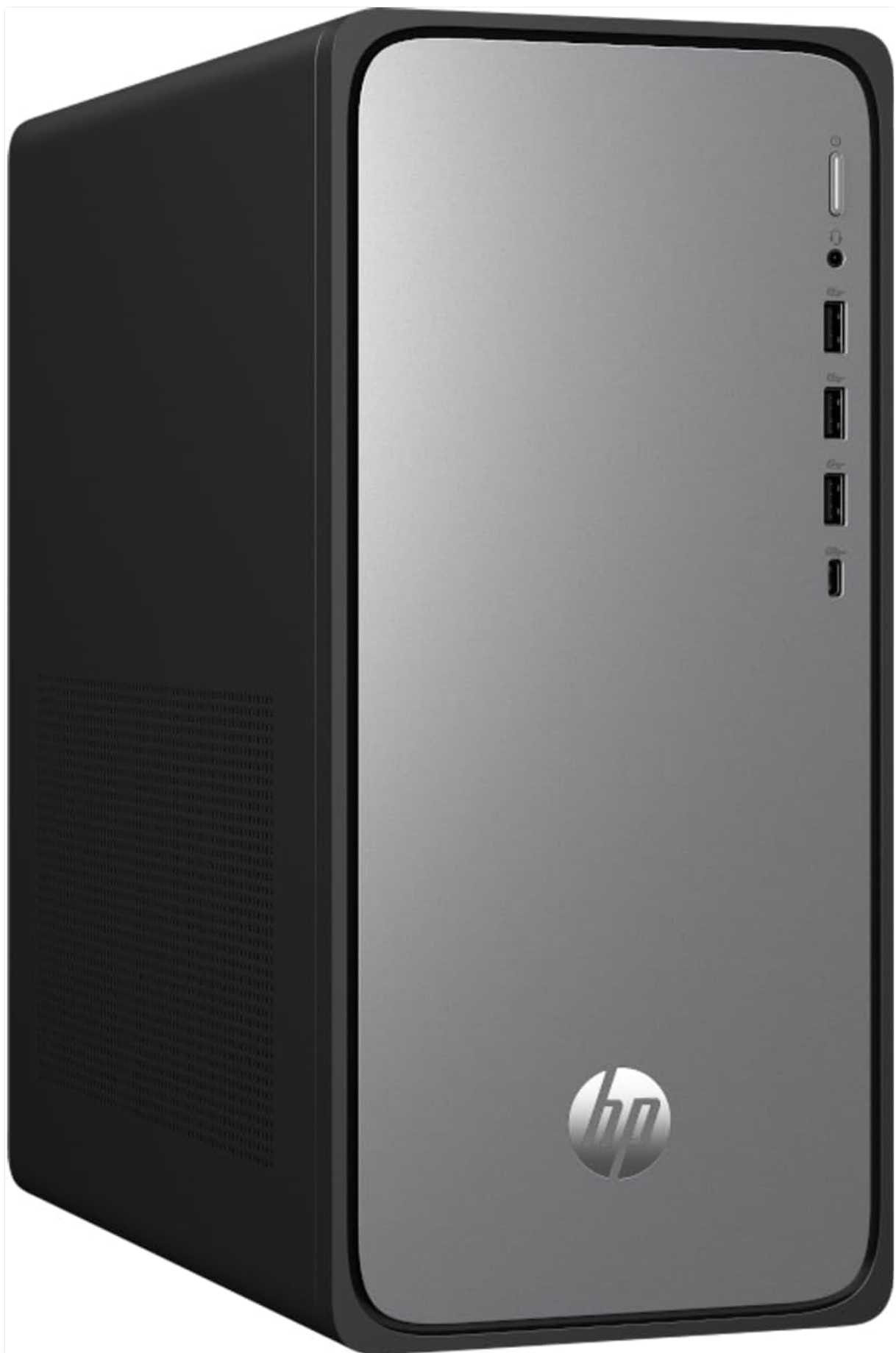
Figure 2: Angled view of the HP OmniDesk Desktop PC. This perspective highlights the side ventilation and the overall compact design of the desktop tower, showcasing its modern aesthetic.