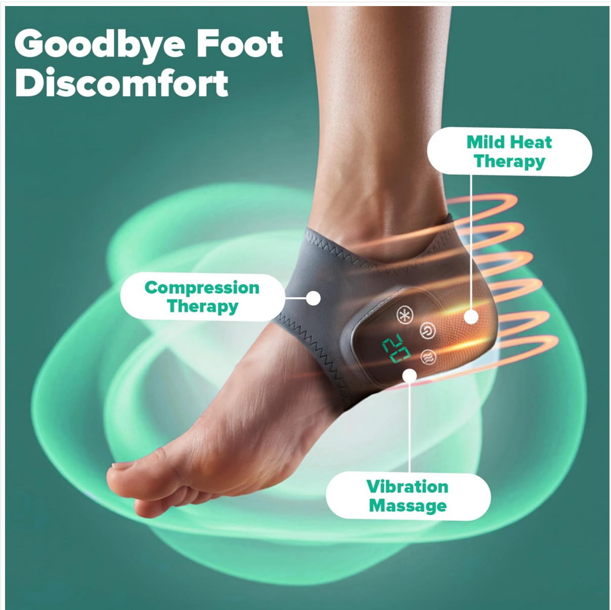
Image 2.2: Illustration of the massager's triple method design, highlighting mild heat therapy, compression therapy, and vibration massage on the foot and ankle.