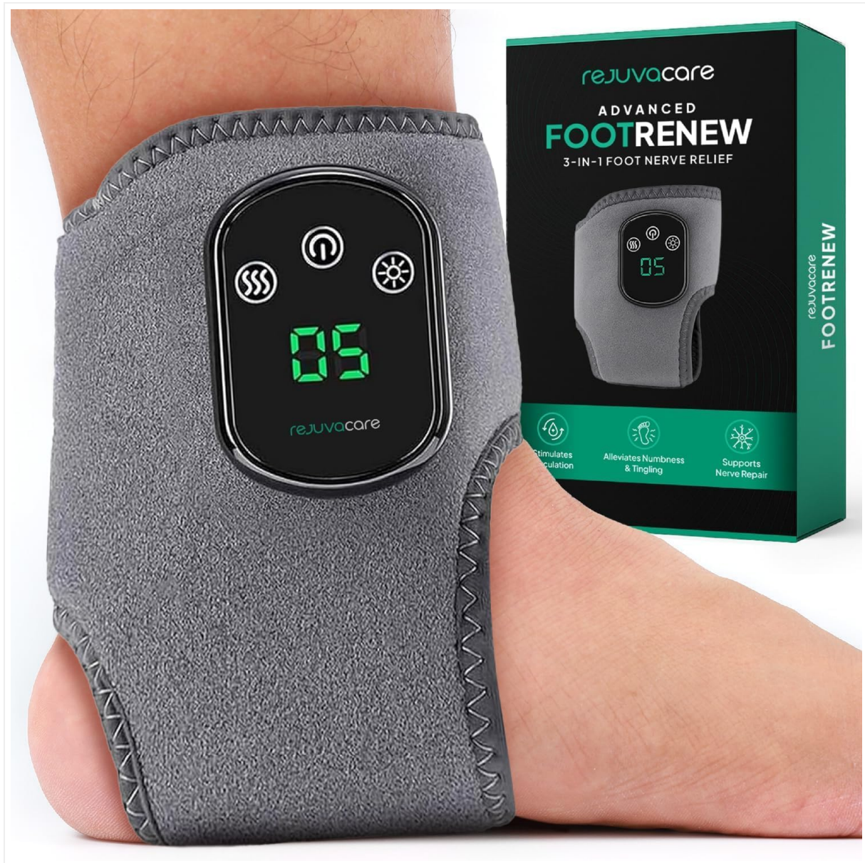
Image 2.1: The Rejuvacare FootRenew Triple Method Massager and its retail packaging.

The Rejuvacare FootRenew Triple Method Massager is designed to provide comfort and relief to your feet and ankles. It combines heat, vibration, and compression in a single, portable wrap. This device features simple controls for adjusting settings to your personal preference.