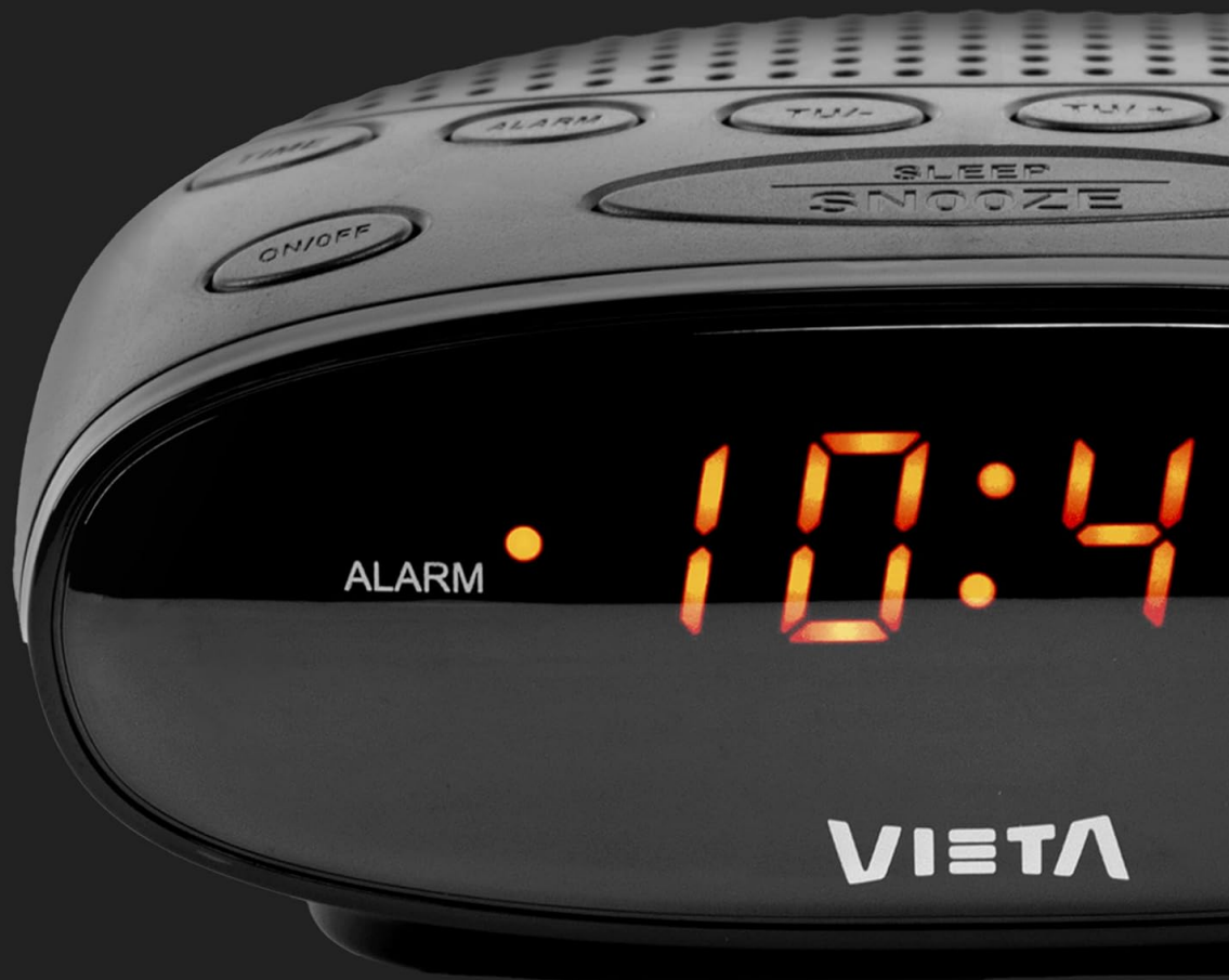
Figure 6.2: The LED display with the ALARM indicator illuminated, signifying an active alarm.