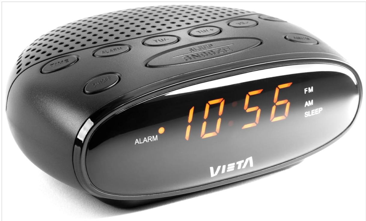
Figure 4.2: Angled view of the Vieta Pro VHAL100, highlighting the top control buttons and speaker grill.