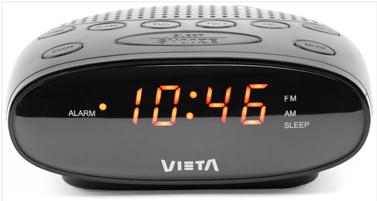
Figure 4.1: Front view of the Vieta Pro VHAL100 Digital Alarm Clock Radio, showing the red LED display and top-mounted control buttons.