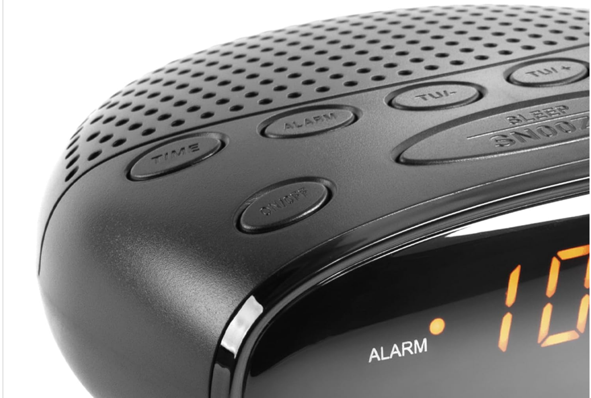
Figure 6.1: Detail of the integrated 40mm speaker, providing clear audio for radio playback and alarms.